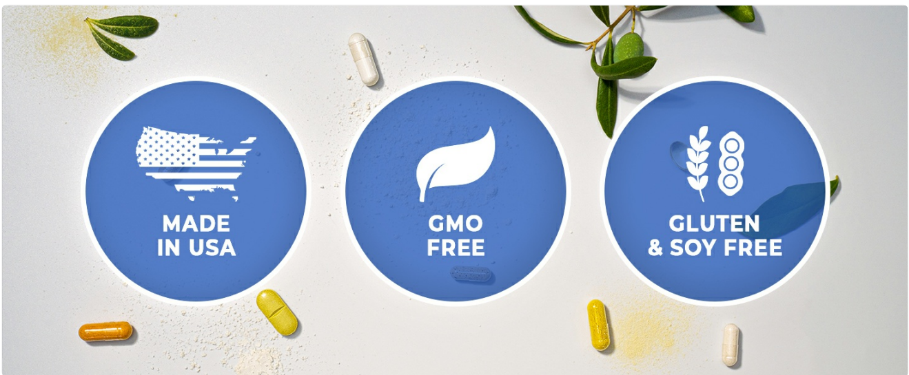
Image 2.2: Icons indicating the product is Made in USA, GMO Free, and Gluten & Soy Free.