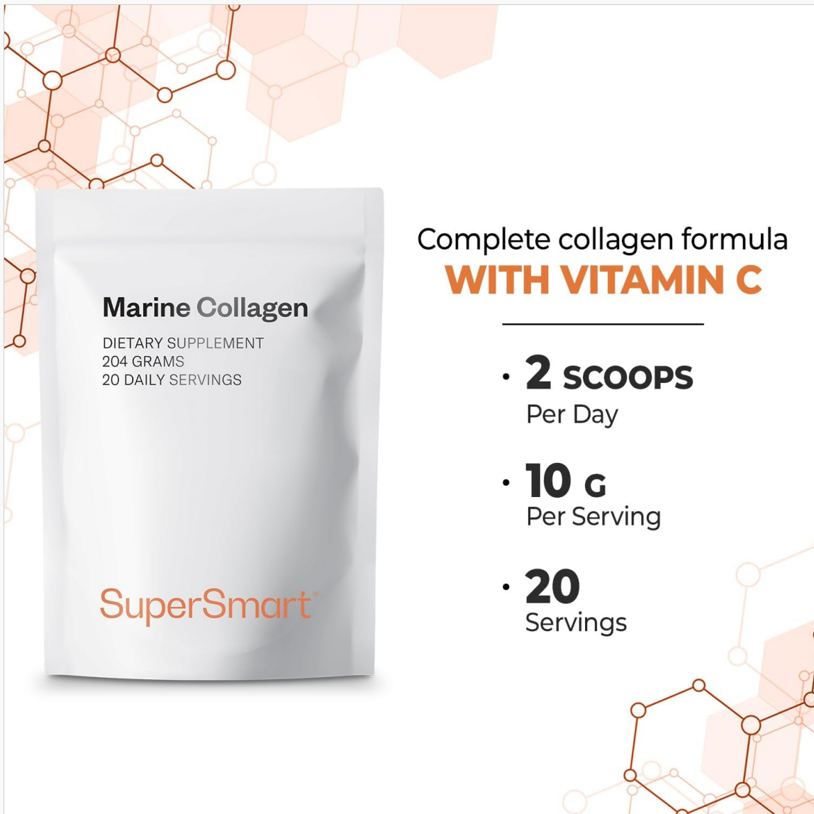
Image: Graphic showing the product packaging alongside text indicating "Complete collagen formula WITH VITAMIN C", "2 scoops Per Day", "10 G Per Serving", and "20 Servings".