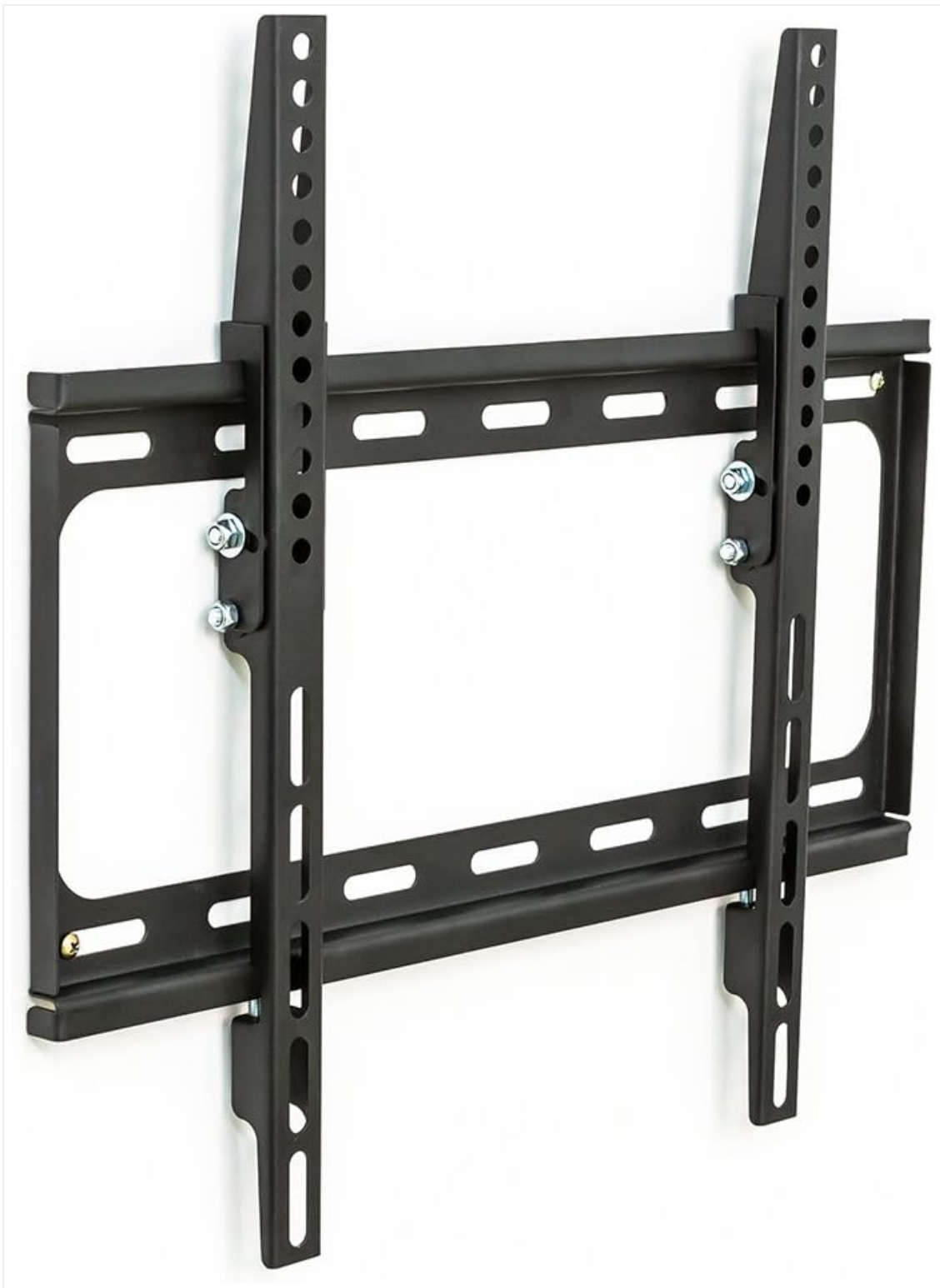
Figure 5.2: Side View of Wall Mount