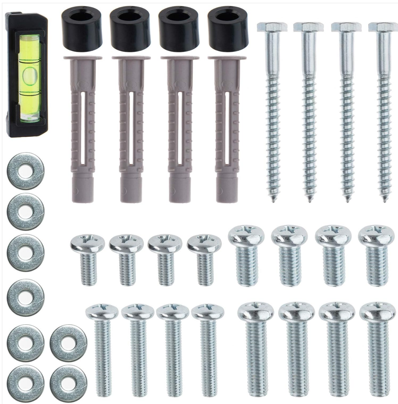
Figure 3.1: Included Mounting Hardware