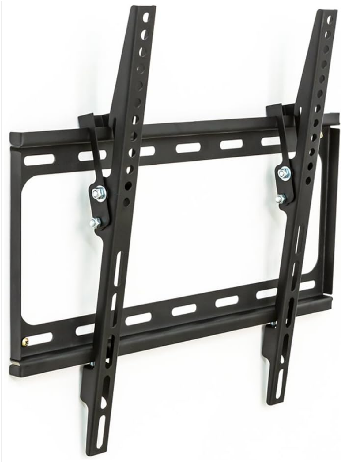
Figure 5.1: Assembled Wall Mount