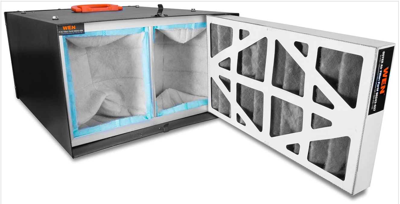
Image: The WEN 3410 Air Filtration System with the outer 5-micron filter partially removed, showing the inner filter compartment.

The frequency of filter replacement depends on usage and the dustiness of your environment. Regularly inspect filters for buildup.