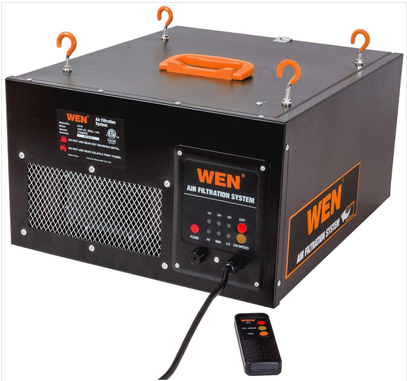
Image: Close-up of the WEN 3410 Air Filtration System's control panel, showing the power, speed, and timer buttons, along with the included remote control.