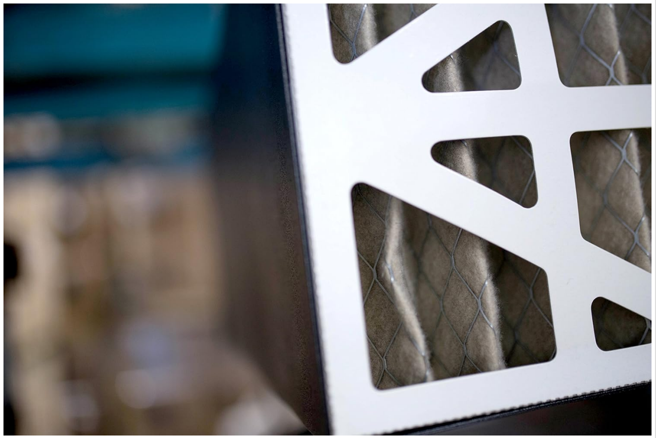
Image: A close-up view of the filter material, showing its fibrous texture designed to capture fine particles.