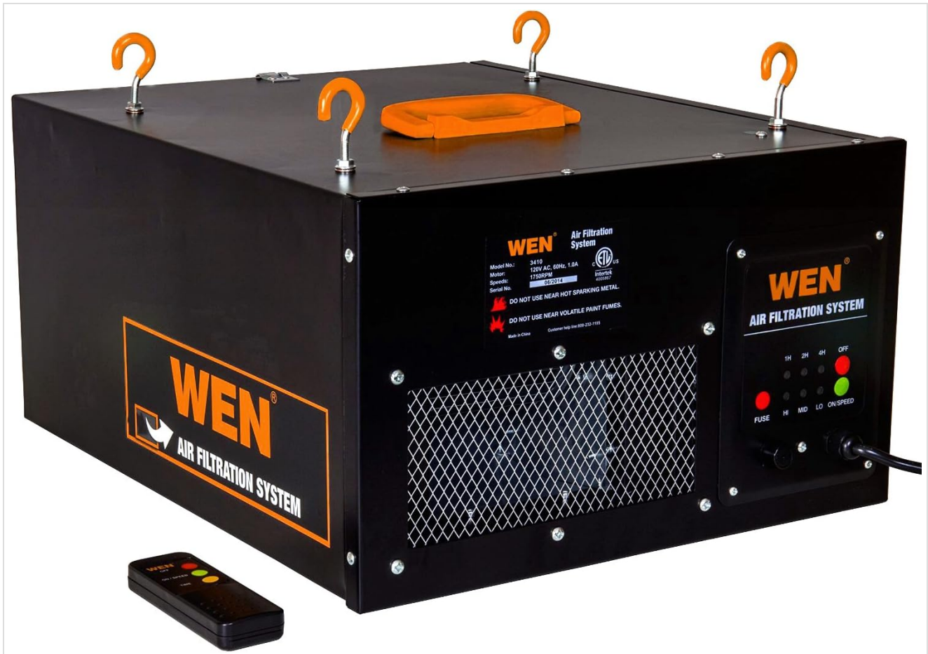
Image: The WEN 3410 Air Filtration System, showing the top with pre-installed eye bolts for hanging.