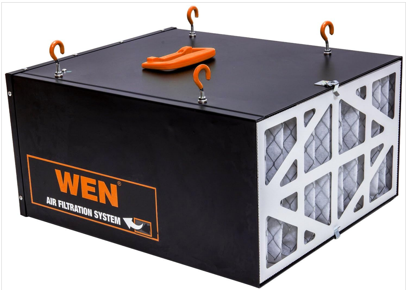
Image: Side view of the WEN 3410 Air Filtration System with the filter access panel open, revealing the internal filters.

Video: An official WEN video demonstrating the features and setup of the WEN 3410 Air Filtration System, including its remote control and filter system.