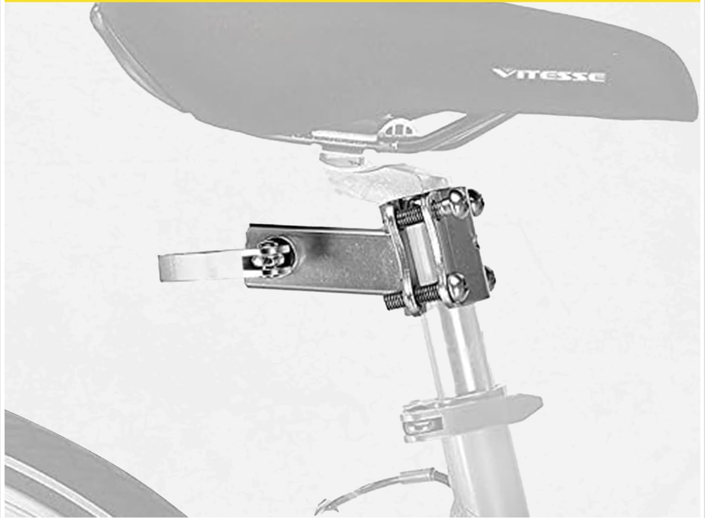
Image: The hitch clamp securely fastened to a bicycle seat post, demonstrating its universal fit.

This hitch fits a wide range of bicycle models