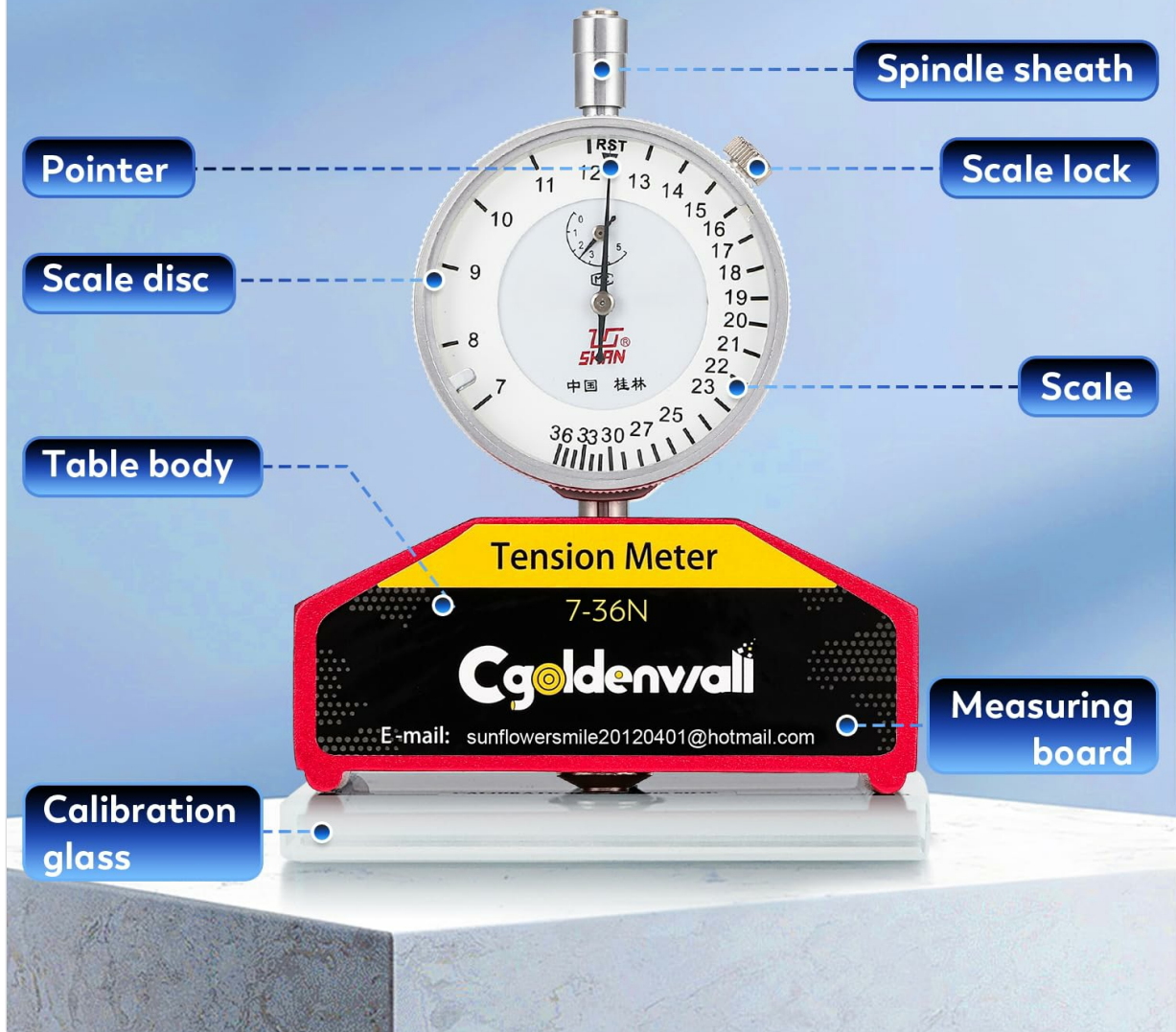
Image 2.2: Diagram illustrating the main components of the tension meter, including the spindle sheath, pointer, scale disc, table body, calibration glass, measuring board, scale, and scale lock.