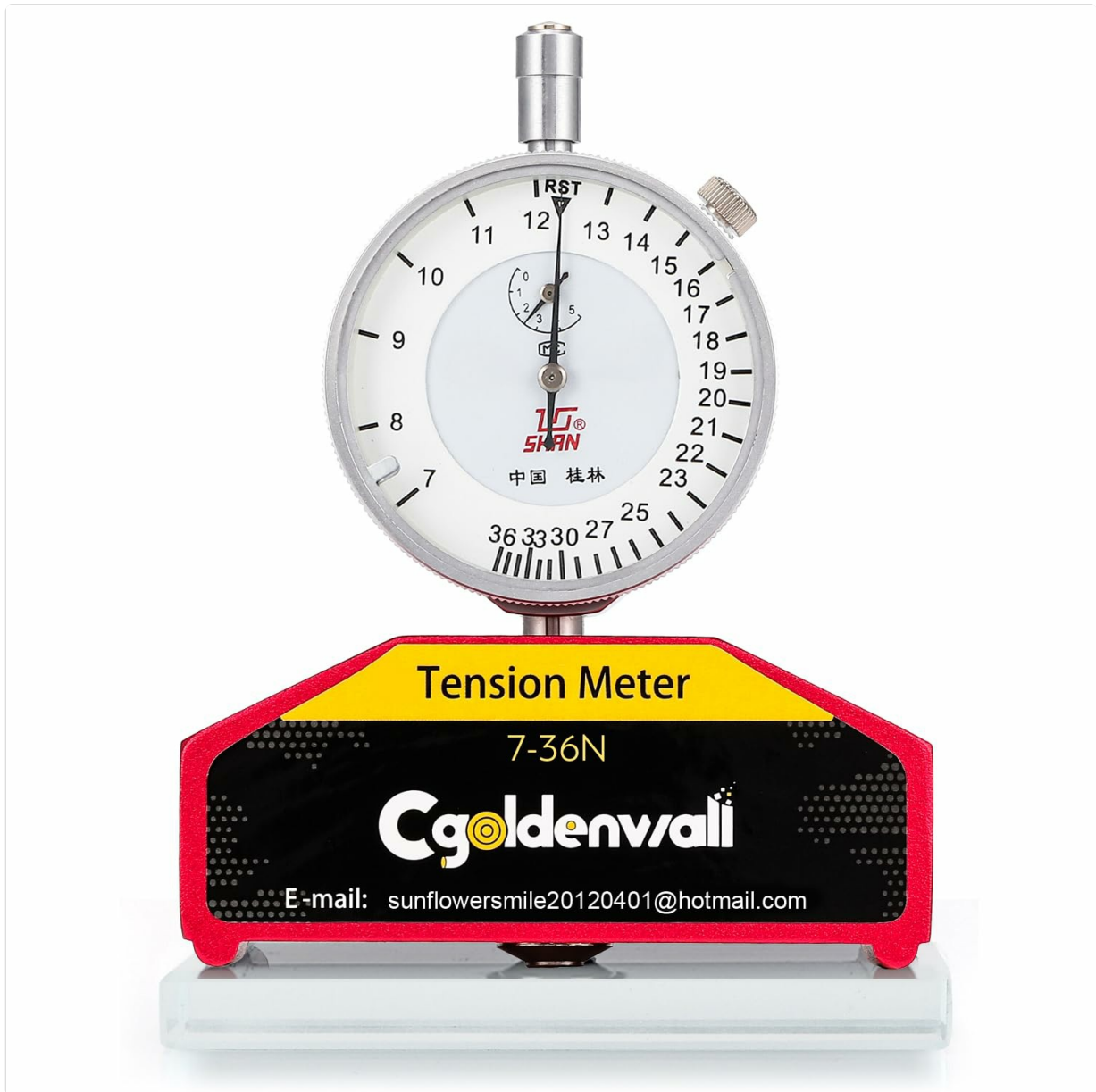
Image 1.1: CGOLDENWALL High Precision Silk Screen Printing Tension Meter.