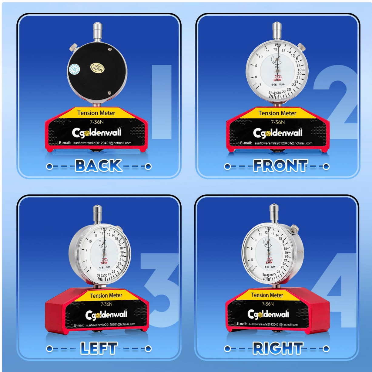
Image 2.3: Various perspectives of the tension meter, showing its front, back, left, and right sides.