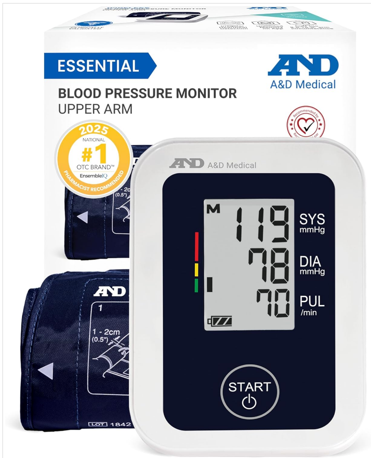
Image: The main product image of the A&D Medical UA-651CN monitor, clearly displaying a sample blood pressure reading