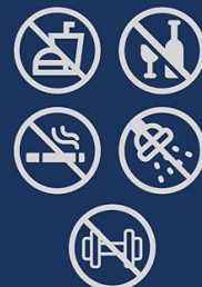
Image: A visual guide detailing the recommended posture and activities to avoid before taking a blood pressure measurement to ensure accuracy.