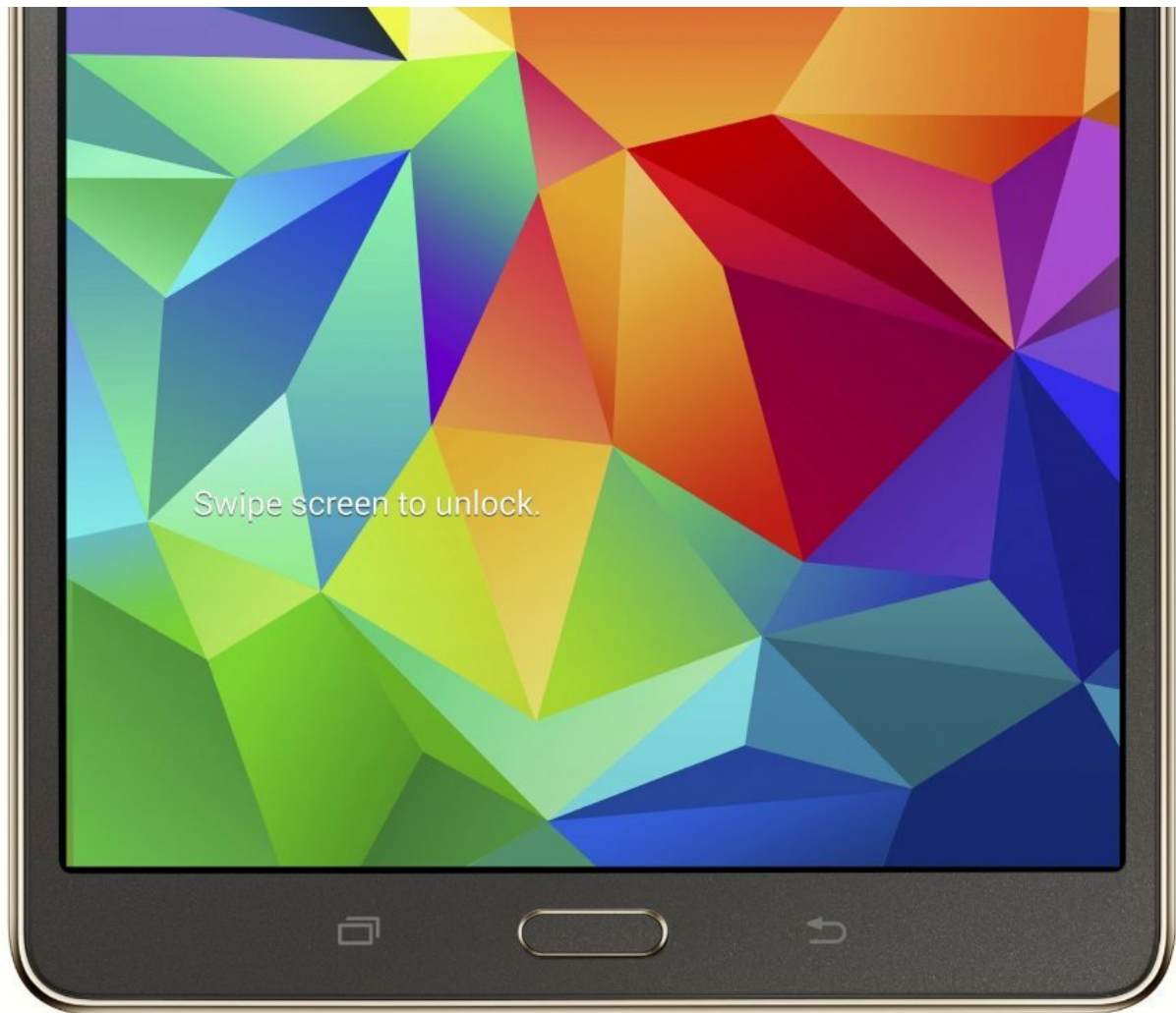
Figure 1: Front view of the Samsung Galaxy Tab S T705 tablet.