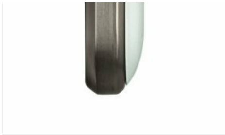
Figure 2: Side view of the tablet with ports, including the microSD slot (not explicitly visible but typically near the USB port).