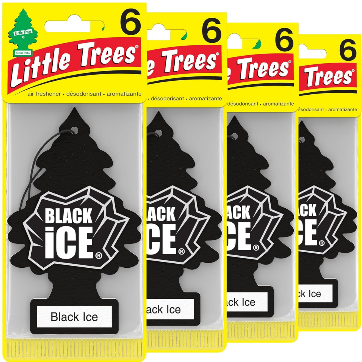
Image: LITTLE TREES Black Ice Air Fresheners, 4 Count (Pack of 6).