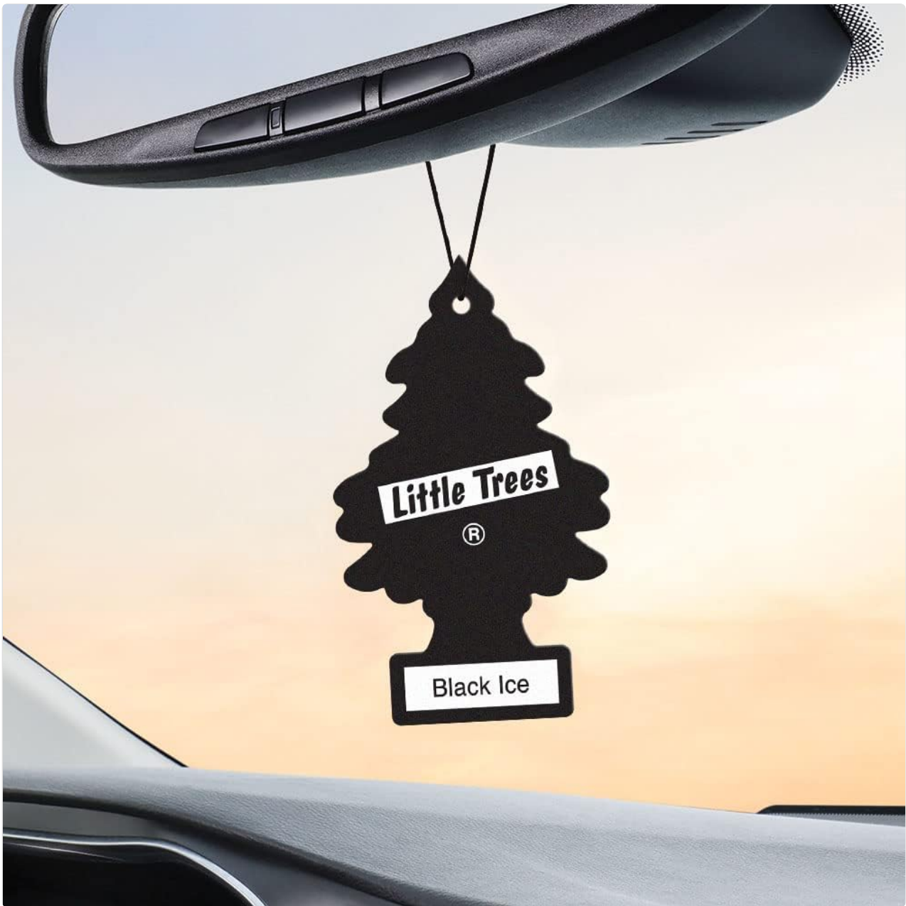
Image: Air freshener properly hung in a vehicle.