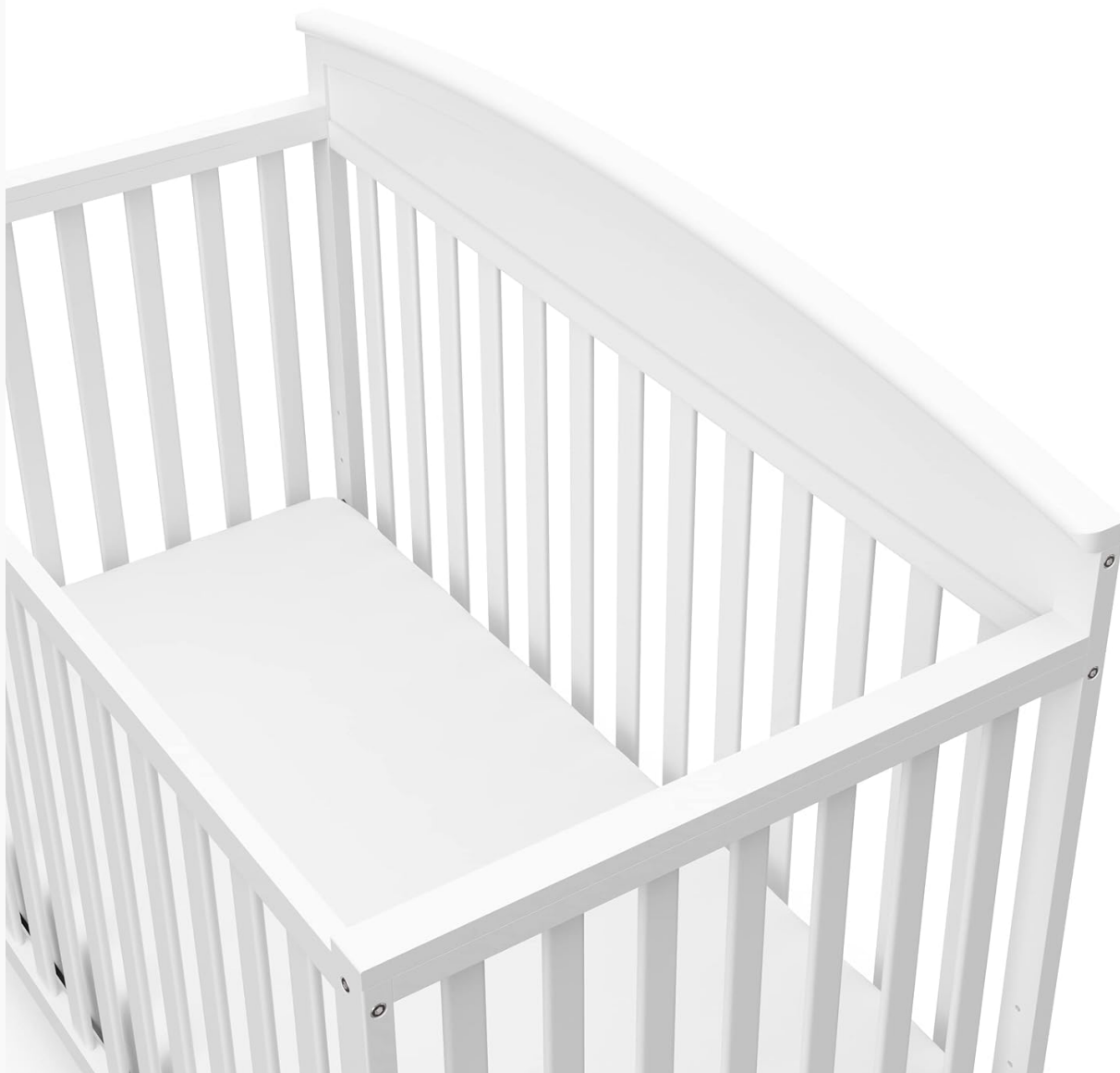
Image: The Graco Benton Crib highlighting its GREENGUARD Gold and JPMA safety certifications.

For detailed safety warnings, please refer to the official installation manual and product labeling.