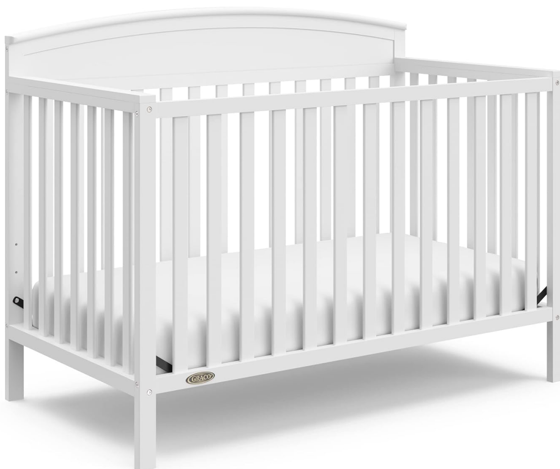
Image: The Graco Benton 5-in-1 Convertible Crib in its standard crib configuration, showcasing its clean white finish and sturdy design.