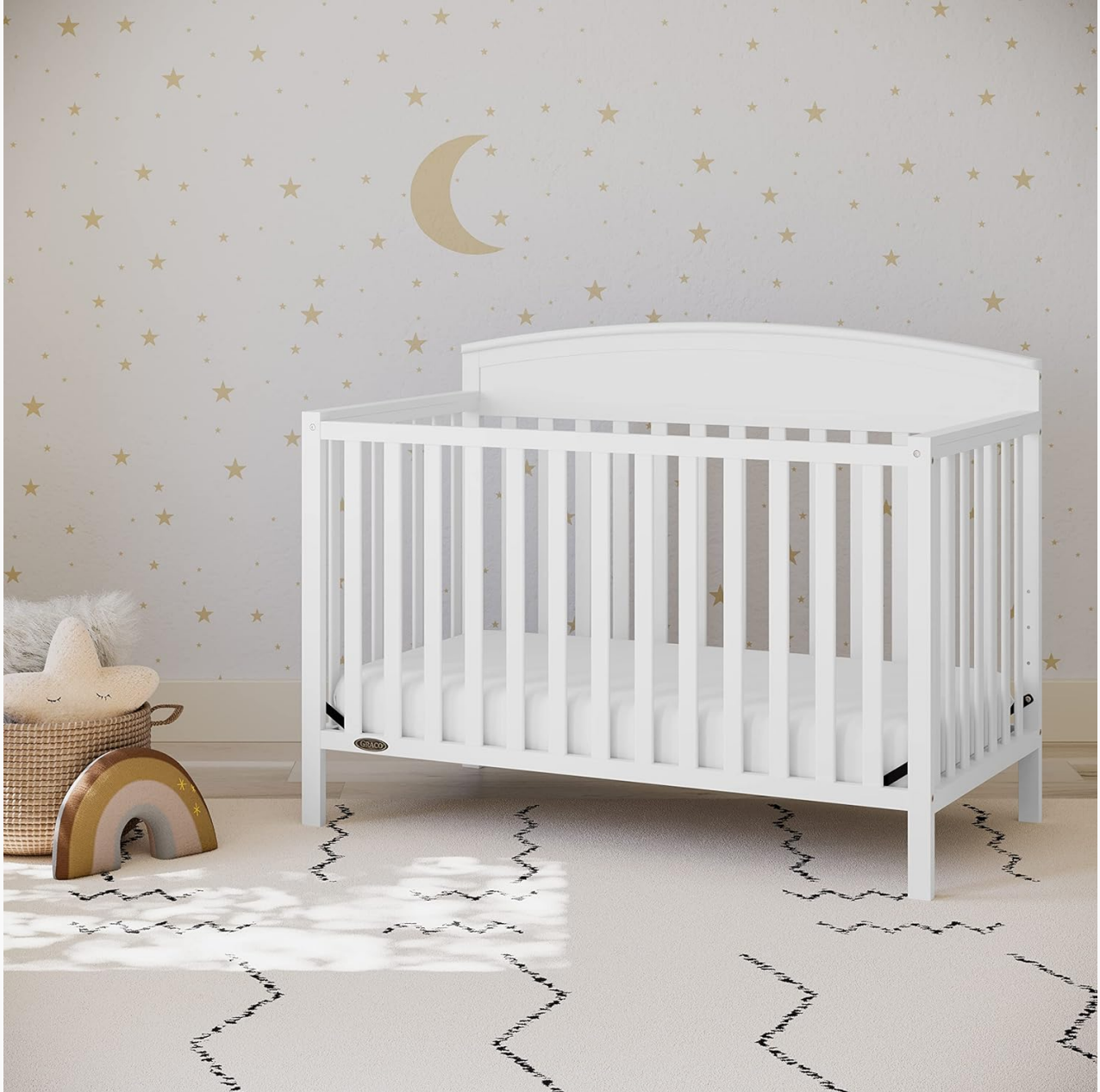
Image: A front view of the Graco Benton Crib, illustrating its full assembly and classic design.

For a visual guide to assembly, you may refer to the official Installation Manual PDF available at Graco Benton Installation Manual .