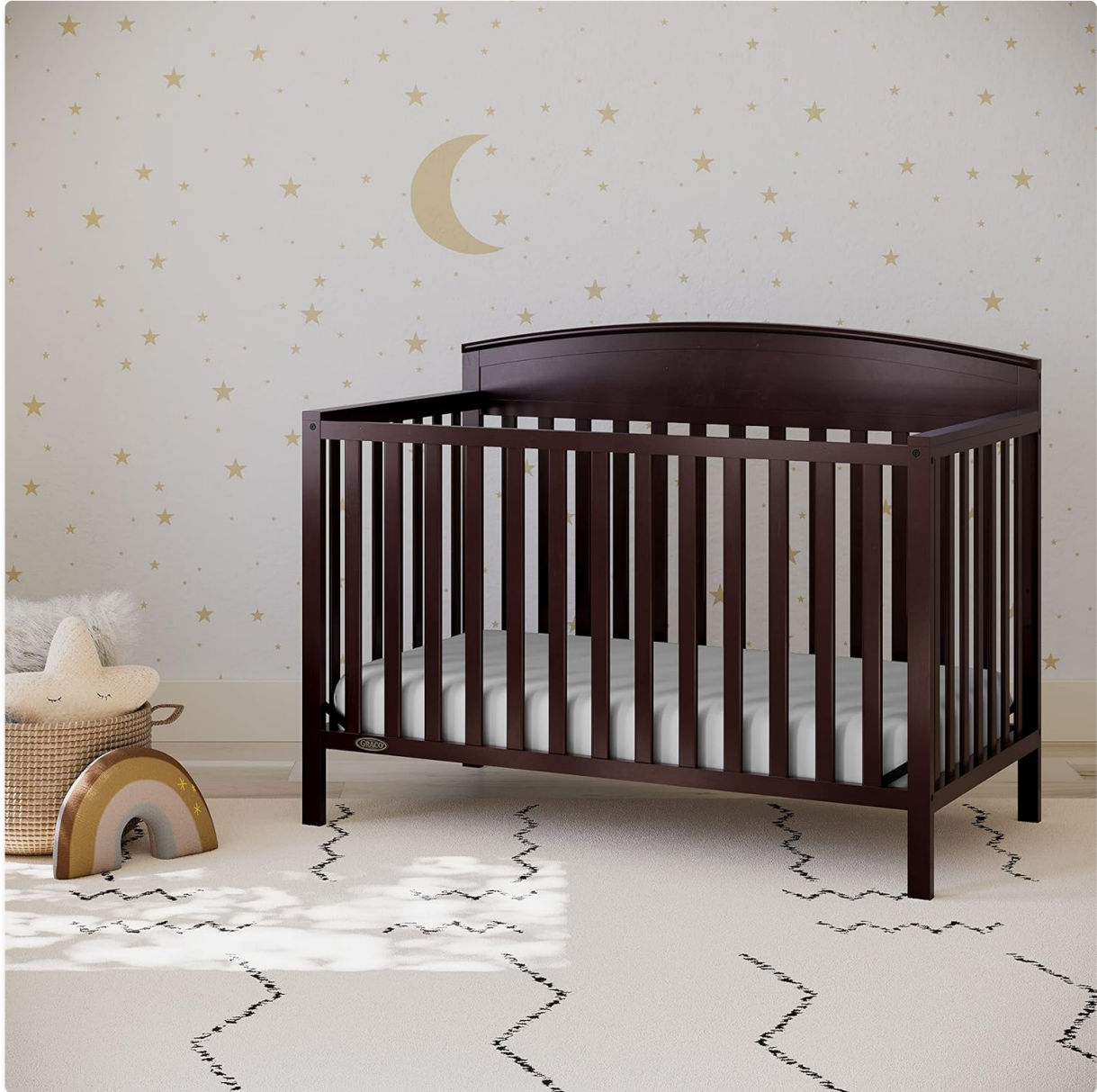
Image: Front view of the assembled Graco Benton Crib, ready for use.