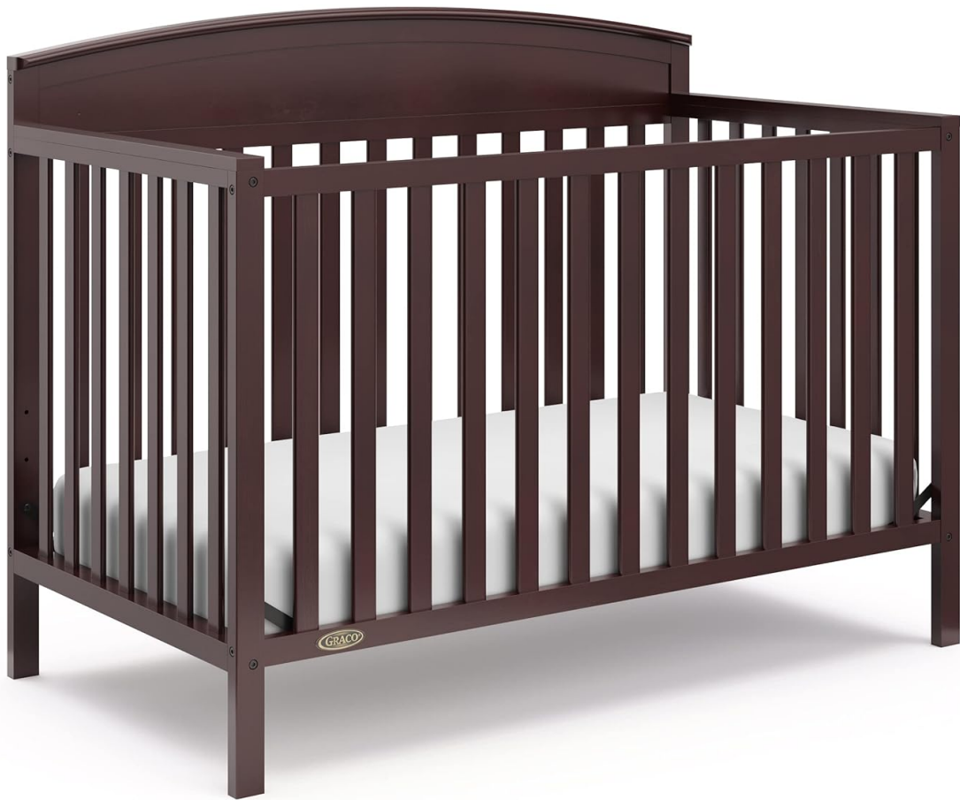
Image: The Graco Benton 5-in-1 Convertible Crib in Espresso, showcasing its classic design.