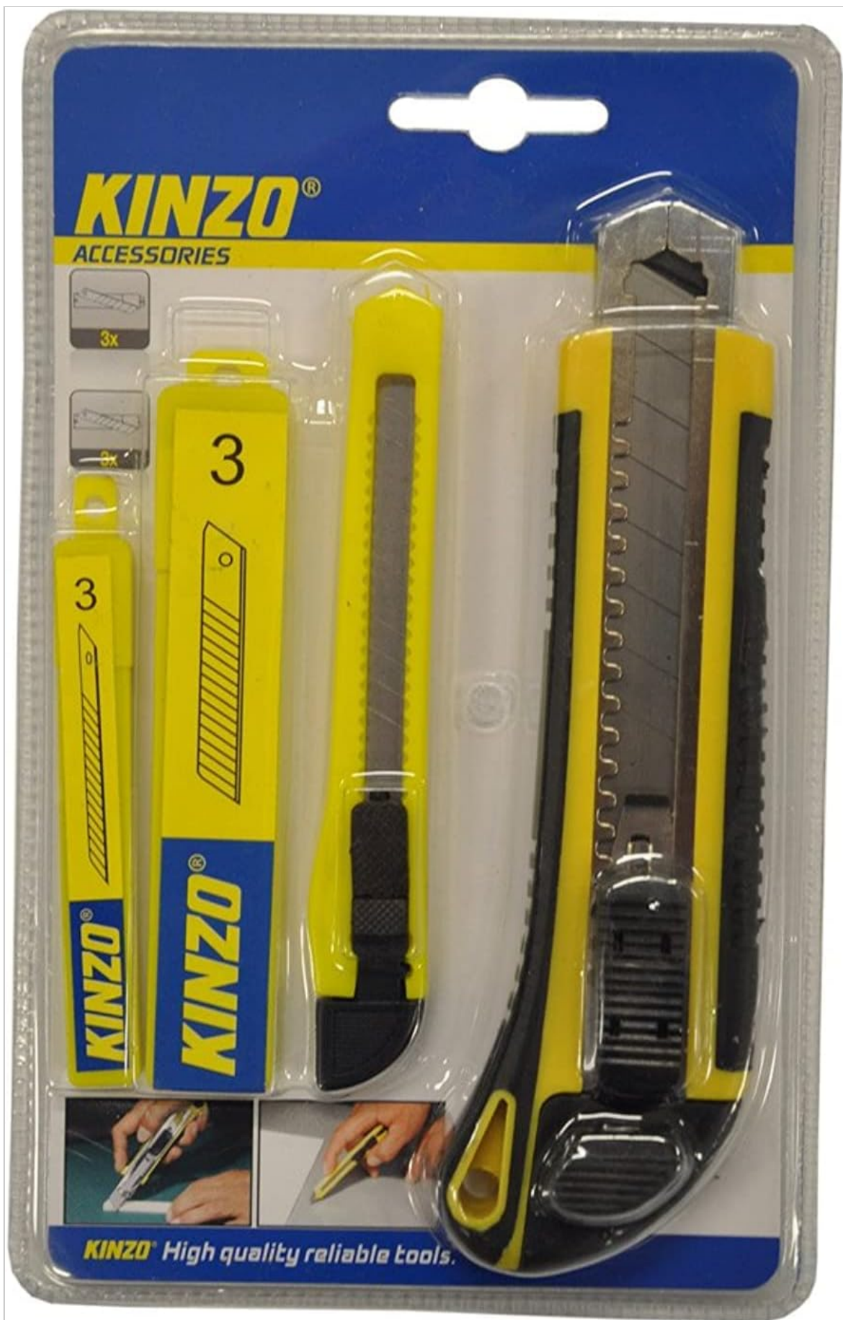
Figure 1: KINZO Hobby Knife Set as packaged, displaying both knives and their respective replacement blade cartridges.