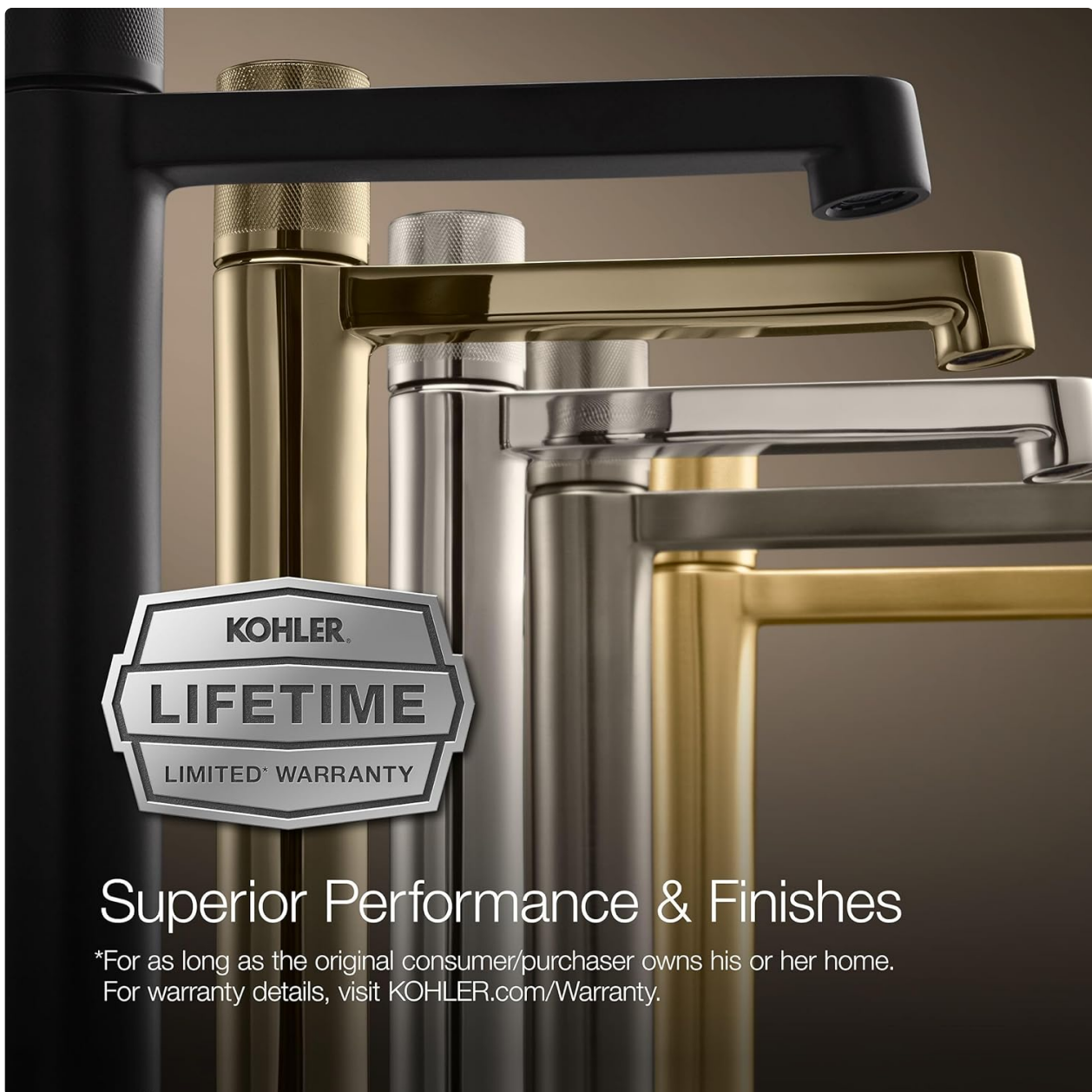
Image 8.1: The KOHLER Lifetime Limited Warranty badge, signifying commitment to quality and durability.