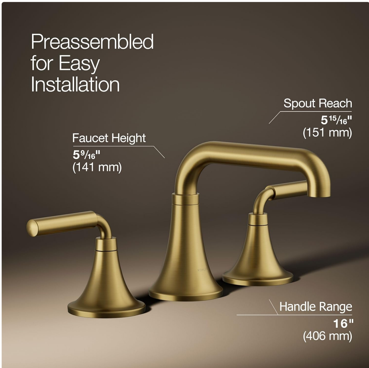
Image 3.2: Faucet dimensions including faucet height (5-9/16" / 141 mm), spout reach (5-15/16" / 151 mm), and handle range (16" / 406 mm).