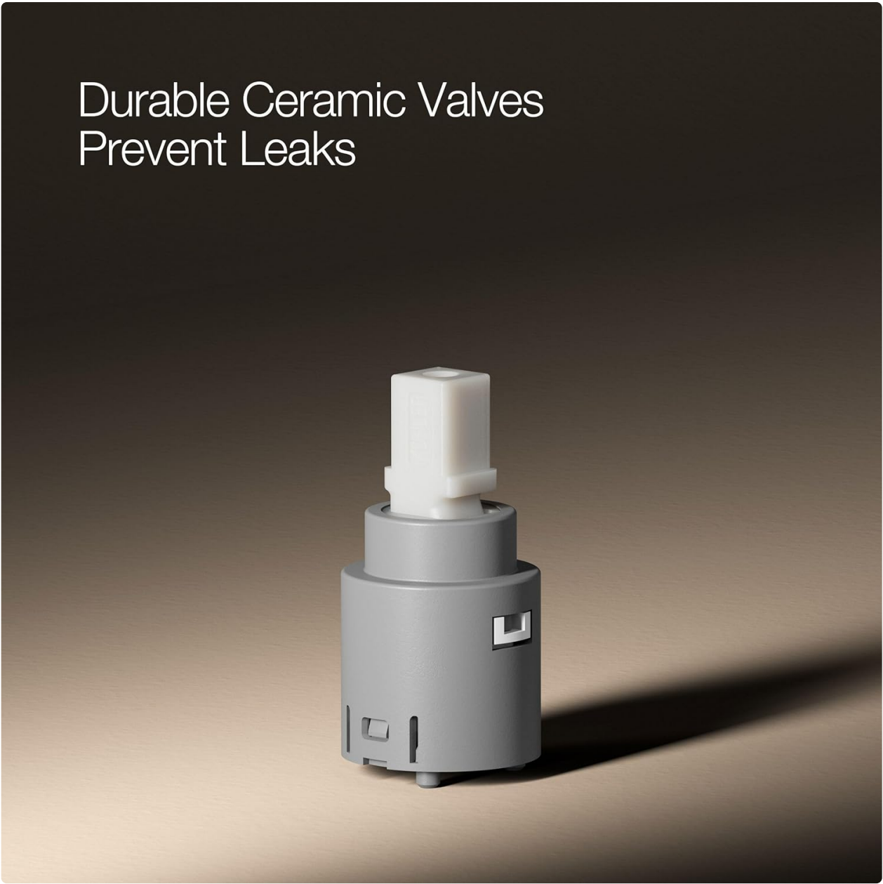
Image 5.2: A close-up of the durable ceramic valve, designed to prevent leaks and ensure long-term performance.