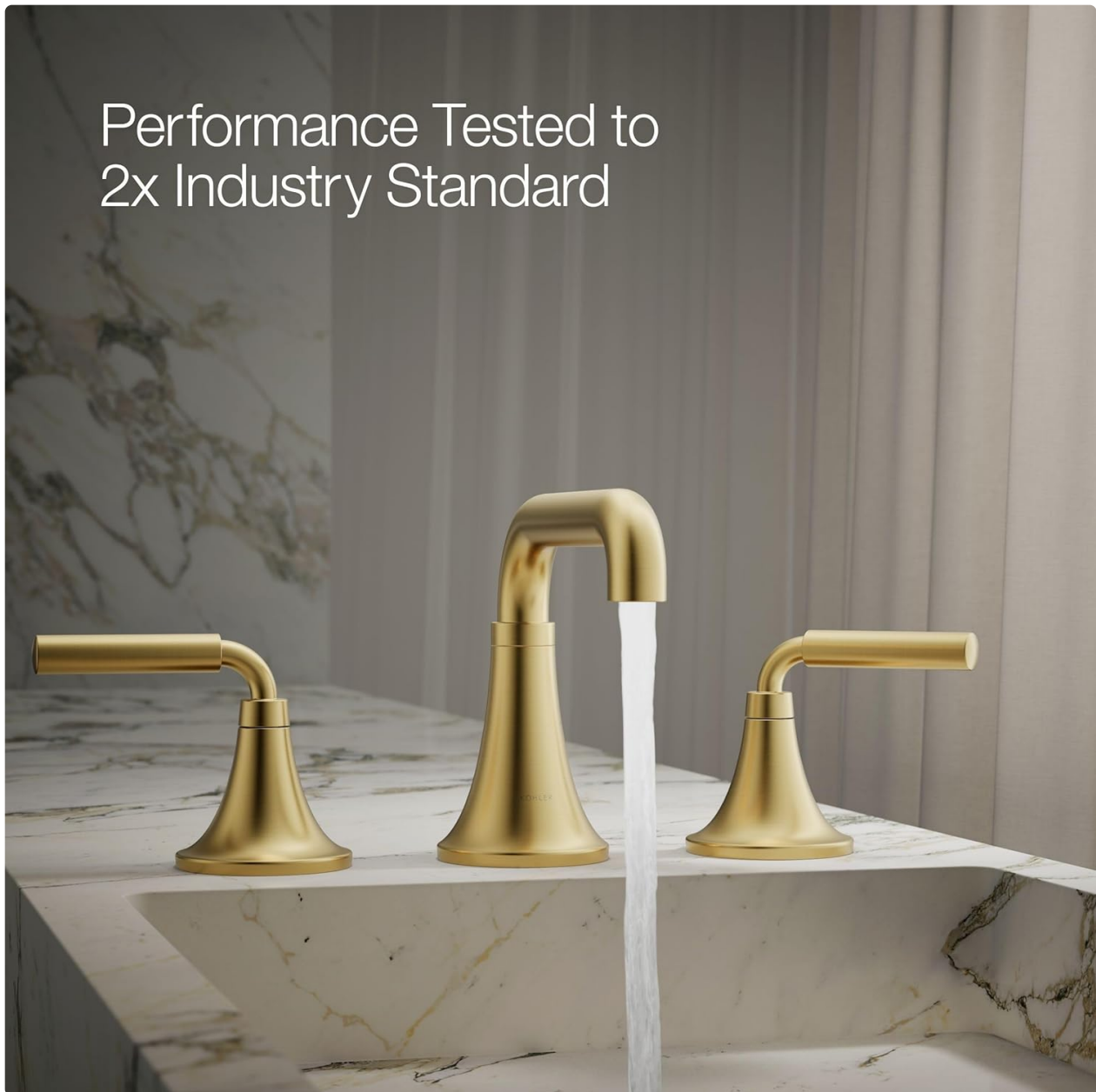
Image 4.1: The KOHLER Tone faucet demonstrating water flow, tested to exceed industry standards.

conservation without compromising performance.