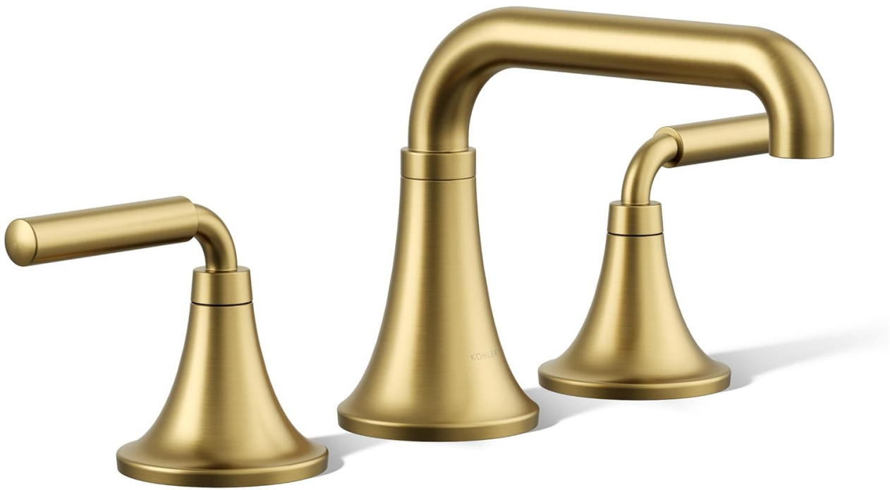
Image 1.1: The KOHLER Tone Widespread Bathroom Sink Faucet in Vibrant Brushed Moderne Brass.