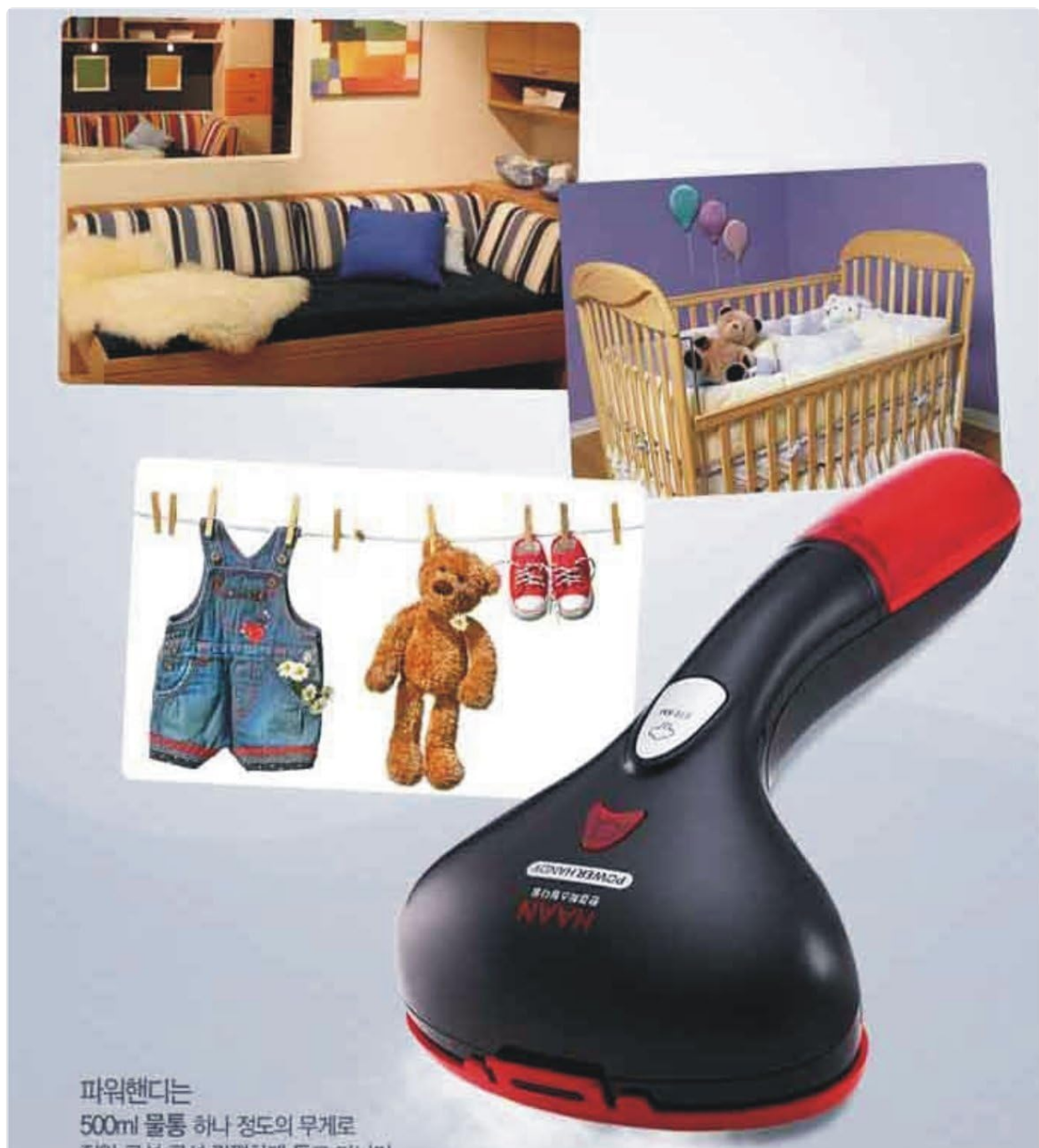
Image 1.1: The HAAN Portable Travel Steamer Iron HI-400BL, a compact and efficient handheld garment steamer.