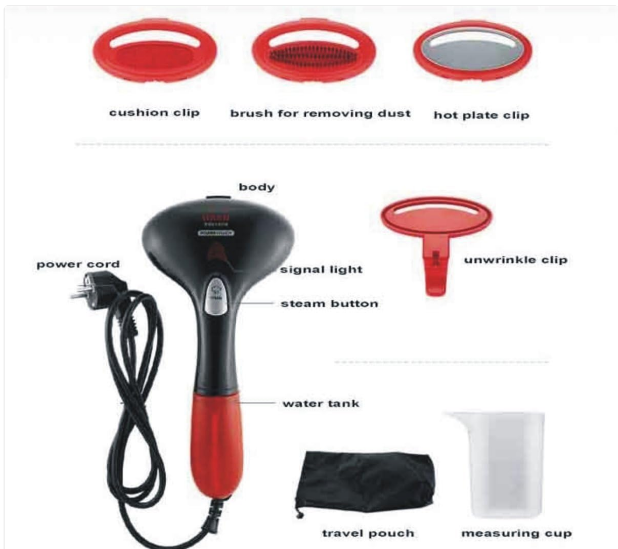
Image 3.1: Overview of the HAAN Steamer's main body and included accessories, such as the cushion clip, brush for