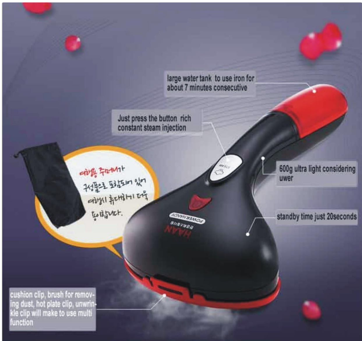
Image 3.2: Detailed view of the HAAN Steamer highlighting key features such as the large water tank (approx. 7 minutes continuous use), steam button for constant injection, 600g ultra-light design, and quick 20-second standby time. Also shows the included multi-function clips and travel pouch.

removing dust, hot plate clip, unwrinkle clip, measuring cup, and travel pouch.