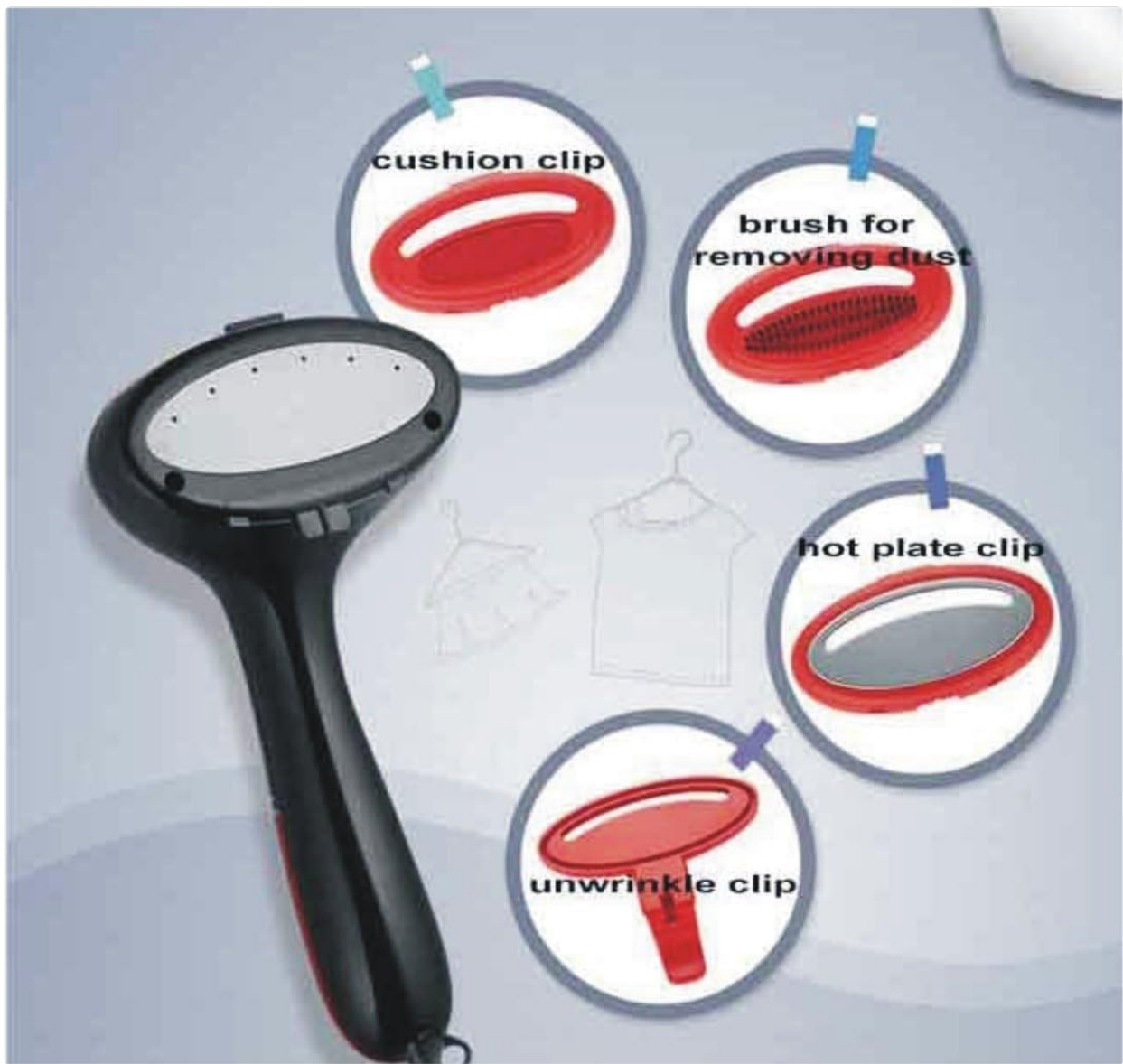
Image 5.2: The HAAN Steamer's compact size and lightweight design make it easy to carry and store, fitting conveniently into a travel bag or briefcase, highlighting its suitability for travel.