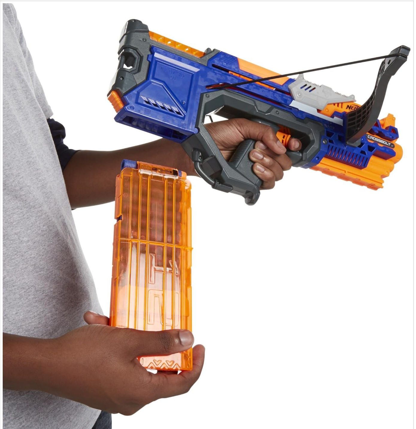
Image 4.1: Demonstrates the process of inserting the loaded dart clip into the blaster's magazine well.