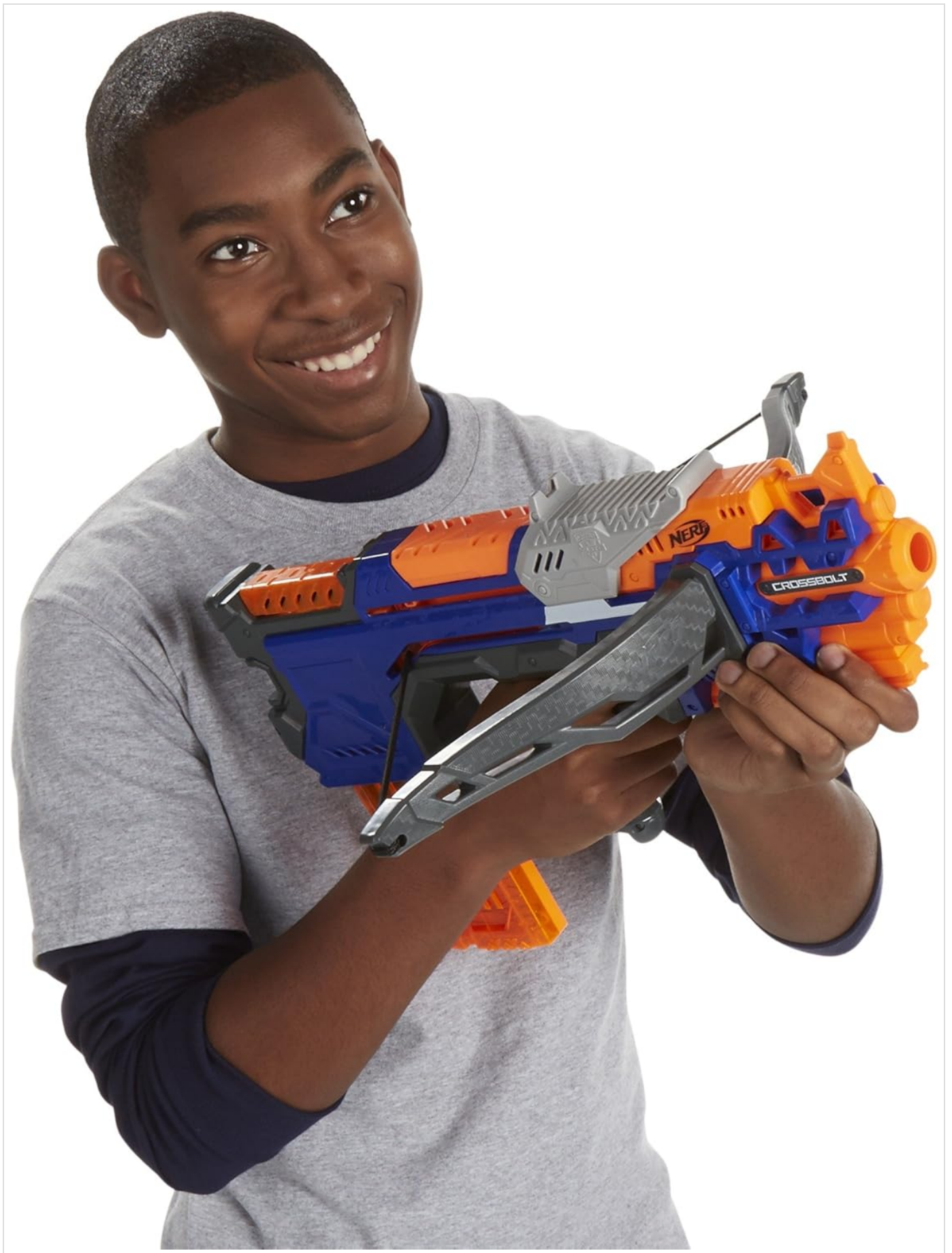
Image 5.2: A user demonstrating the proper grip and firing posture with the Nerf Cross Bolt Blaster.