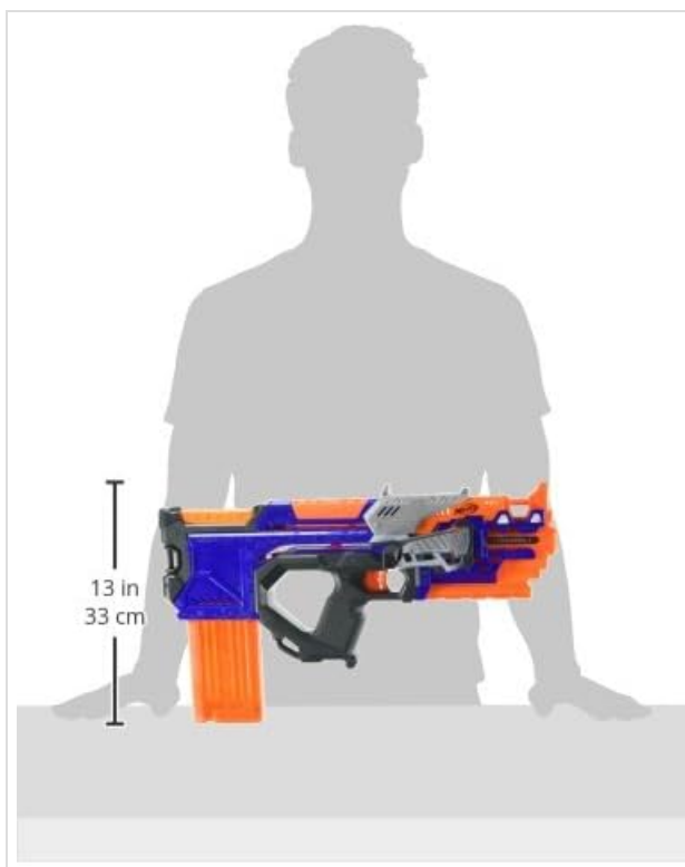
Image 8.1: A diagram illustrating the approximate dimensions of the Nerf Cross Bolt Blaster.