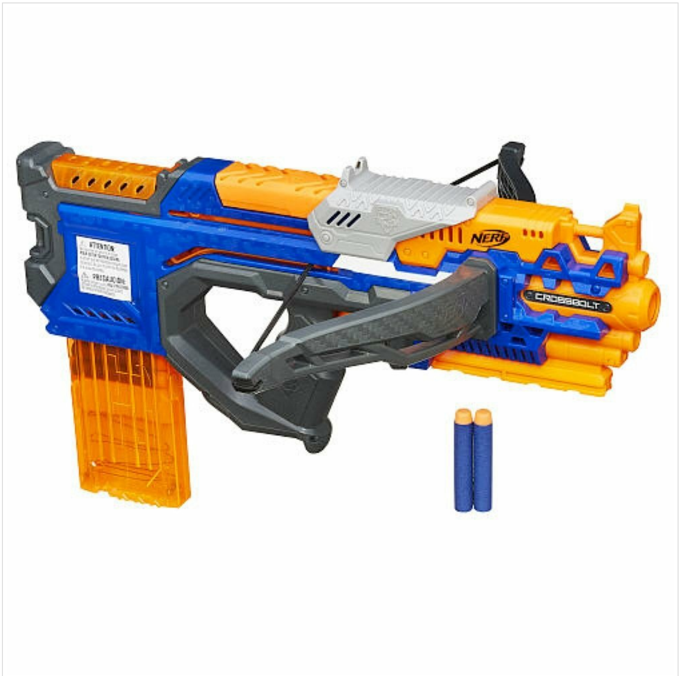
Image 1.1: The Nerf Cross Bolt Blaster in its retail packaging, highlighting its features and design.