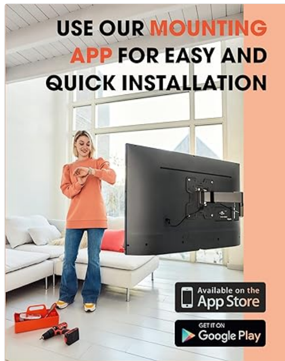
Image: Diagram illustrating the quick installation process for the tablet wall mount.