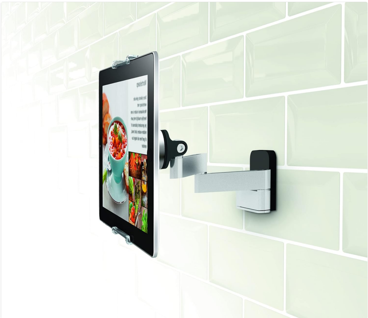
Image: Side view of the Vogel's TMS 1030 tablet wall mount installed on a tiled kitchen wall, holding a tablet.