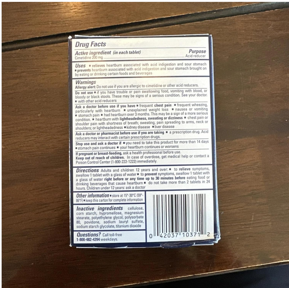
Image 2: Drug Facts panel from the Tagamet HB 200mg Cimetidine Tablets packaging.