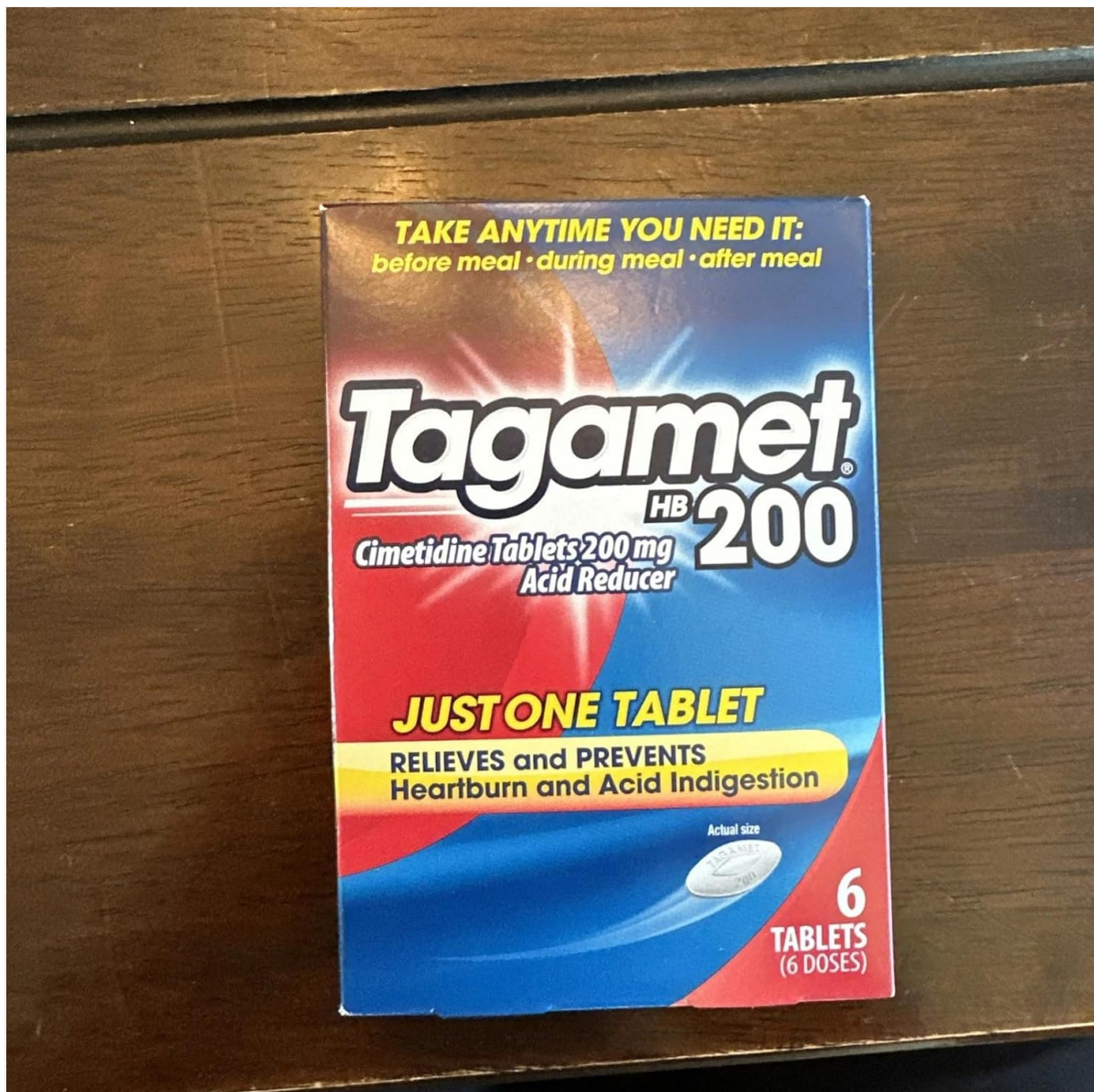
Image 1: Front of the Tagamet HB 200mg Cimetidine Tablets packaging.