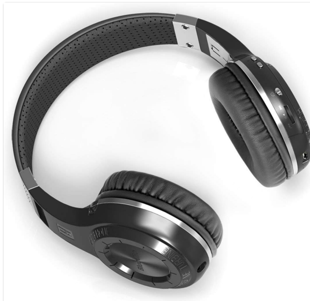
Image: A detailed view of the right earcup of the Bluedio HT Turbine headphones, highlighting the control buttons for power, volume, track control, and the charging port.