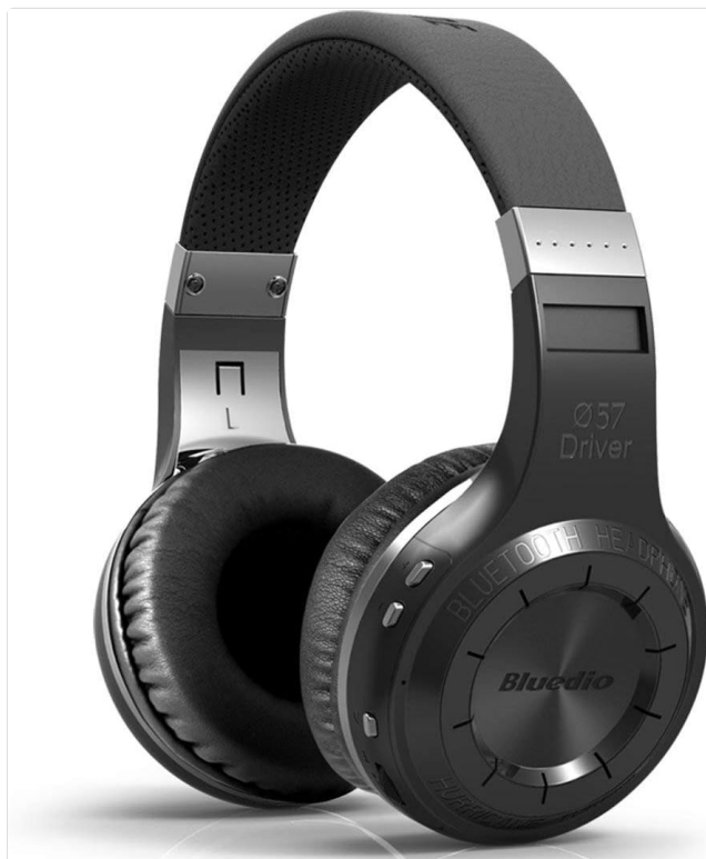
Image: The Bluedio HT Turbine Wireless Bluetooth 4.1 Stereo Headphones, featuring a sleek black design with silver accents on the headband and earcups.