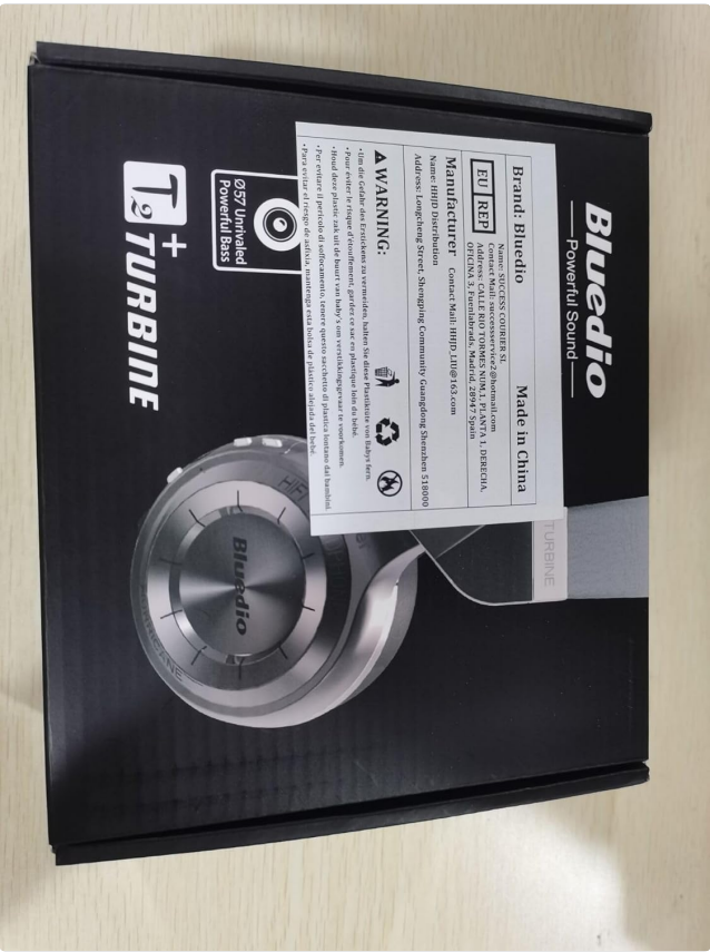
Image: The back of the Bluedio HT Turbine product box, displaying manufacturer details, contact email, and other product information.