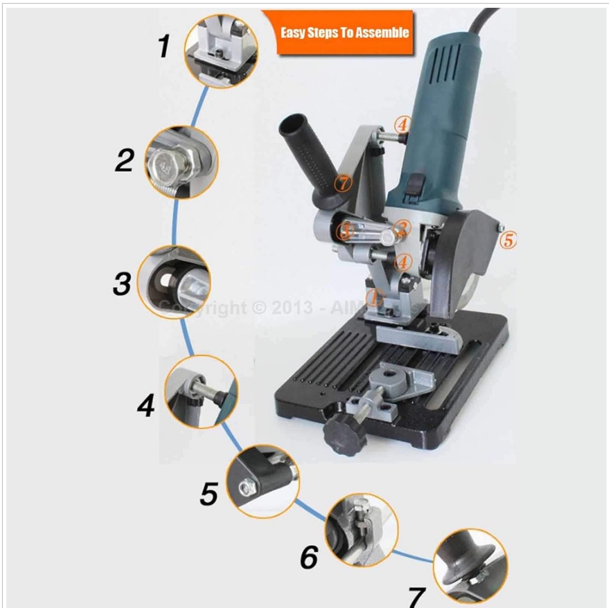
Image: Step-by-step assembly diagram for the KATSU Tools Angle Grinder Clamp Stand.

Follow these steps to assemble your angle grinder clamp stand. Refer to the assembly diagram for visual guidance.