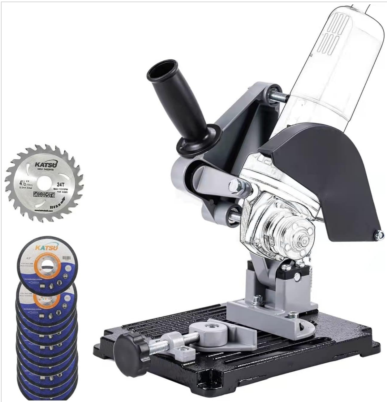
Image: The KATSU Tools Angle Grinder Clamp Stand, shown with included cutting discs for wood and steel.