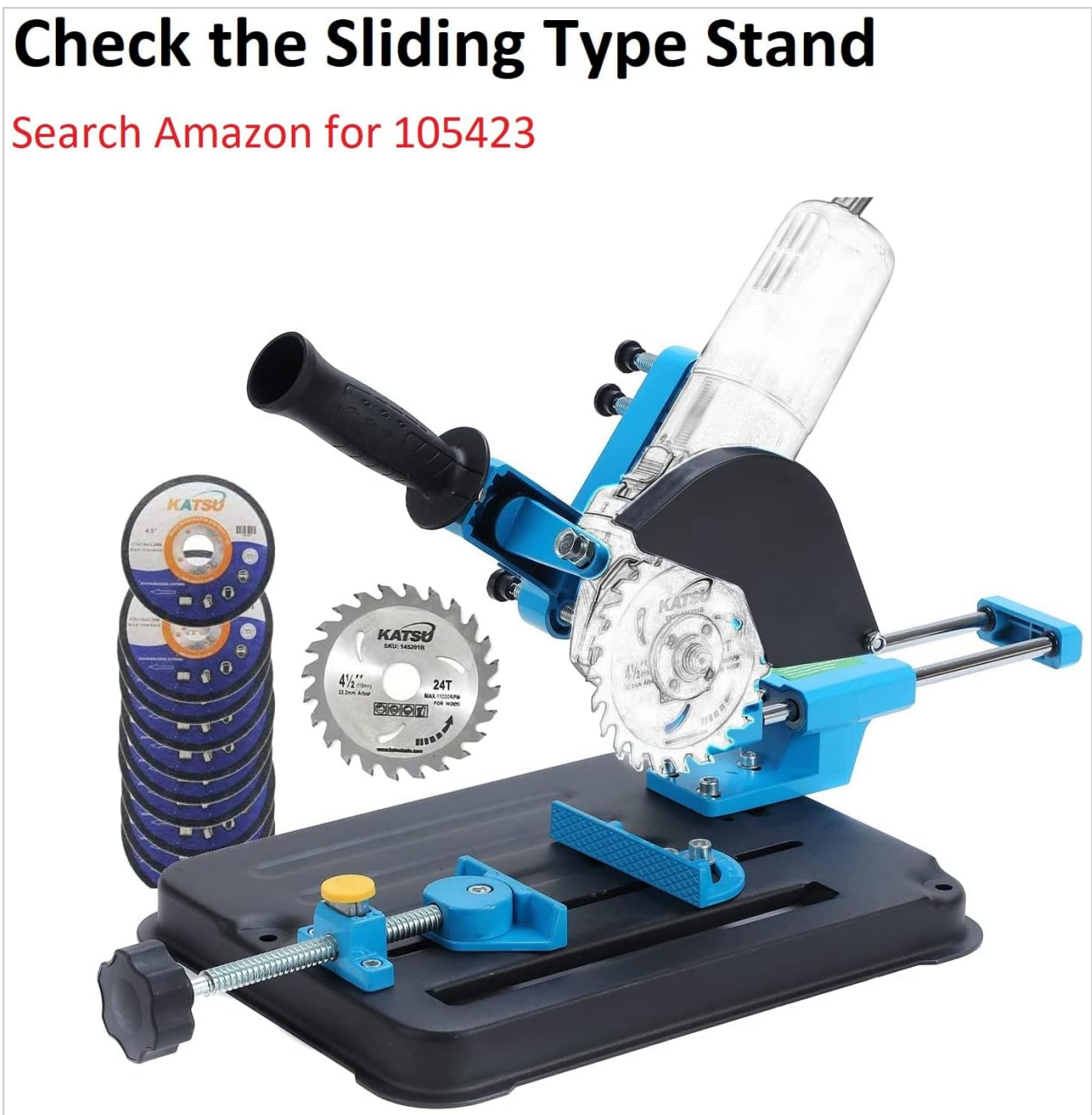
Image: An angle grinder securely mounted on the stand, demonstrating a typical operational setup.