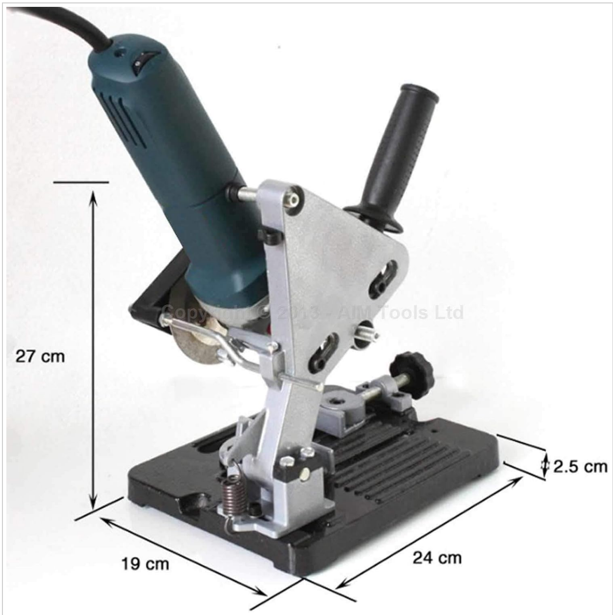
Image: Diagram illustrating the key dimensions of the KATSU Tools Angle Grinder Clamp Stand.