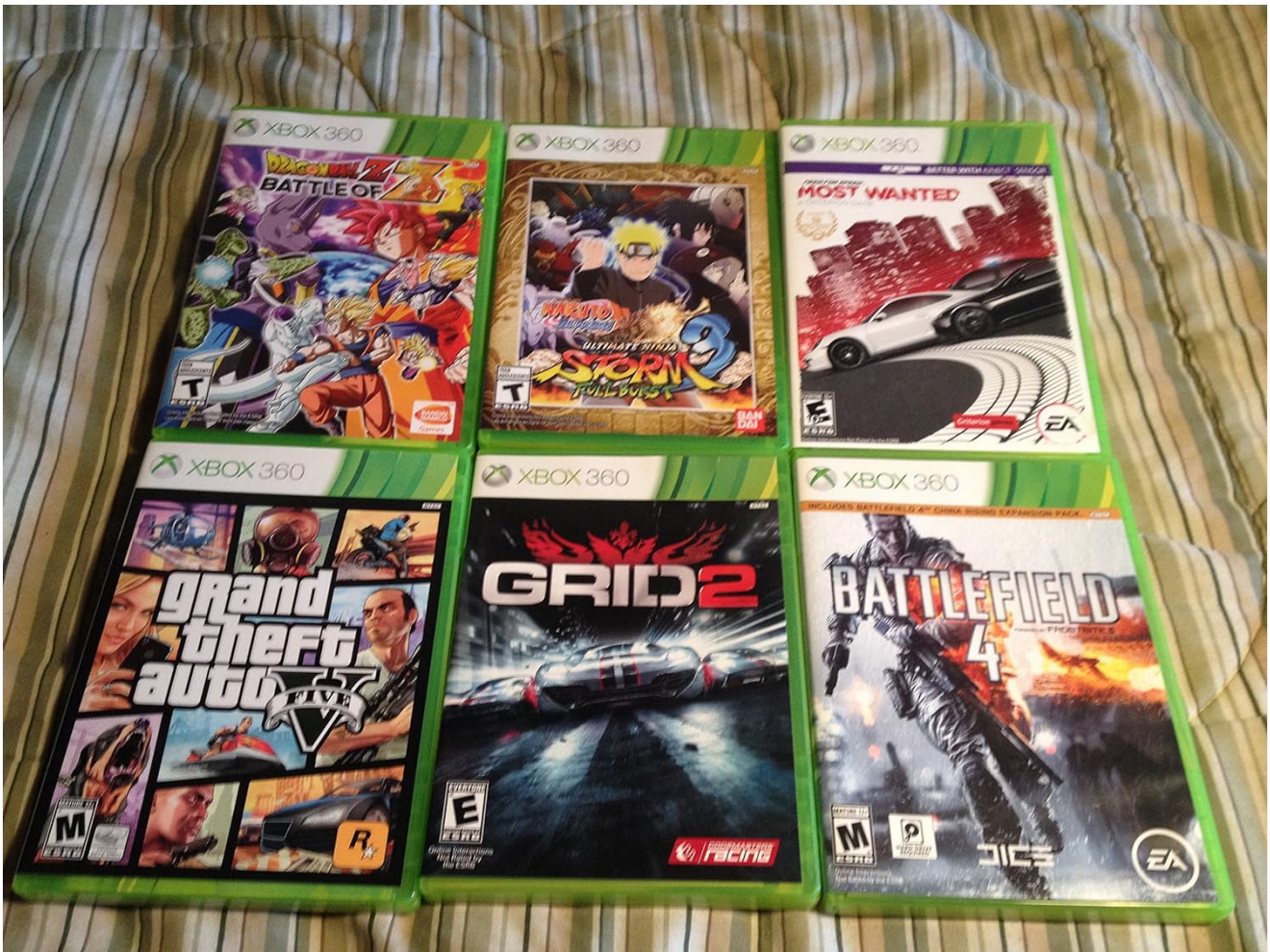
Figure 3.1: A selection of Xbox 360 game titles, demonstrating the variety of entertainment available for the console.