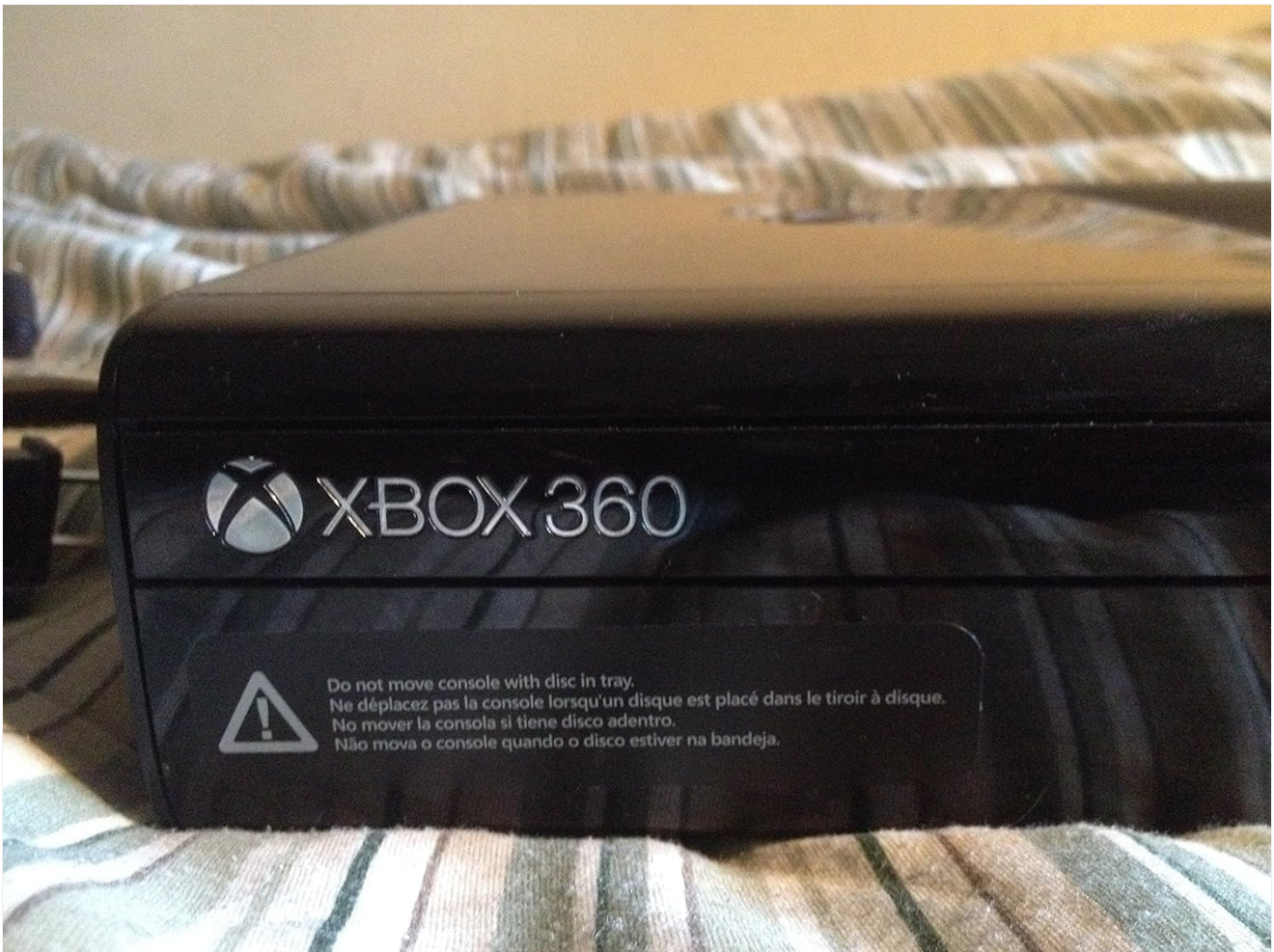
Figure 4.1: Front view of the Xbox 360 E Console, showing a warning label that advises against moving the console when a disc is in the tray.

To prevent damage to game discs and the console's disc drive, observe the following warning: