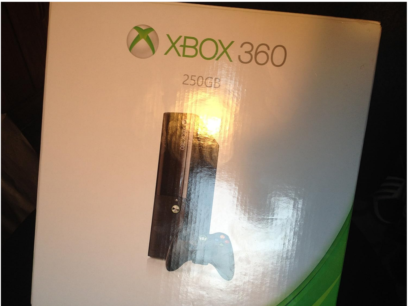
Figure 1.1: Front view of the Xbox 360 E Console retail packaging, highlighting the console and 250GB storage capacity.