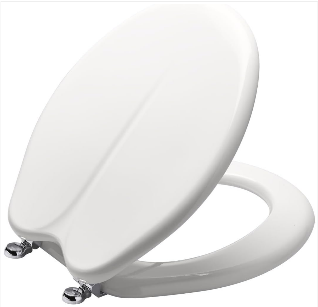
Image 1: The Kohler 85332-CP-0 white toilet seat replacement part. This closed-front seat is designed for durability and a precise fit.

The 85332-CP-0 is a closed-front toilet seat in white, featuring chrome hinges. It is crafted from plastic material to ensure durability and ease of cleaning.