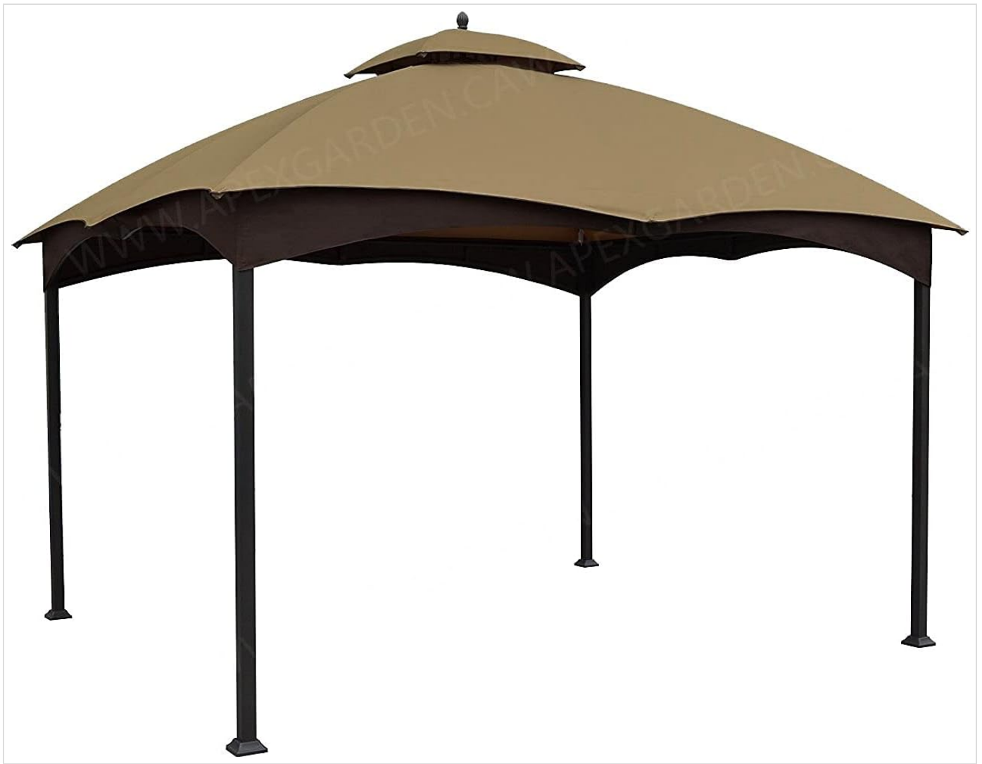
Image: An interior view of the canopy, illustrating how it attaches to the gazebo frame structure.