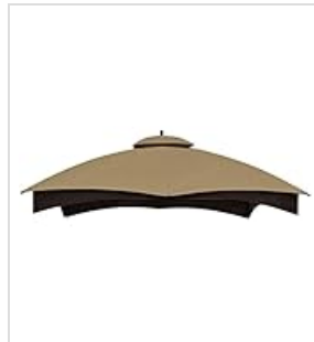
Image: The replacement canopy top, often purchased with compatible accessories like mosquito netting and privacy curtains.