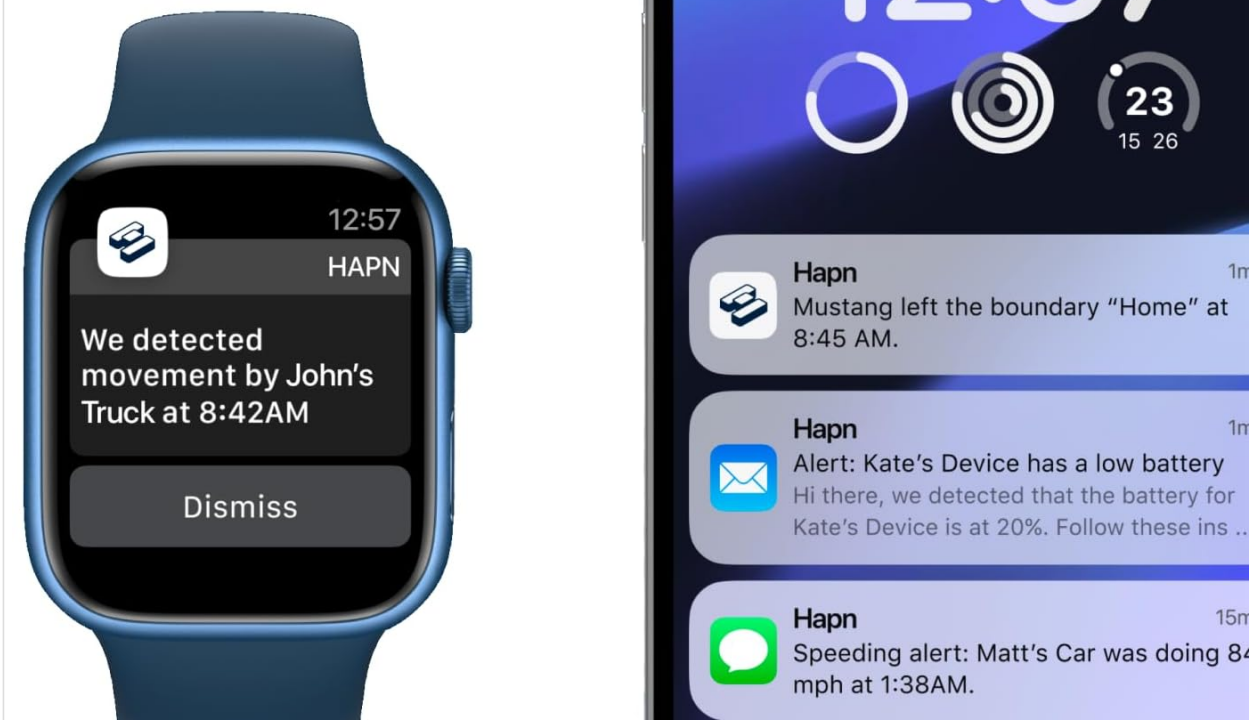
Image: Notifications for boundary and speed alerts displayed on a smartphone and smartwatch.

Get push notifications, SMS, and emails delivered fast to your computer, phone, or wearable devices - so you are always in the know.