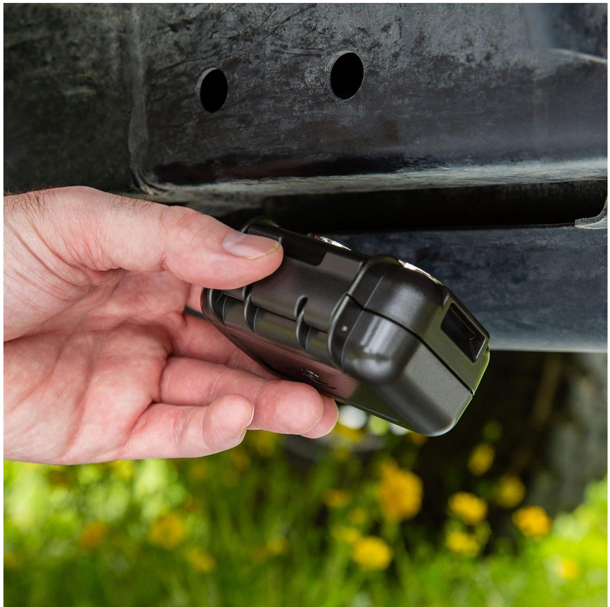
Image: Attaching the Spy Tec Mini GPS Tracker using its magnetic case to a vehicle's underside.

The GT-GL300HM1 comes with a weatherproof magnetic case. For optimal tracking performance, place the device in a location with a clear view of the sky, if possible. The strong magnets allow for secure attachment to metallic surfaces on vehicles or other assets.