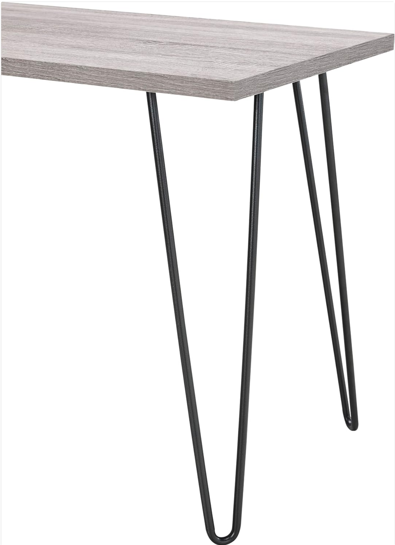
Figure 2: A close-up view of the metal hairpin-style legs, showcasing their sleek design and how they attach to the desktop.

For a visual guide on assembly, please refer to the official product video below.