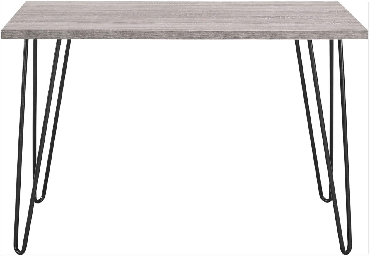
Figure 1: The Ameriwood Home Owen Retro Computer Desk in Distressed Gray Oak. This image shows the full desk from a front-facing angle, highlighting its simple design and hairpin legs.