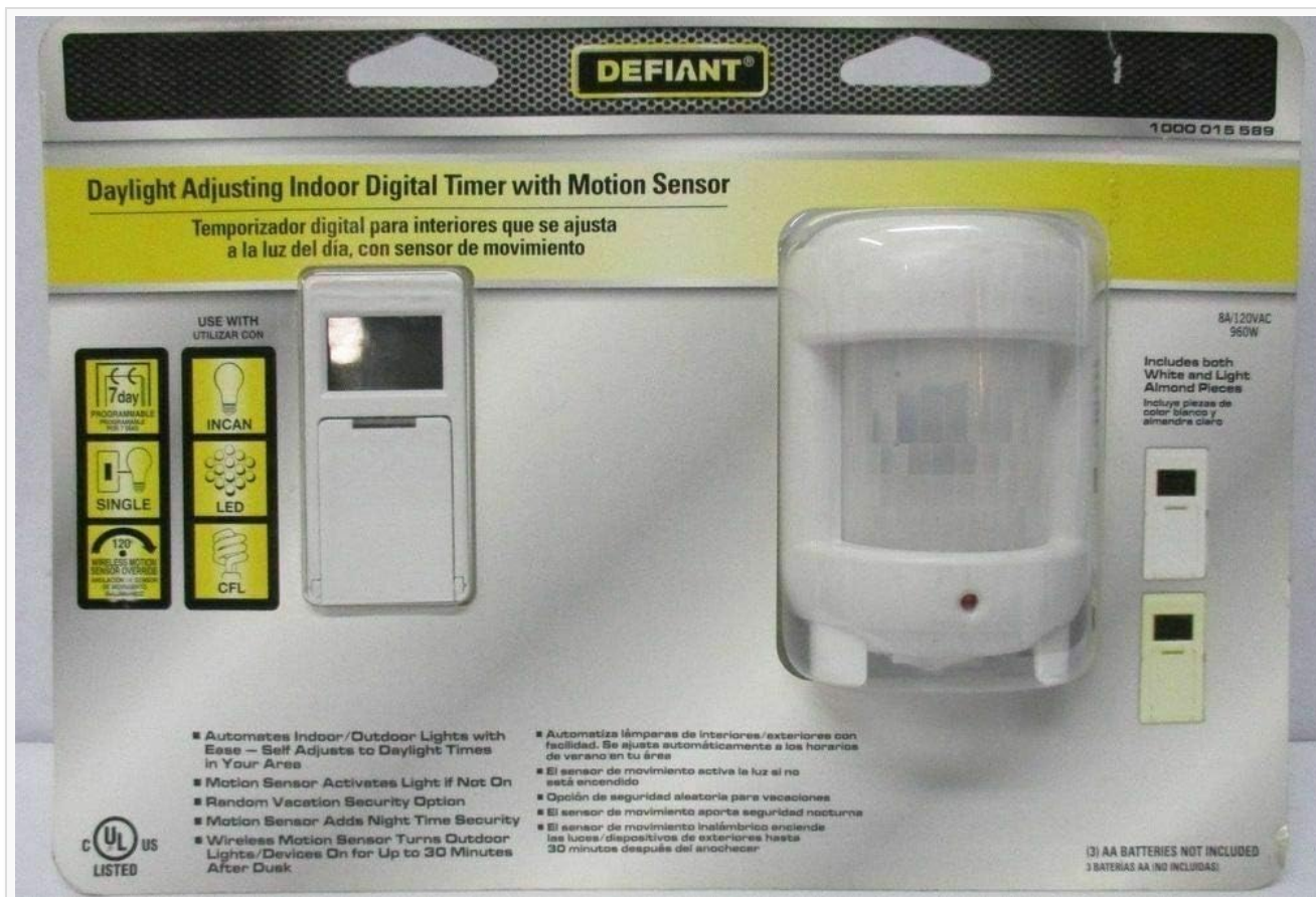
Image: Front view of the Defiant SunSmart In-Wall Digital Timer packaging, displaying the timer unit, a separate motion sensor, and key features.