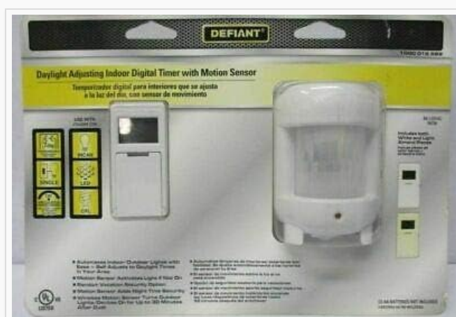
Image: Detailed view of the Defiant SunSmart In-Wall Digital Timer unit, showing its digital display and control buttons.

This section provides step-by-step instructions for installing your Defiant SunSmart Digital Timer. It is recommended to have basic electrical knowledge or consult a professional.