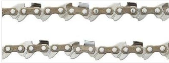
Image 1: Close-up of Powercare Y56 chainsaw chain links, highlighting the cutter teeth and drive links for inspection.

or shipping damage. Ensure all cutter teeth are sharp and intact, and that drive links and rivets are secure.