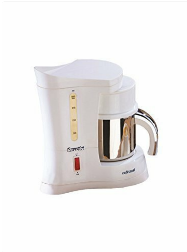
Figure 2: Side view of the Preethi CM 212 Cafe Zest Coffee Maker, highlighting its compact design.