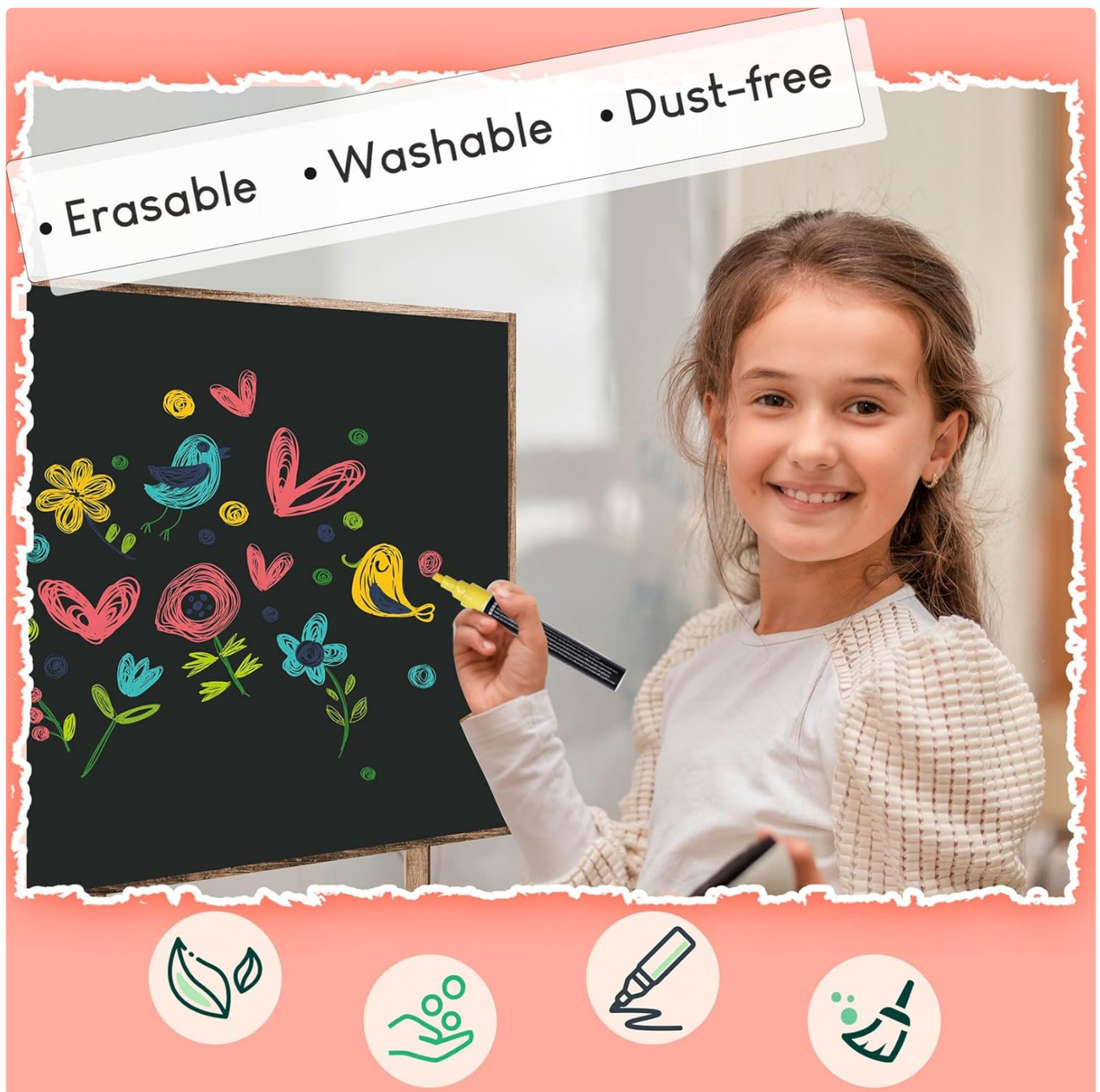
Figure 4.1: The chalk pens are erasable, washable, and dust-free for easy maintenance.