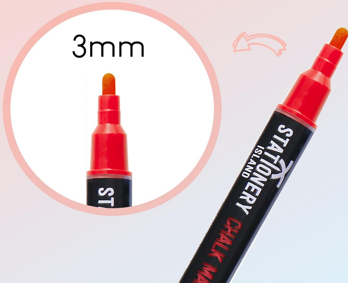
Figure 3.3: Detail of the 3mm fine bullet nib for precise application.