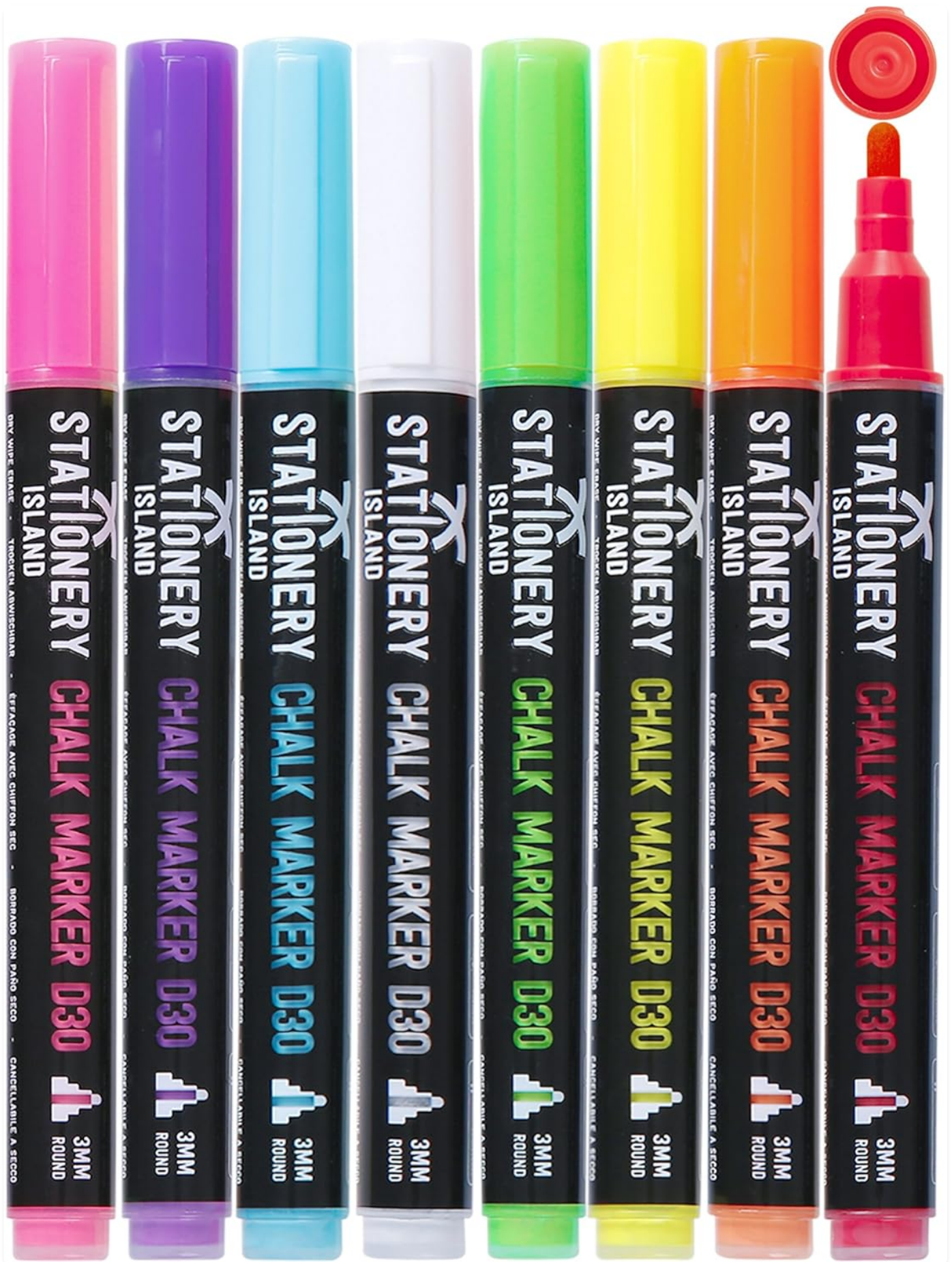
Figure 1.1: A set of 8 STATIONERY ISLAND Chalk Pens, showcasing the range of available colors.