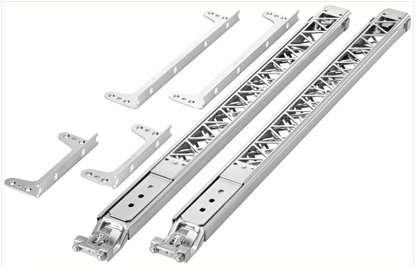
Image: All components of the HPE X450 4U/7U Universal 4-Post Rack Mount Kit, including two rack rails and four mounting brackets, laid out on a white background.