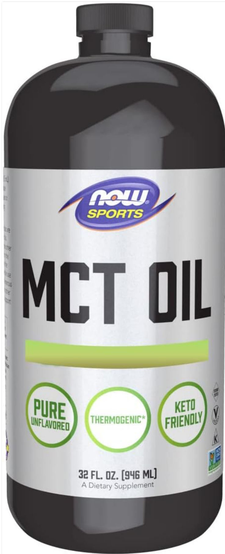
Image: Front view of the NOW Foods MCT Oil bottle, highlighting "PURE UNFLAVORED", "THERMOGENIC", and "KETO FRIENDLY" labels. The bottle contains 32 fl. oz. (946 mL) of dietary supplement.