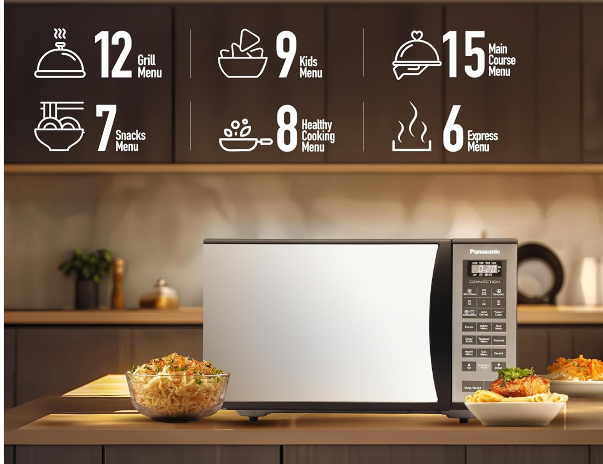
Image 5.4: Breakdown of the 61 Auto Cook Menus, including Grill, Kids, Main Course, Snacks, Healthy Cooking, and Express Menus.