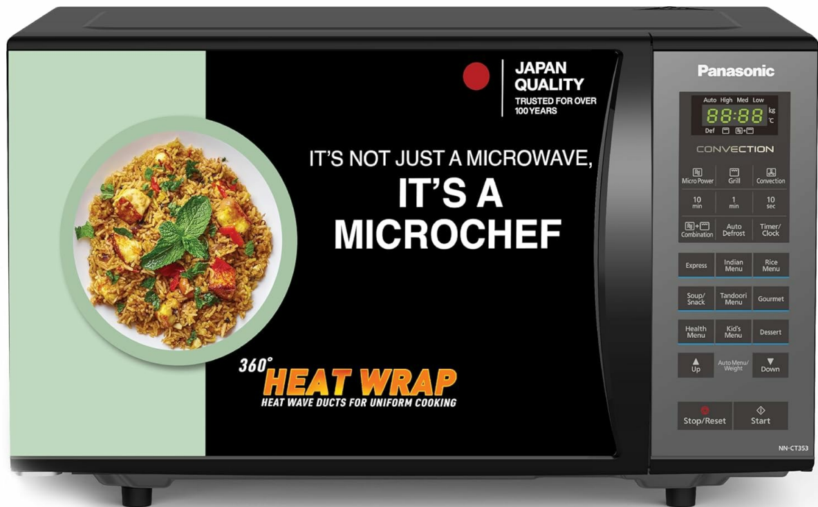
Image 1.1: Front view of the Panasonic NN-CT353BFDG Convection Microwave Oven.