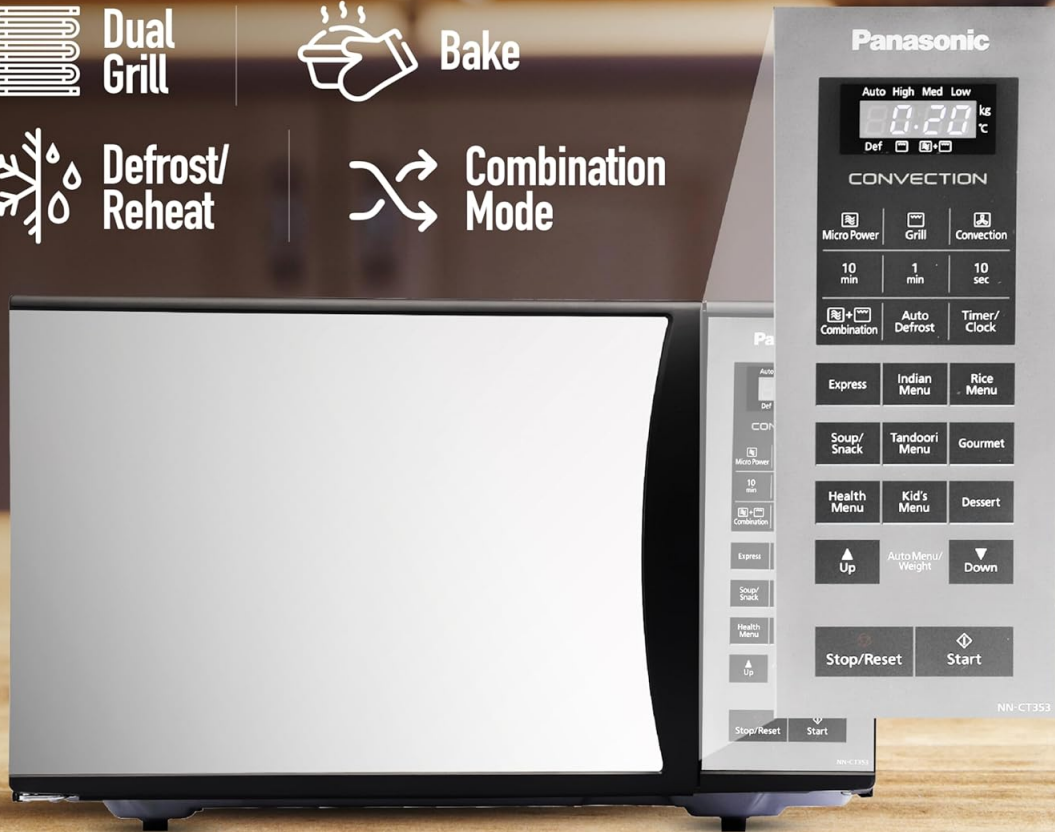
Image 5.3: Shows available cooking modes: Dual Grill, Bake, Defrost/Reheat, and Combination Mode.