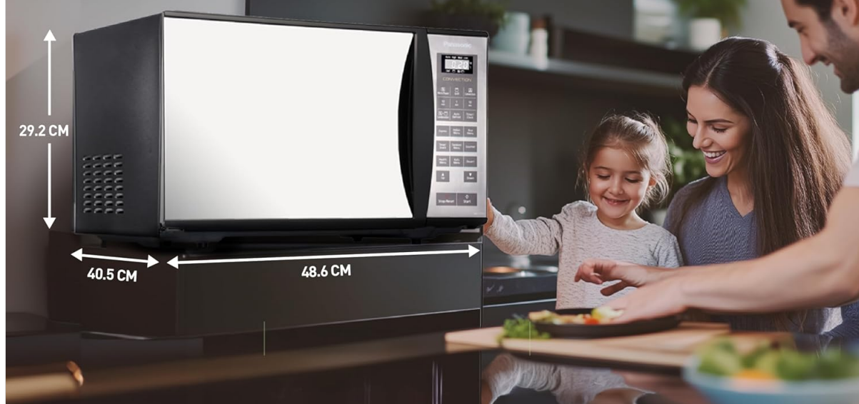
Image 4.1: Illustrates the oven's dimensions (48.6 cm width, 29.2 cm height, 40.5 cm depth) and 23L capacity, suitable for a 28.8 cm tray.