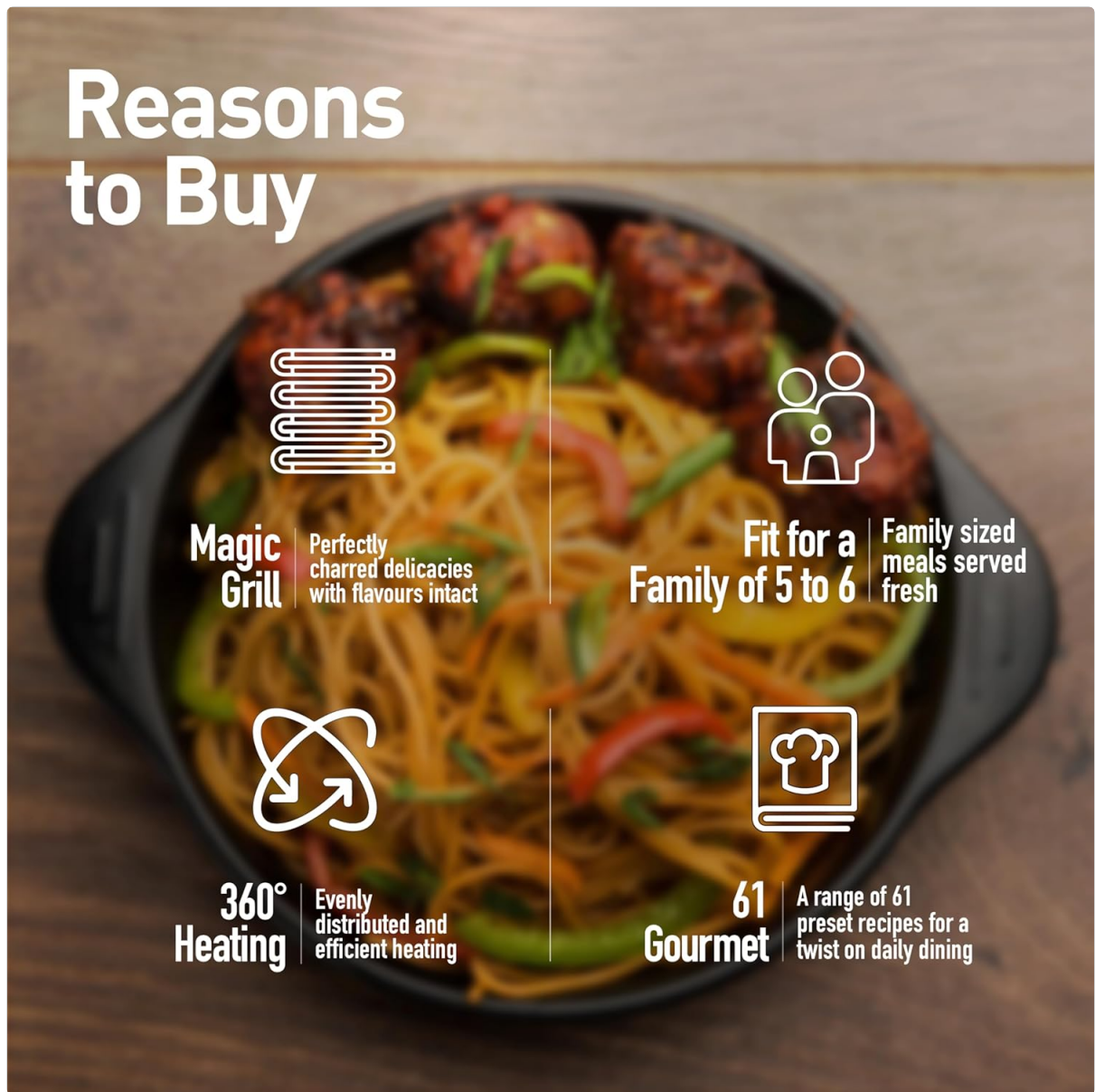
Image 3.1: Overview of key features including Magic Grill, 360° Heating, and 61 Auto Cook Menus.