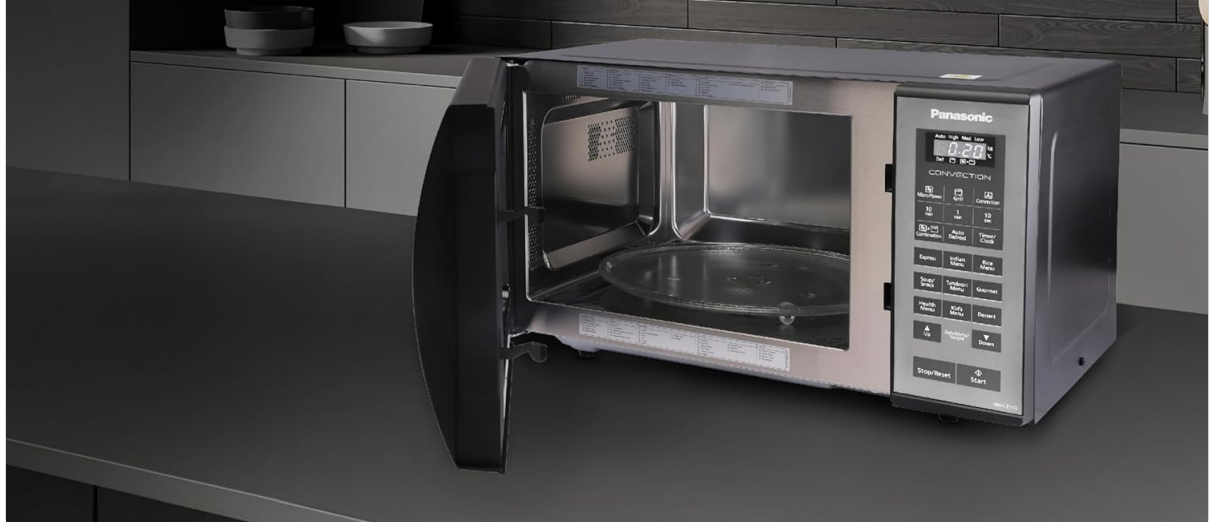
Image 3.2: Features for convenient cooking such as Child Lock, Auto Defrost, Vapor Clean, and Stainless Steel Cavity.