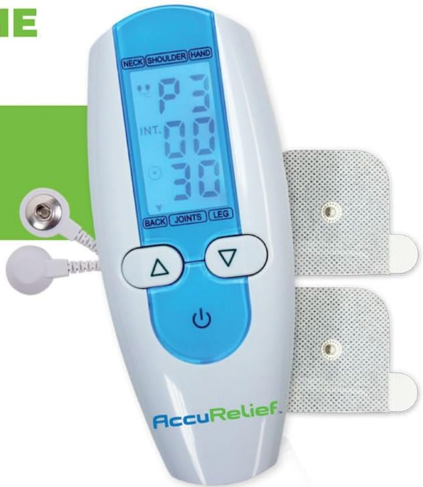
Image: The AccuRelief TENS Unit's display, highlighting the selection of therapeutic programs and intensity levels.