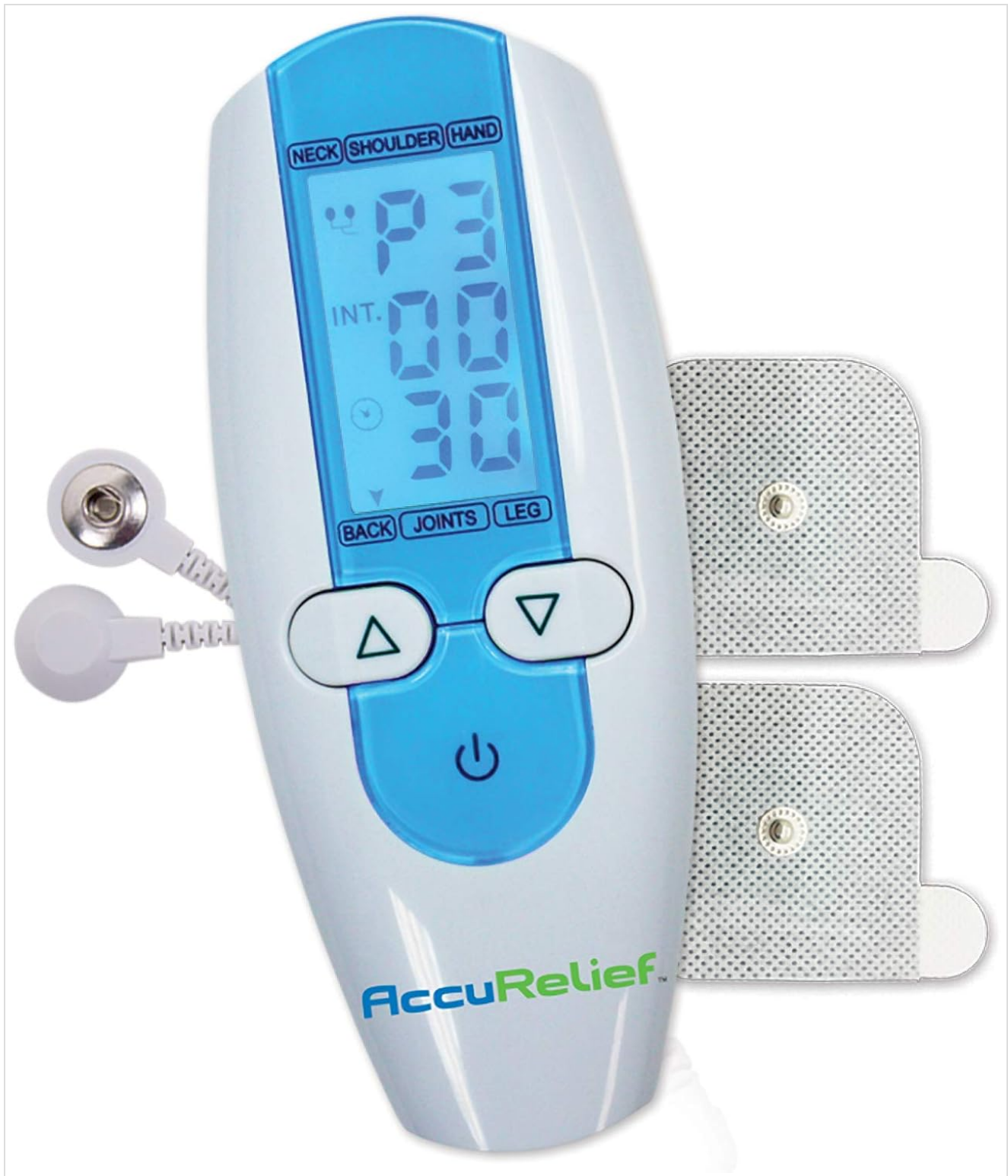
Image: The AccuRelief TENS Unit with its lead wires and two electrode pads attached, ready for use.