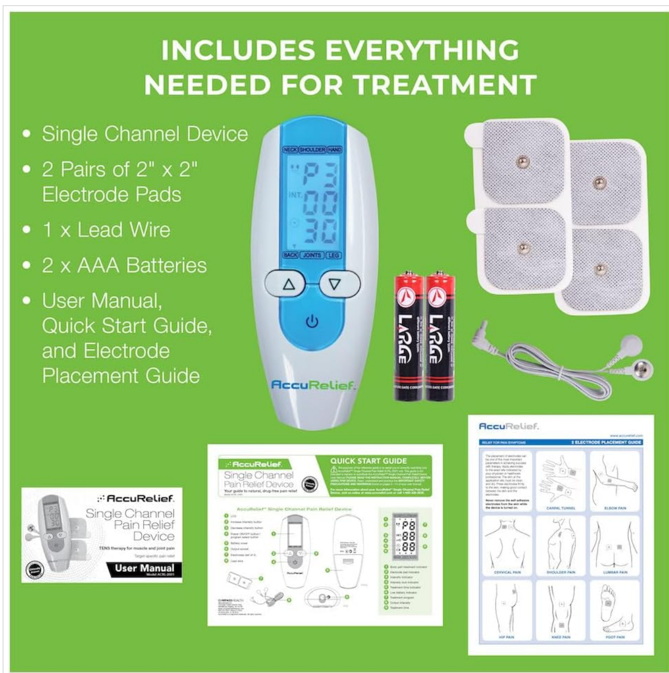
Image: Contents of the AccuRelief TENS Unit package, showing the device, electrode pads, lead wire, AAA batteries, and various guides.