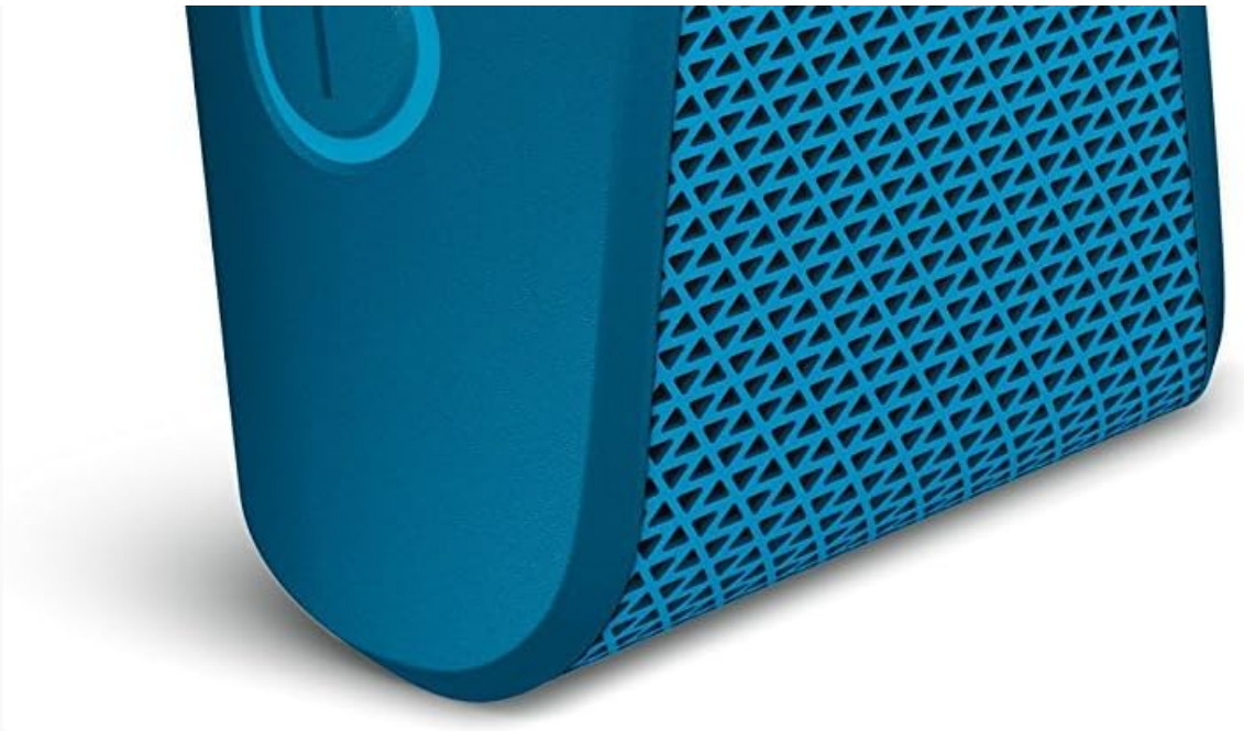
Figure 2: Side view of the speaker with Volume Up, Bluetooth, and Volume Down buttons.