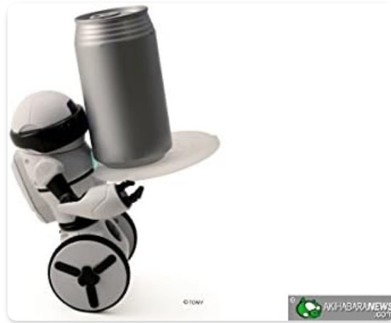
Figure 2: The MiP Robot demonstrating its ability to carry objects using the included balance tray accessory.