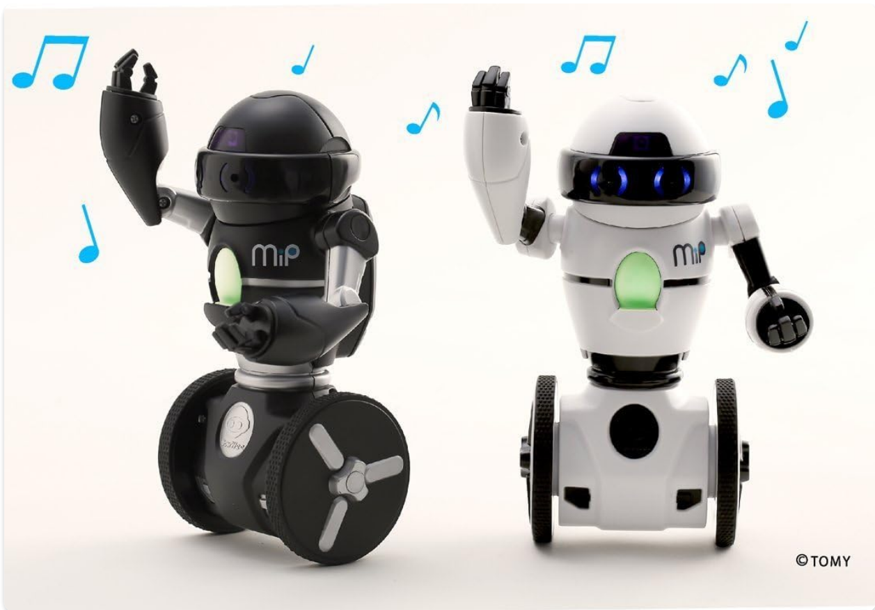
Figure 3: Two MiP Robots demonstrating their interactive and expressive capabilities, including dancing.