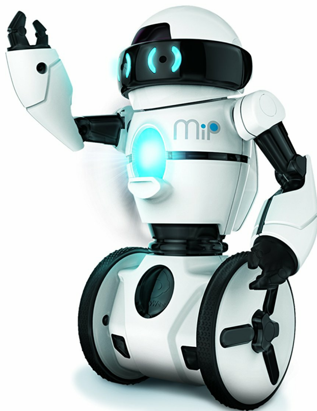
Figure 1: The WowWee MiP Robot in its upright, balancing stance.