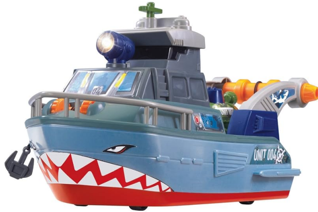
Image: The Dickie Toys Storm Unit boat and its submarine accessory displayed within its retail packaging.