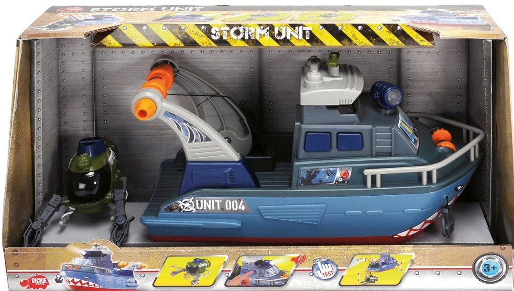
Image: An alternative view of the Dickie Toys Storm Unit boat and submarine inside its packaging.