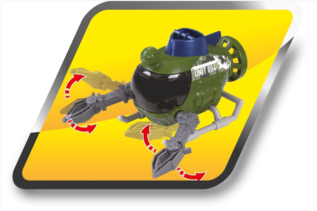
Image: The green submarine accessory, highlighting its movable claw mechanisms.

The submarine accessory may feature movable parts, such as claws, for enhanced play. Manipulate these parts manually during play.