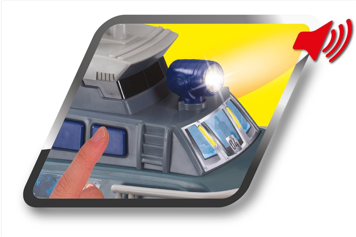
Image: A finger pressing a button on the boat's cabin, indicating activation of light and sound features.

The Storm Unit is equipped with working spotlights and various sound effects to enhance play. Press the designated button on the boat's deck to activate these features.