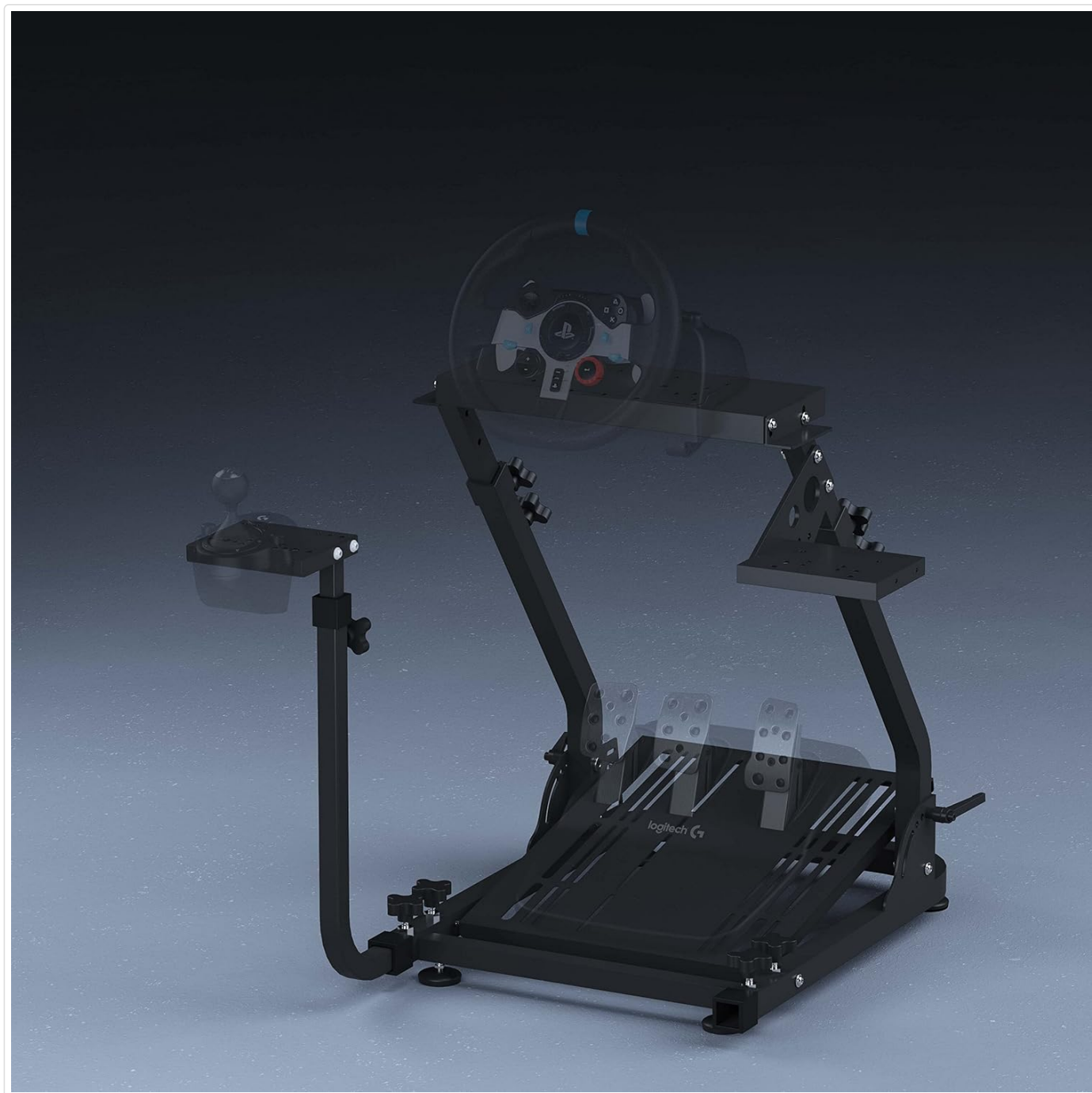
Figure 4: Shifter Mounted on Left