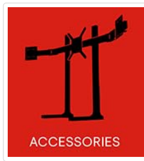
Figure 2: Compatible Racing Peripherals