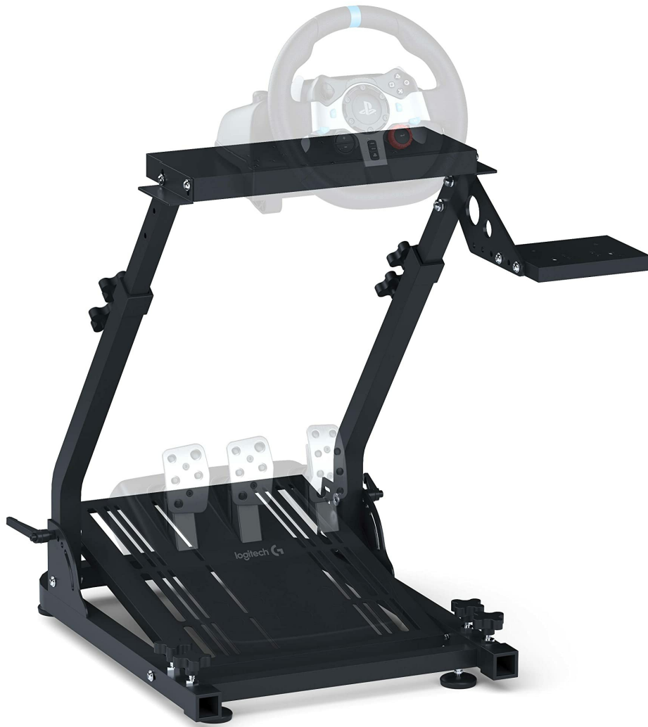
Figure 1: GT Omega Classic Wheel Stand