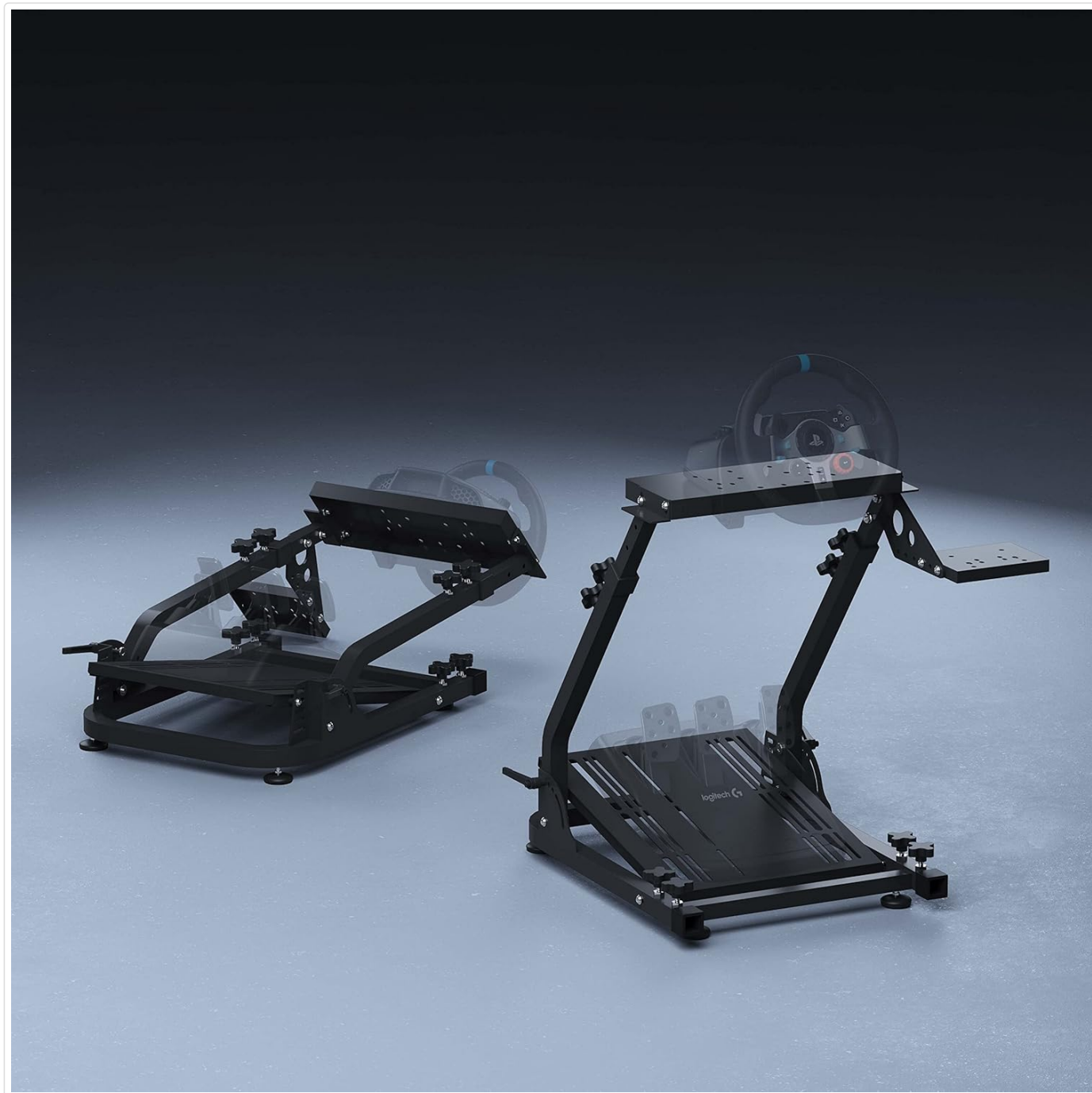
Figure 8: Folded Wheel Stand