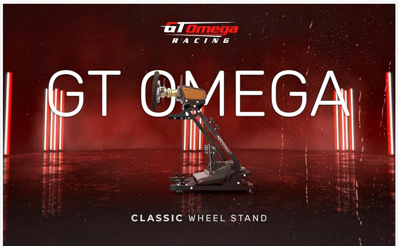
Figure 3: Key Features Overview