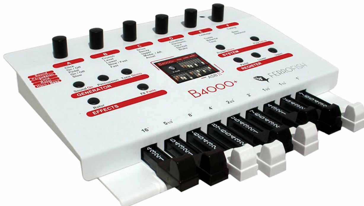
Figure 1: Front view of the Ferrofisch B4000+ Organ Module, showing drawbars, display, and controls.