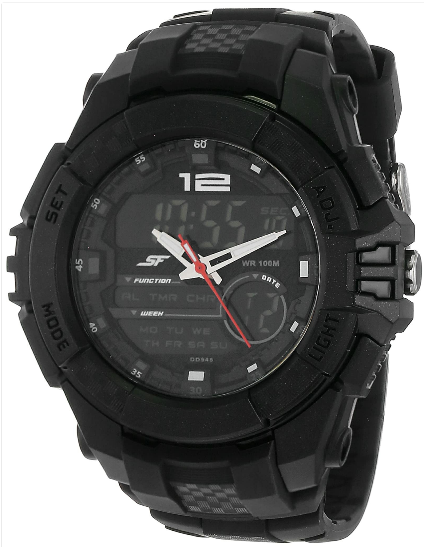
Figure 1: Front view of the SF Ocean III Chronograph Sport Watch.