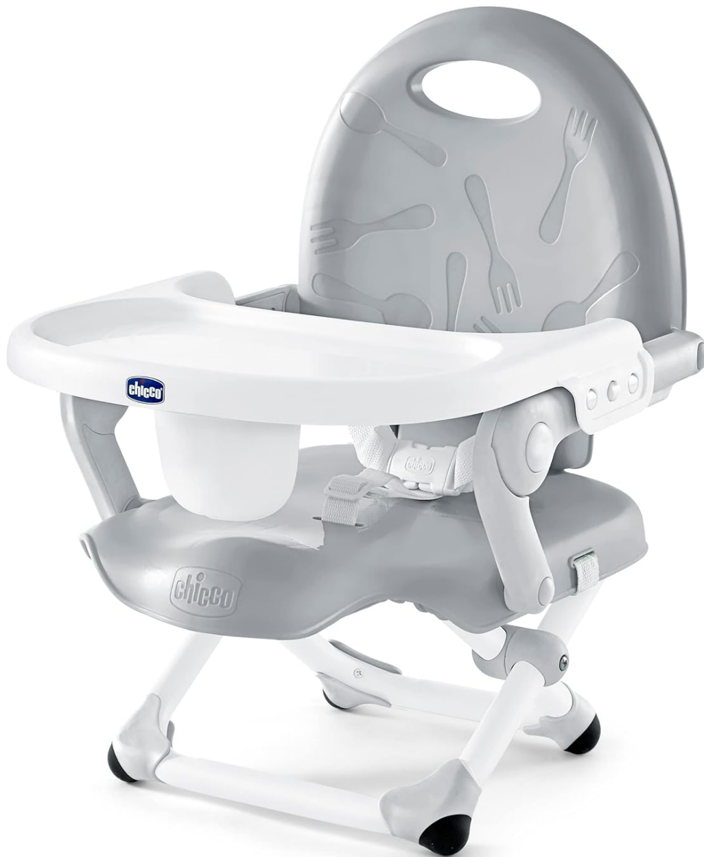
Figure 1: The Chicco Pocket Snack Portable Booster Seat, showcasing its compact design and integrated tray.