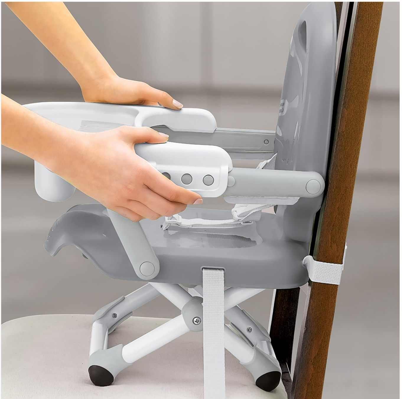
Figure 4: The booster seat securely attached to a dining chair, ready for use.