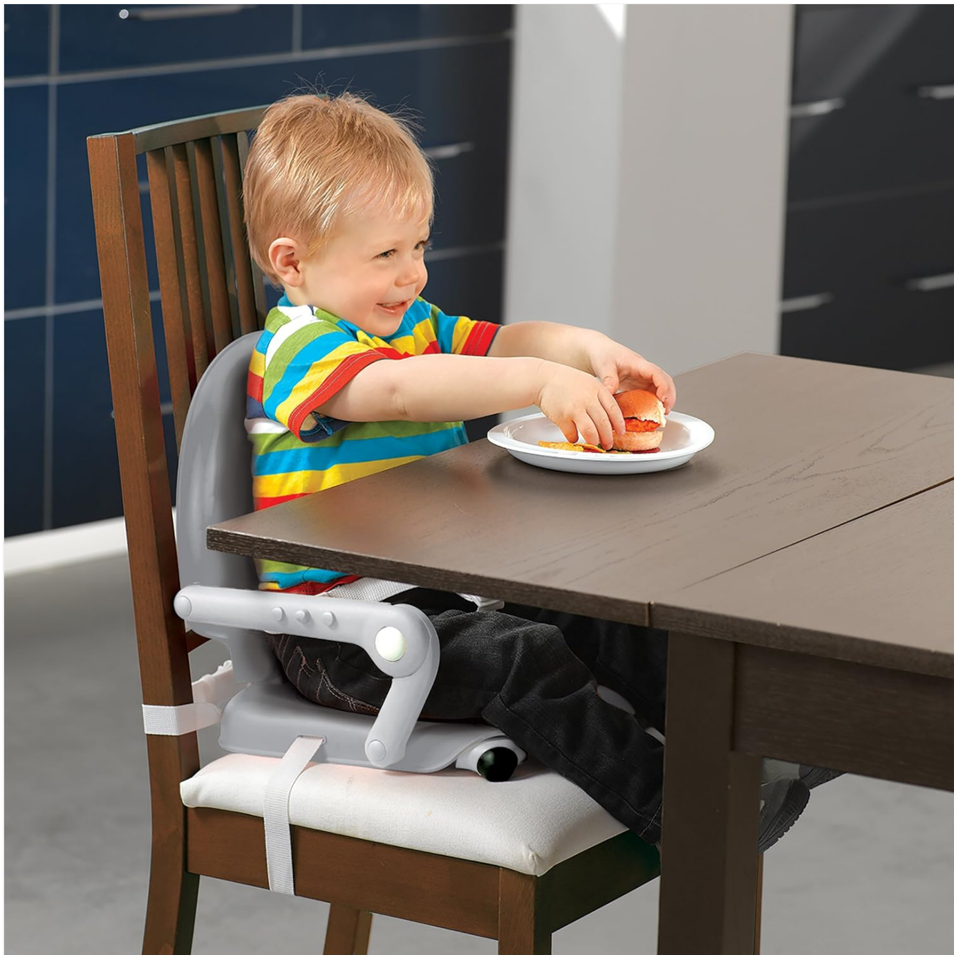
Figure 5: A child comfortably seated in the booster seat at a dining table.