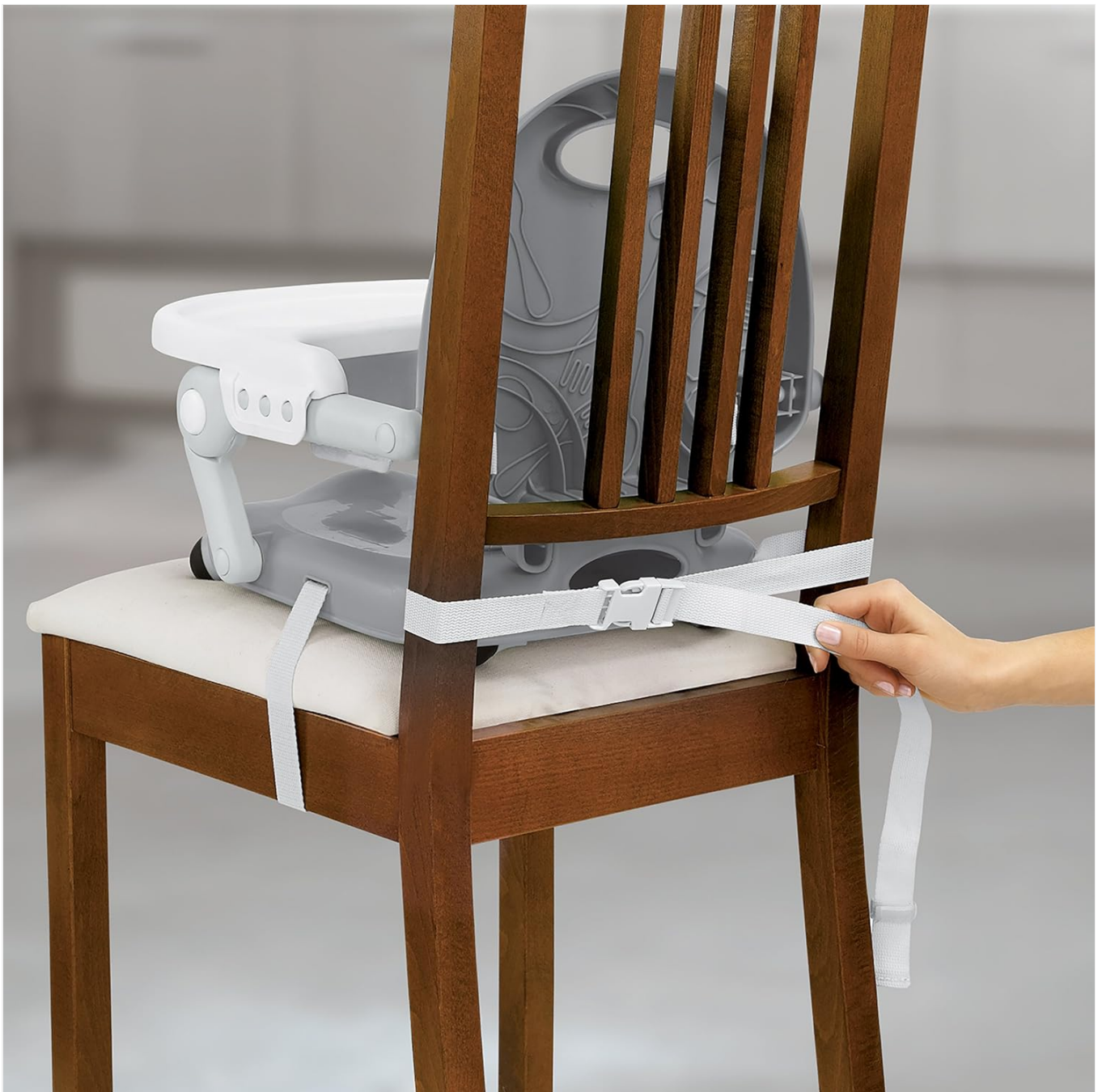
Figure 3: Securing the booster seat to the dining chair's backrest.