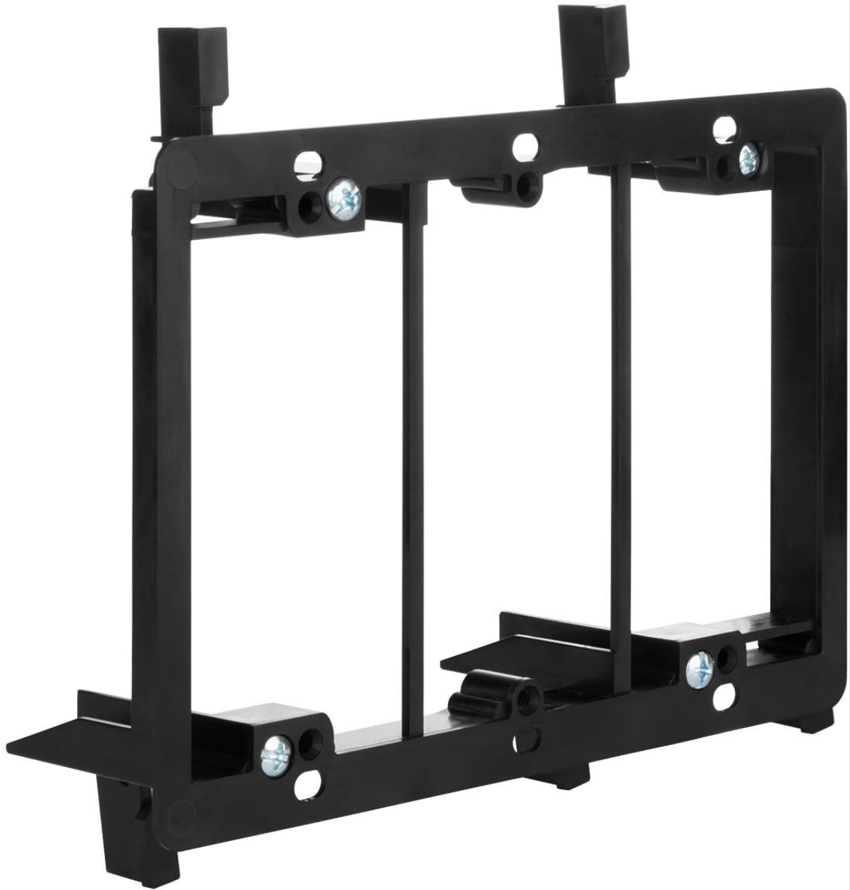
Figure 1: The wall plate is compatible with a standard low-voltage 3-gang bracket (sold separately).