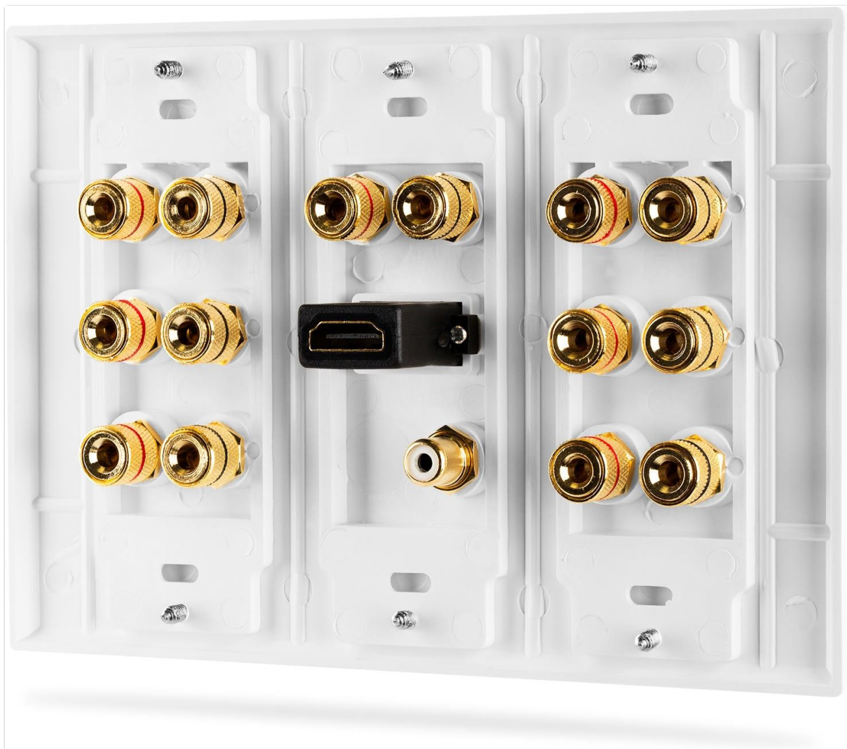
Figure 2: Rear view of the wall plate with binding posts, RCA, and HDMI connections.