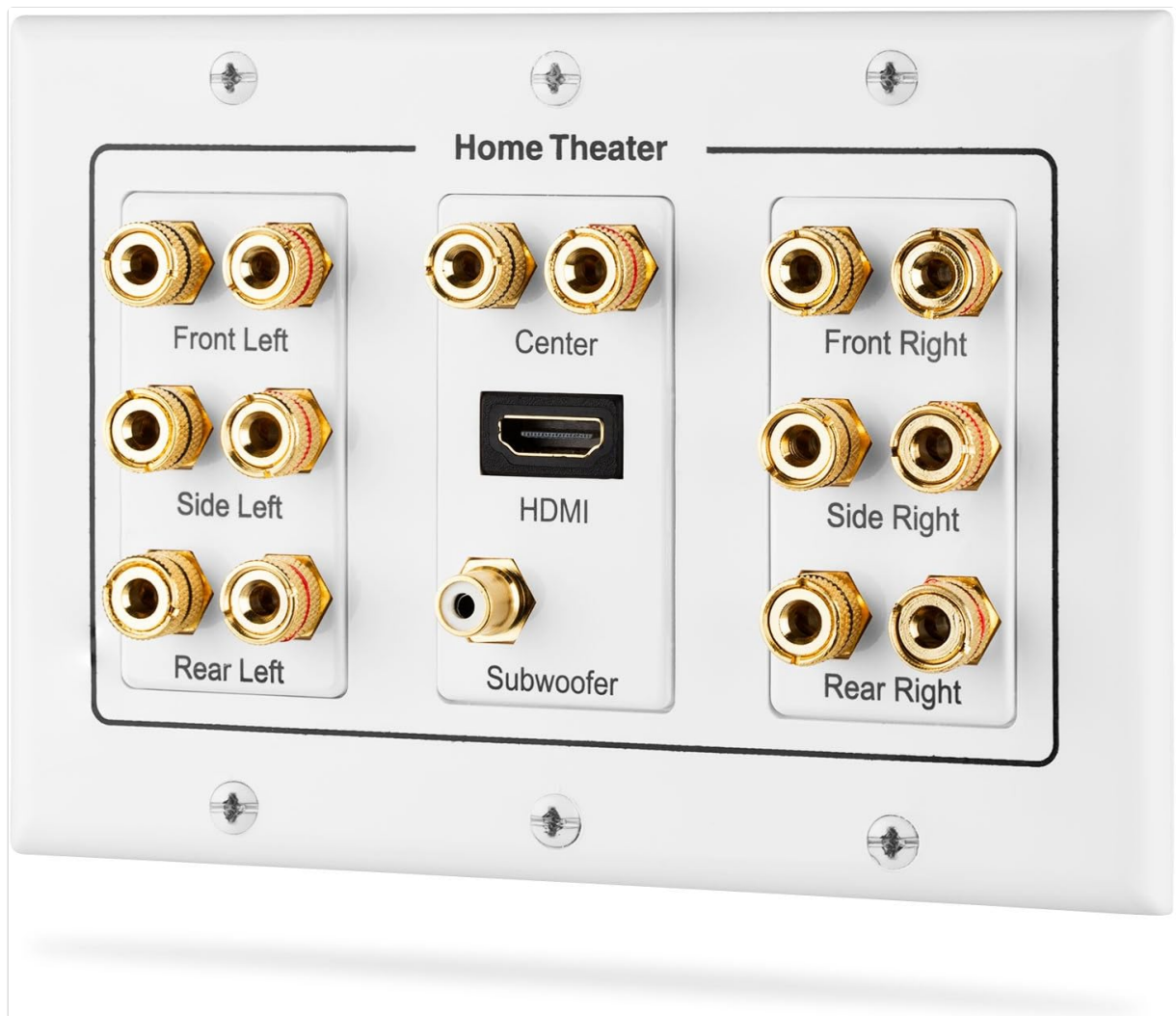
Figure 4: The Fosmon HD8006 wall plate installed, showing front connections.