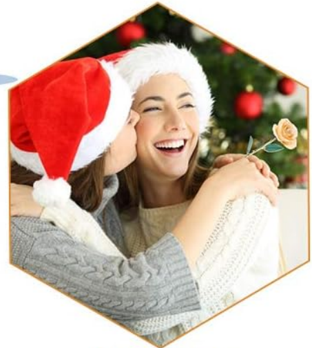
Gift for Sister

The ZJchao 24K Gold Dipped Rose presented within its protective gift box.