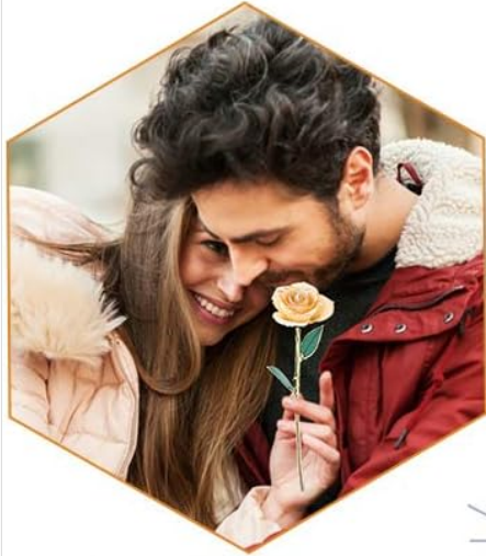
Gift for Girlfriend