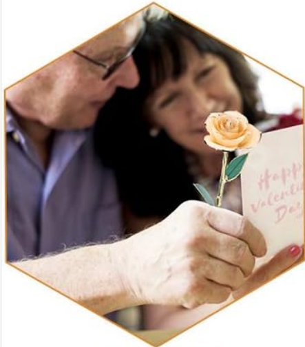
Gift for Wife