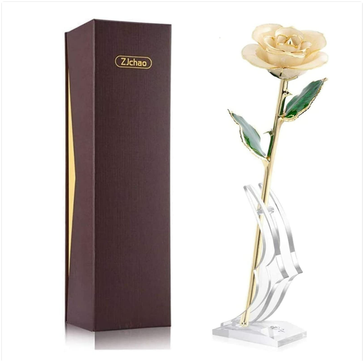
A ZJchao 24K Gold Dipped Rose Flower, showcasing its elegant form and golden finish.