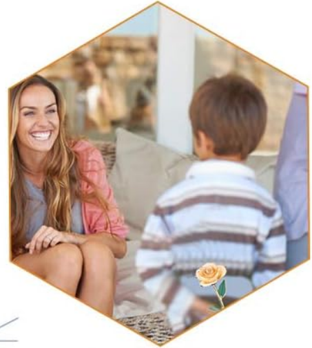
Gift for Mom