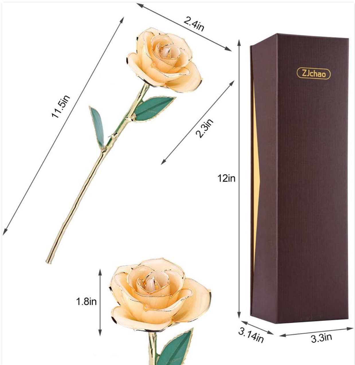
Diagram showing the approximate dimensions of the ZJchao 24K Gold Dipped Rose: 11.5 inches in length, with the rose head approximately 2.3 inches in diameter.