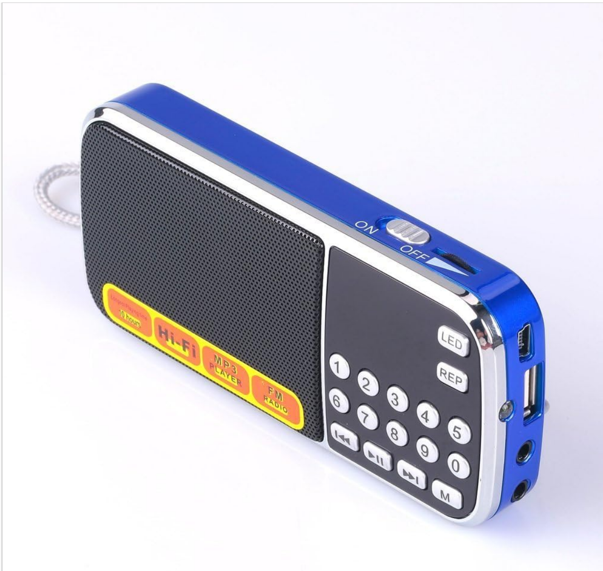
Image: The LETING Portable Mini FM Radio Speaker Model 088, showcasing its compact design with a blue casing, front speaker grille, and control panel.