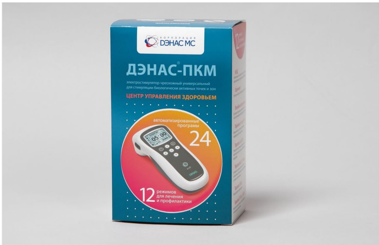
Figure 1: The DiaDens-PCM-4 device packaging. This image shows the retail box, indicating the brand "DENAS MS" and highlighting features such as "24 automated programs" and "12 modes for treatment and prophylaxis" in Russian.