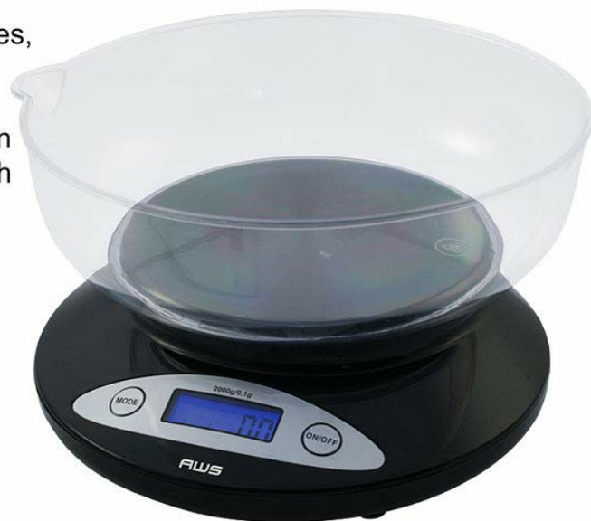
Figure 3: Digital kitchen scale displaying available weighing units. The scale shows options for grams, ounces, troy ounces, and pennyweights.