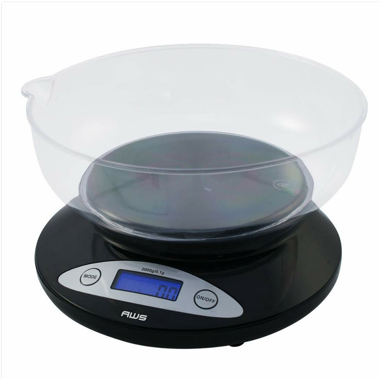
Figure 1: American Weigh Scales Digital Kitchen Scale with Removable Bowl. A black digital kitchen scale with a clear, removable plastic bowl on top, displaying "0.0" on its backlit LCD screen.