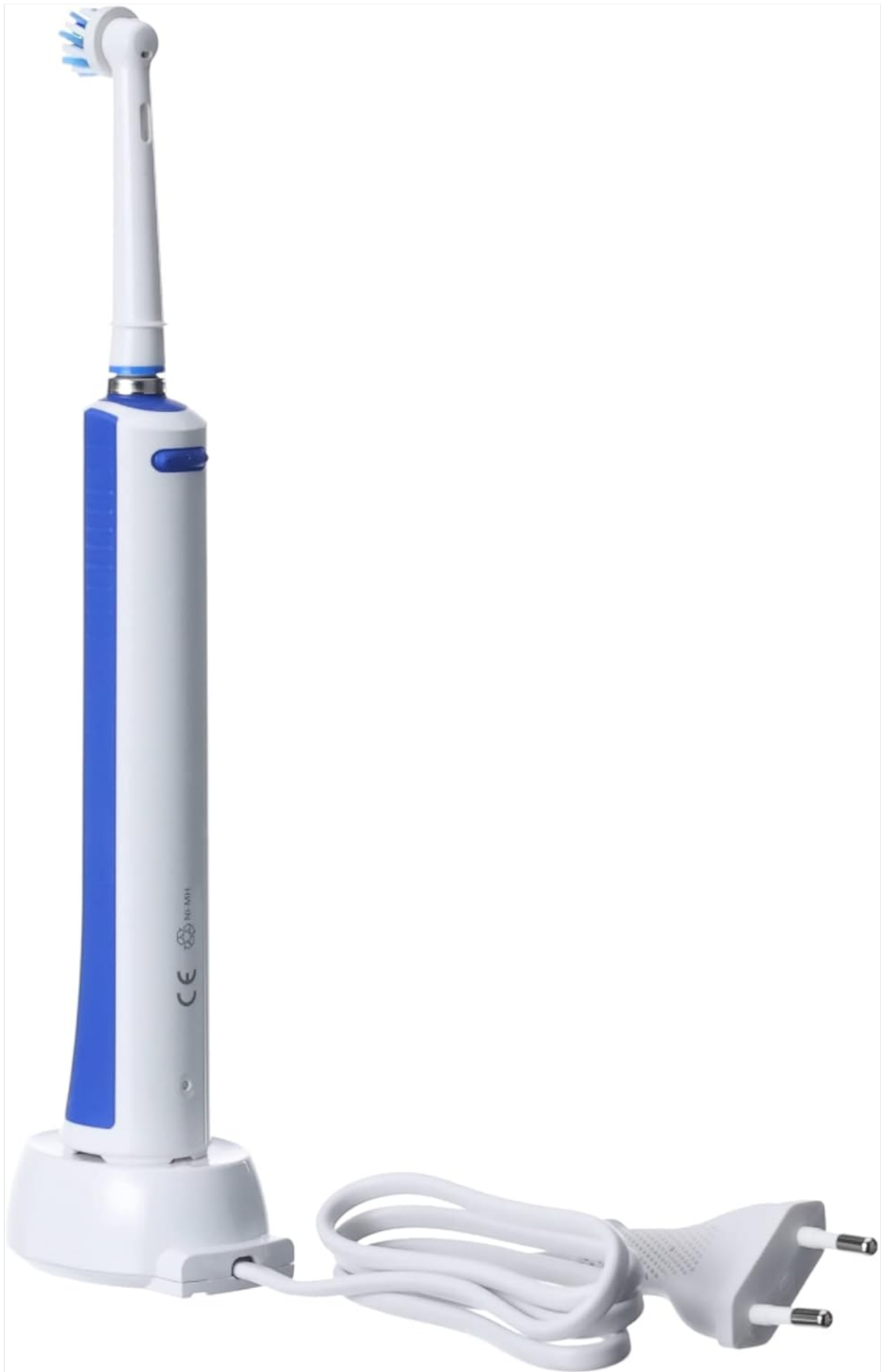
Image: The Oral-B PRO 600 electric toothbrush handle placed on its charging base, ready for charging.