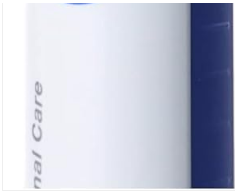
Image: A close-up view of the Oral-B CrossAction brush head securely attached to the electric toothbrush handle.