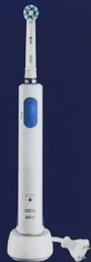
Image: The Oral-B PRO 600 electric toothbrush handle, a CrossAction brush head, and the charging base.

Rechargeable toothbrush Wiederaufladbare Zahnbürste