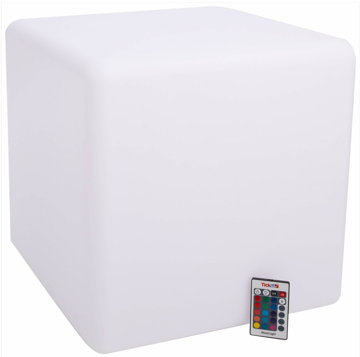
Image: The TickiT 75544 Sensory Mood Light Cube, shown in its unlit white state.