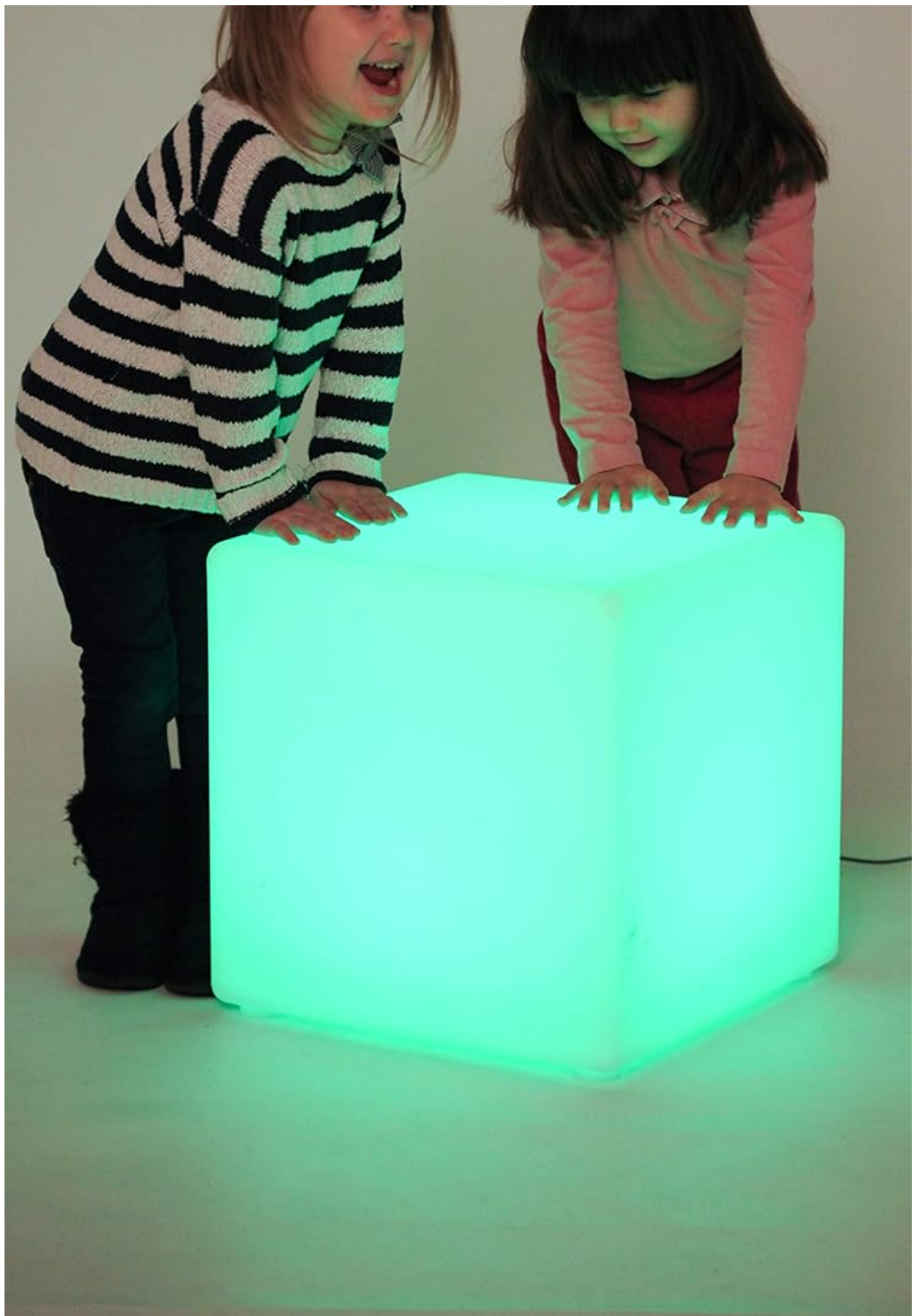
Image: Two children observing the TickiT Sensory Mood Light Cube illuminated in green.