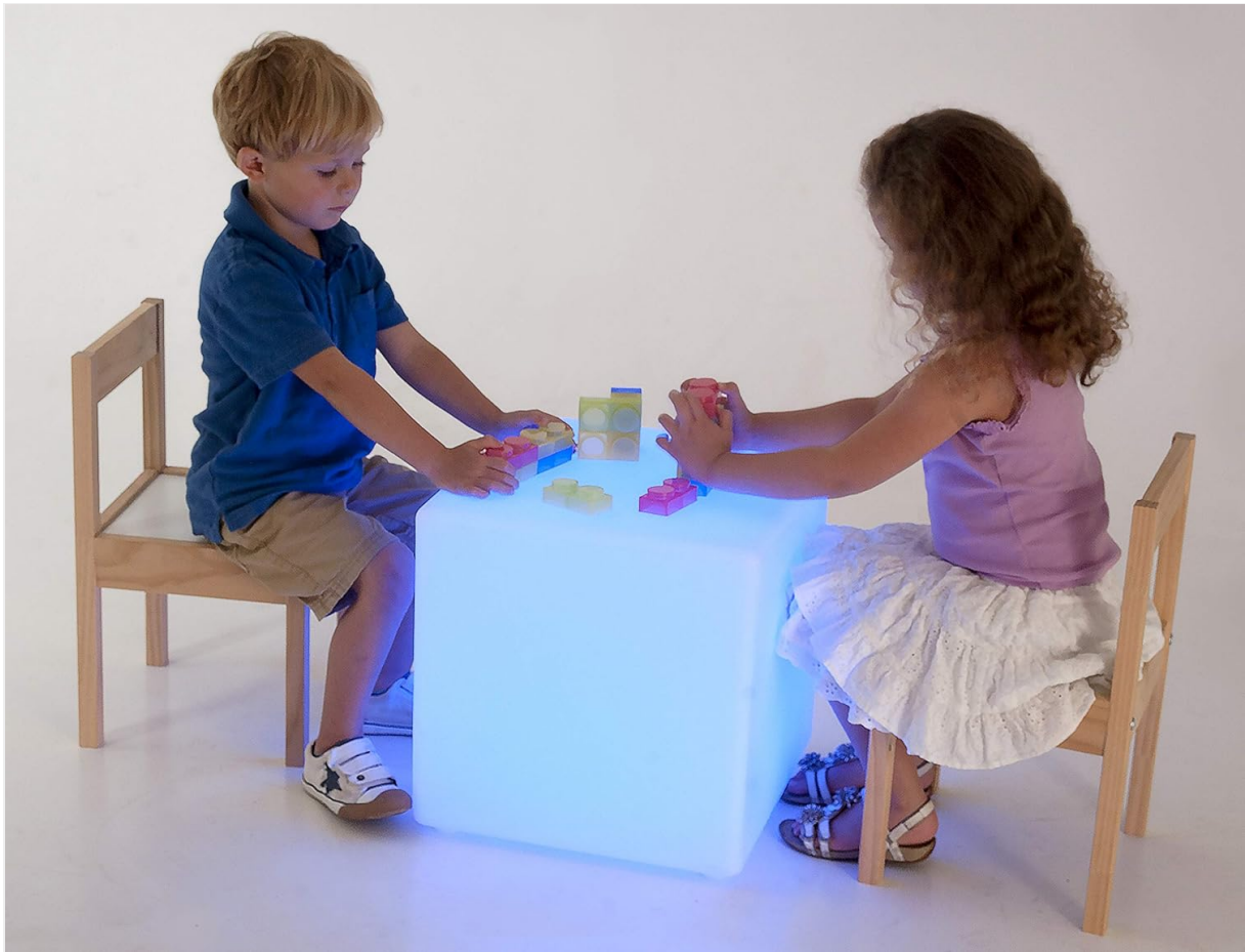
Image: Children using the TickiT Sensory Mood Light Cube as a surface for play, illuminated in blue.