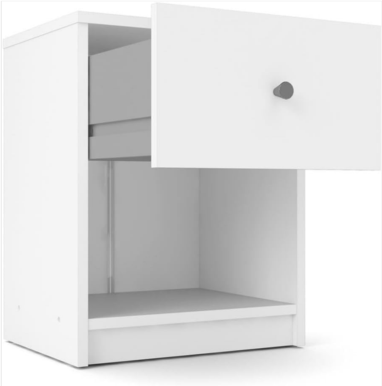
Image 5.1: The nightstand with its single drawer partially open, demonstrating its functionality and storage access.