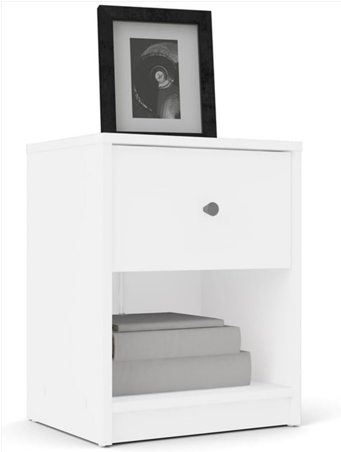
Image 5.2: The nightstand displaying its open shelf with books, illustrating its practical storage capabilities.