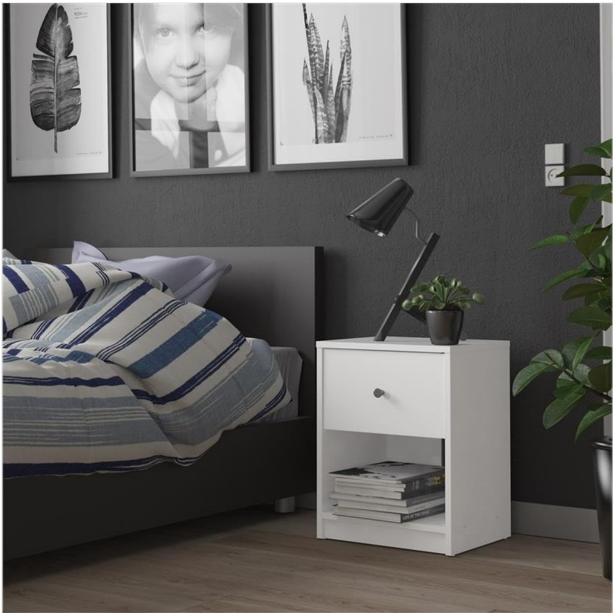
Image 1.1: The Tvilum Portland 1 Drawer Wood Nightstand in a bedroom environment, showcasing its design and functionality next to a bed.