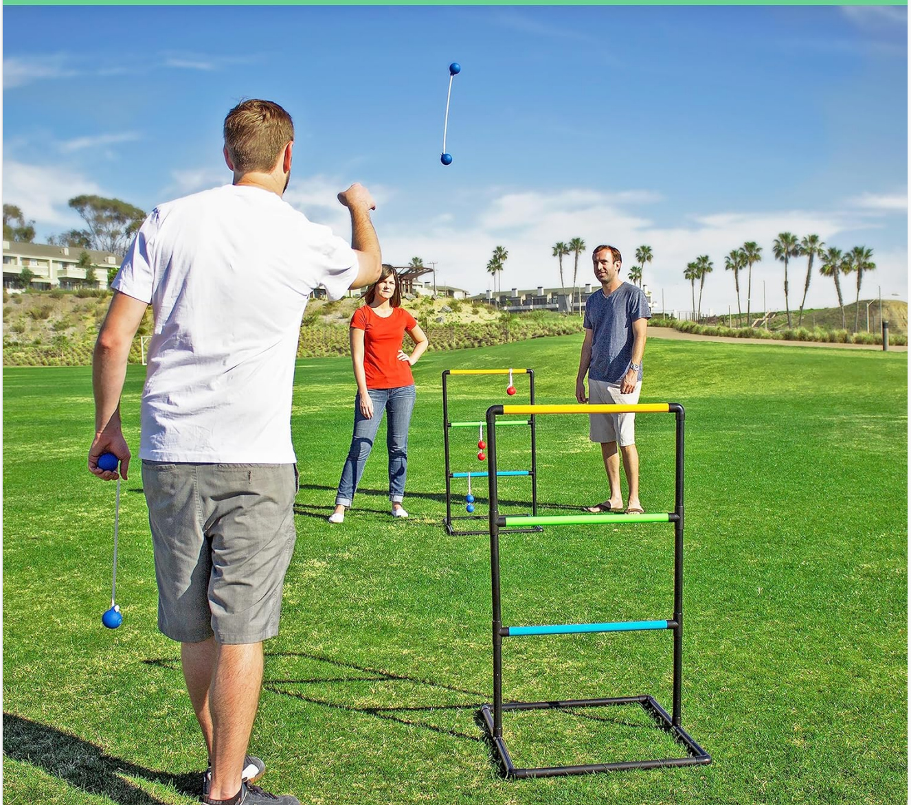
Image: Four individuals engaged in a game of GoSports Ladder Toss on a sunny outdoor lawn, demonstrating active gameplay.