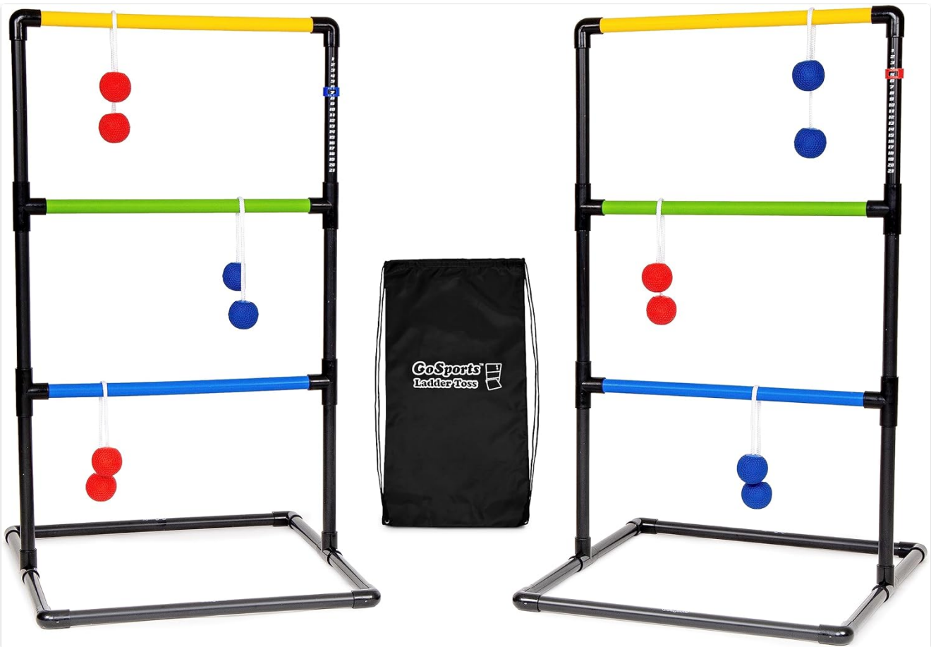
Image: All components of the GoSports Classic Ladder Toss Game Set, including two ladder targets, six soft rubber bolos (three red, three blue), and a black travel carrying case.