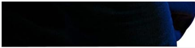
Image: A person holding the SpyX Micro Voice Disguise & Recording Toy to their mouth, demonstrating its use for voice recording or playback. The device is black with red buttons and silver accents.