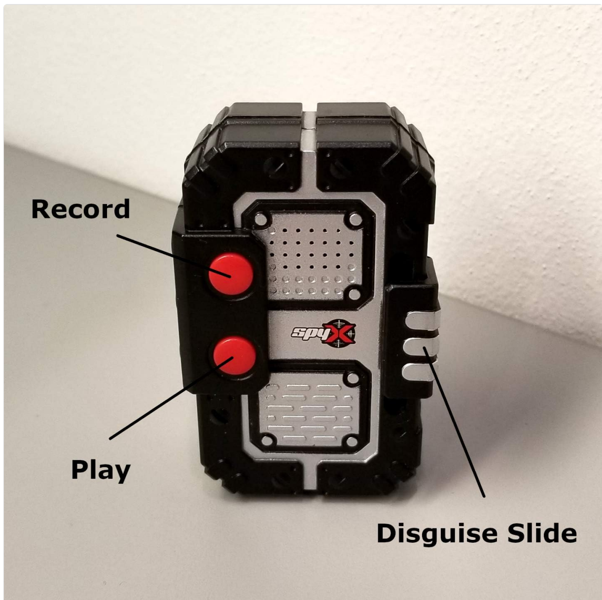
Image: A close-up view of the SpyX Micro Voice Disguise & Recording Toy, highlighting its main controls. The top red button is labeled 'Record', the bottom red button is labeled 'Play', and the silver slider on the side is labeled 'Disguise Slide'.