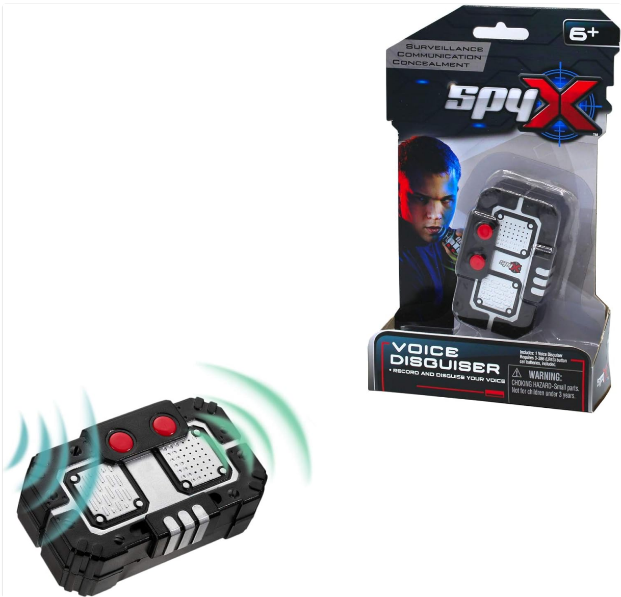
Image: The SpyX Micro Voice Disguise & Recording Toy, shown both in its retail packaging and as a standalone unit. The standalone unit is black with silver accents and red buttons, emitting green sound waves.