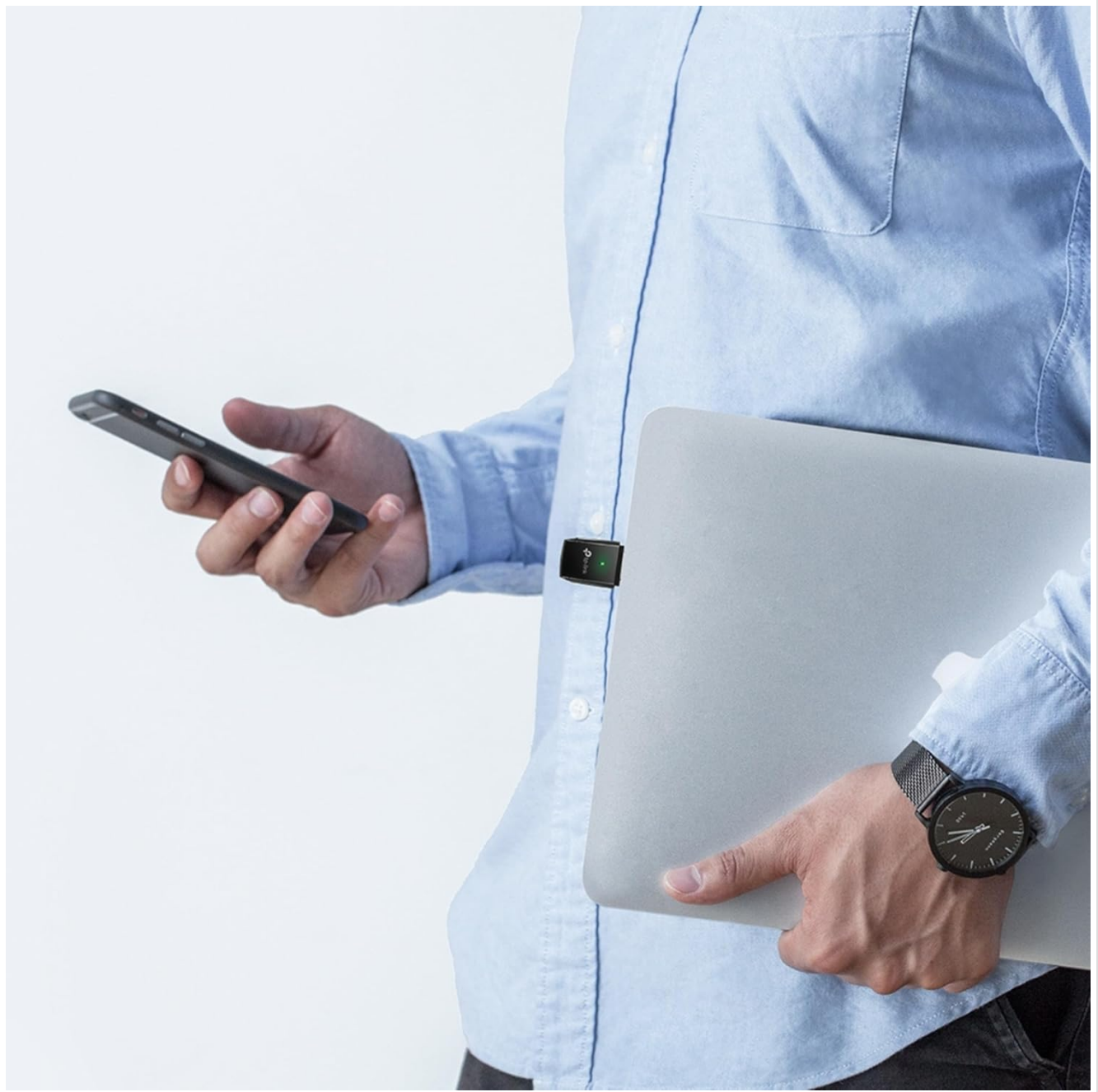
Figure 4: Adapter in use with a laptop