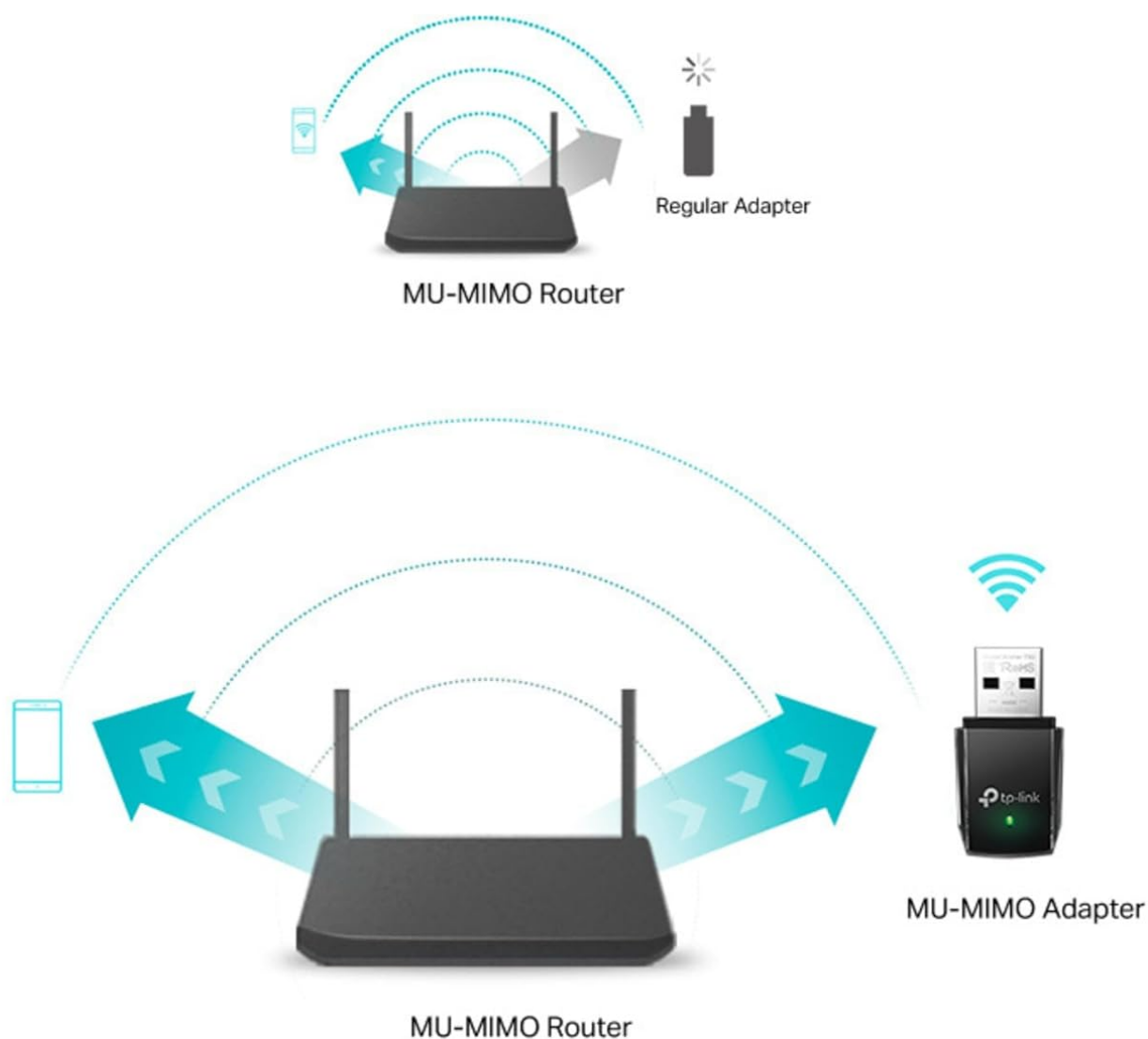
Figure 5: Boosted Throughput with MU-MIMO