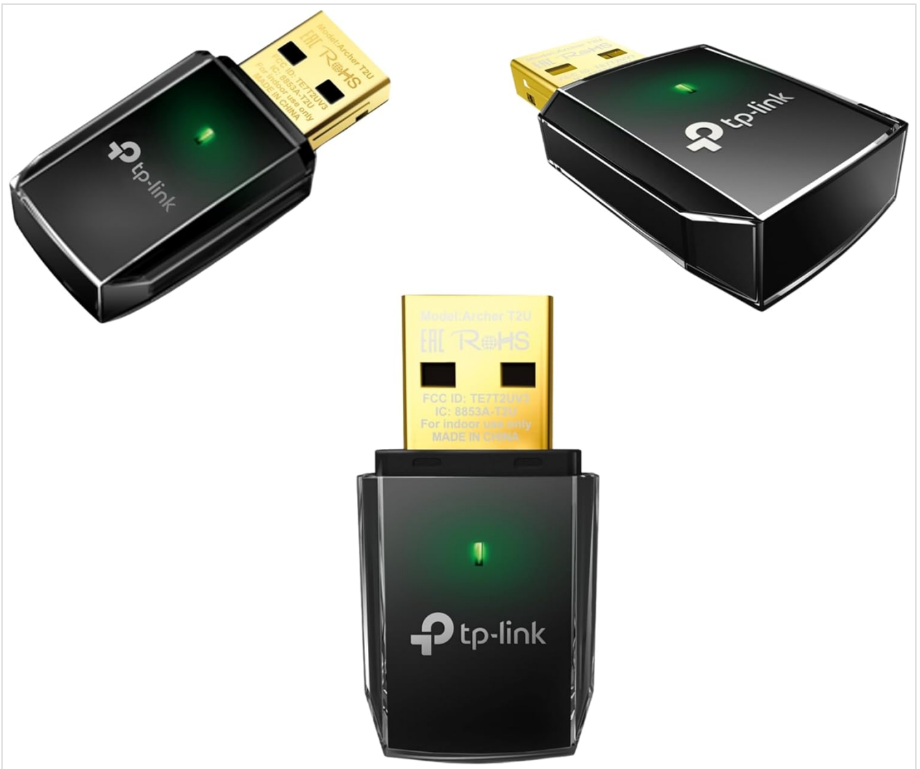
Figure 1: TP-Link Archer T2U USB WiFi Adapter