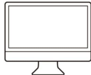
Figure 2: Easy Setup Steps